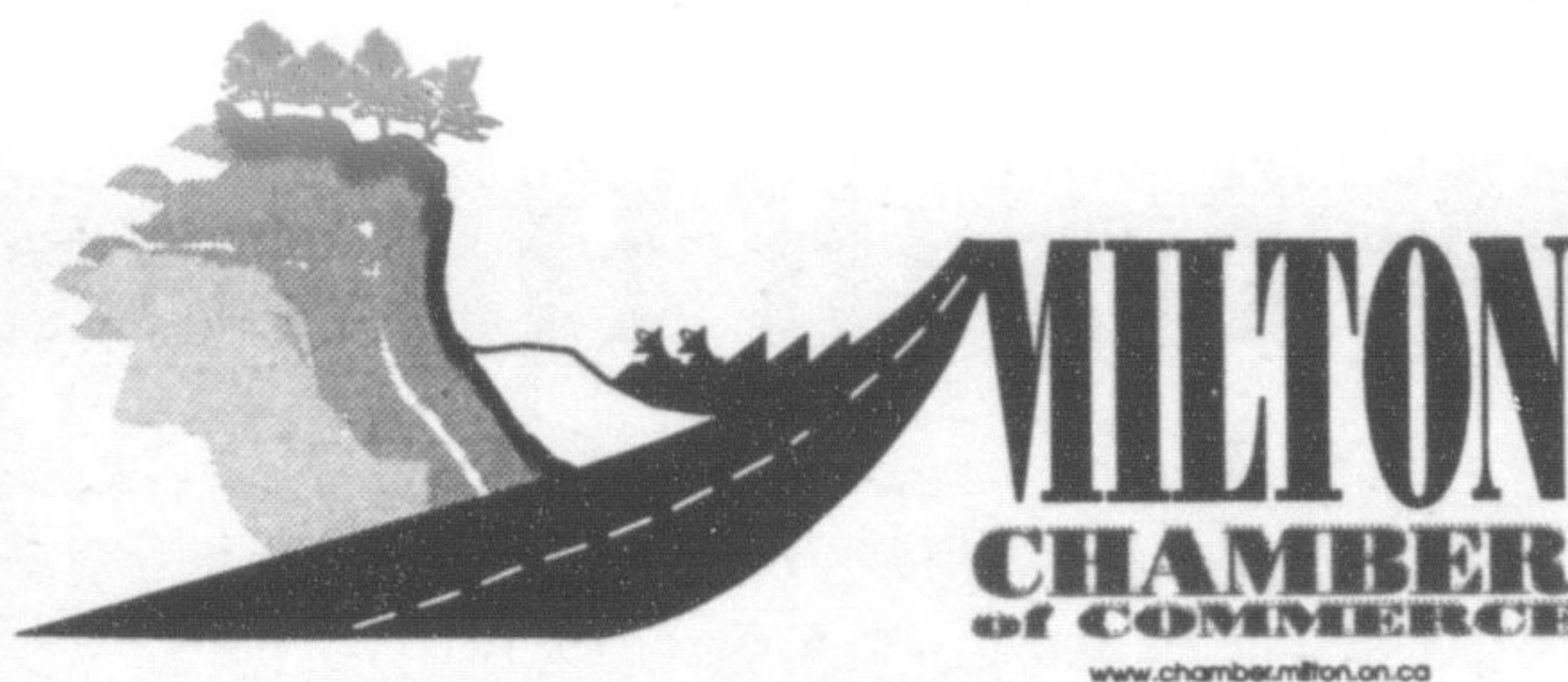
Logo designed by Shoot Photographic

375 Wheelabrator Way, Milton (905) 875-1427 (416) 798-7099