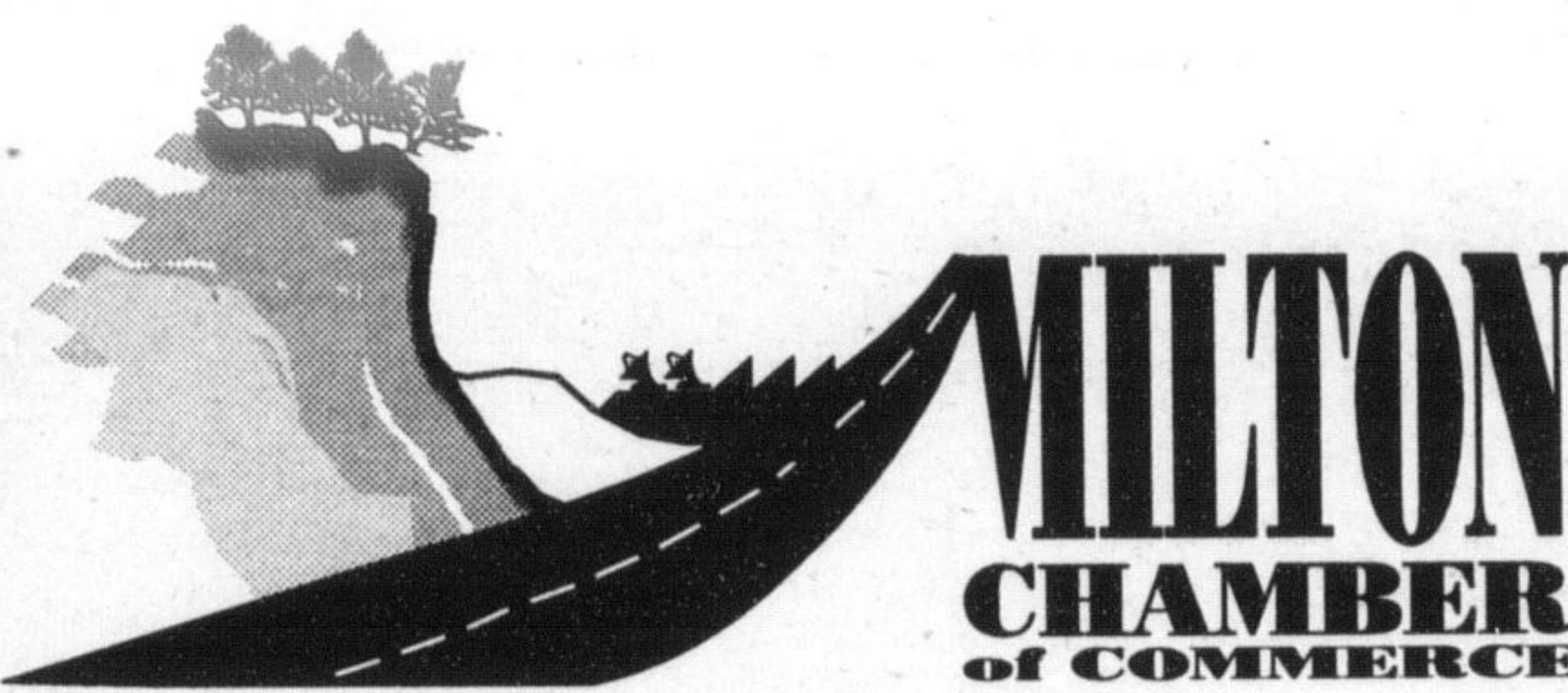
Logo designed by Shoot Photographic

375 Wheelabrator Way, Milton (905) 875-1427 (416) 798-7099