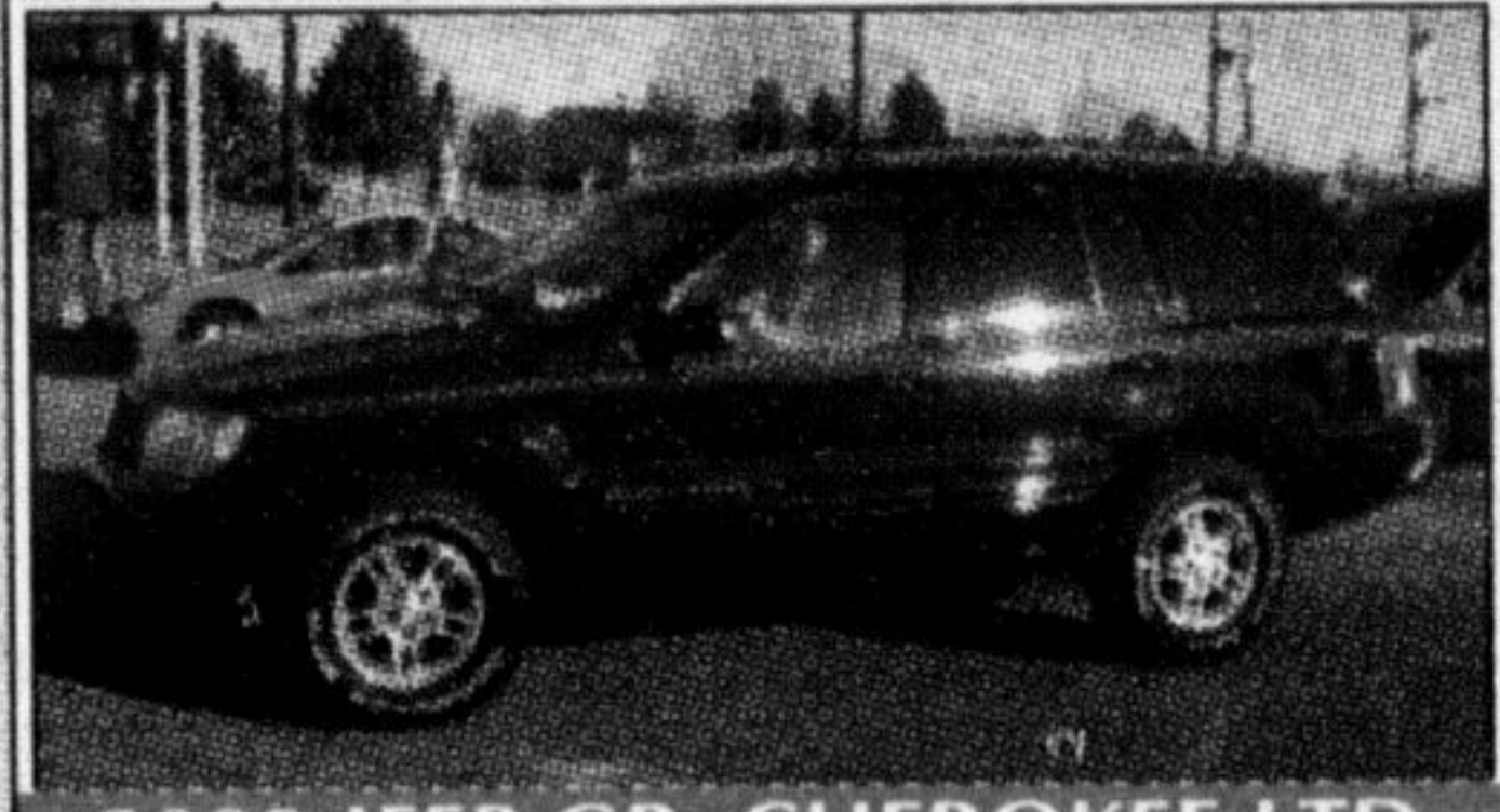
2000 JEEP GR. CHEROKEE LTD. Fully equipped, leather, power sunroof, 17,000 kms, bal. of factory warranty. Cash sale price. $41,995*