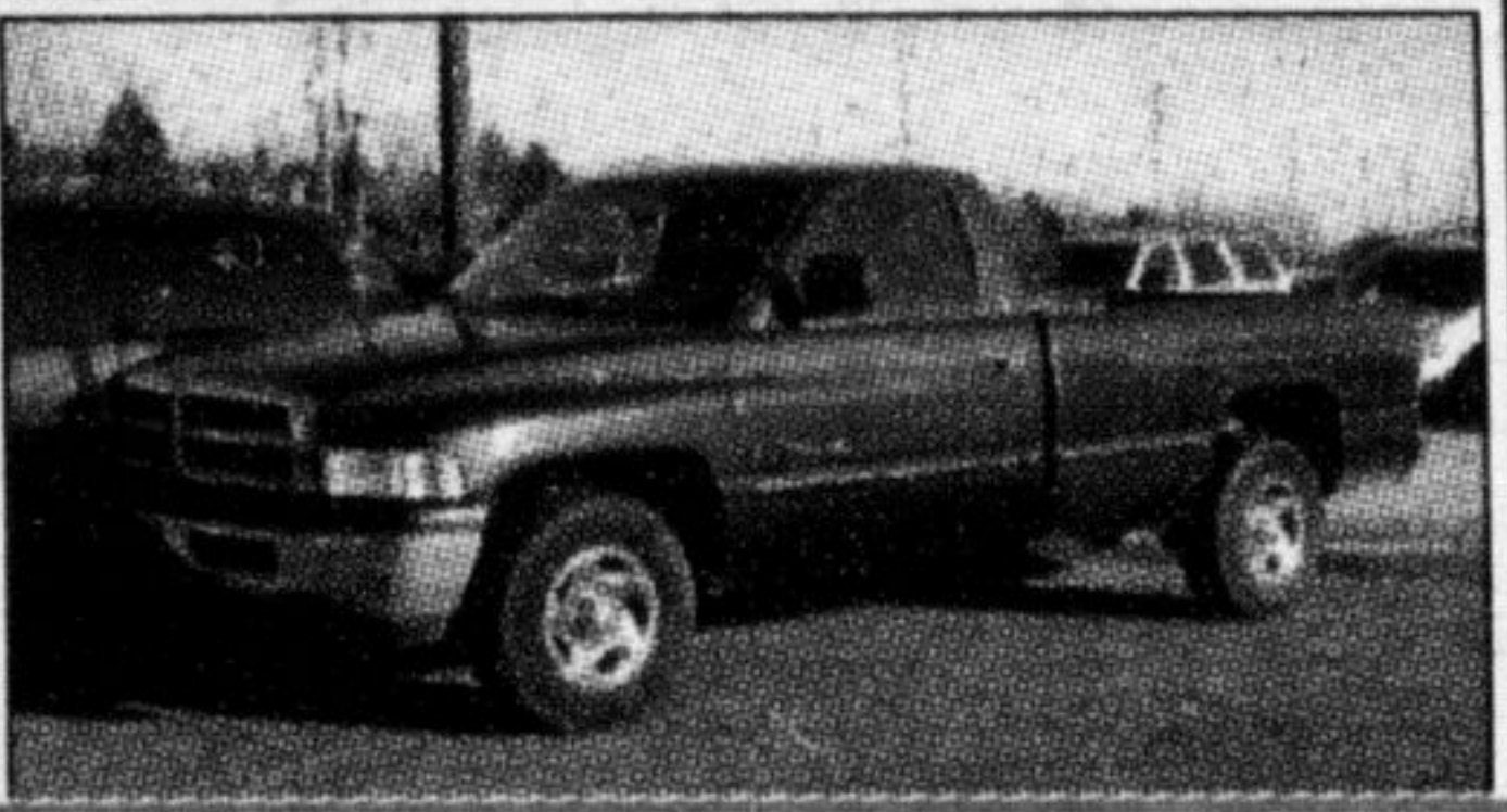
1998 DODGE 1500 PK UP 2 DR 8 cyl., air cond, auto, boxliner, 66,000 kms. Green in colour. $16,995*