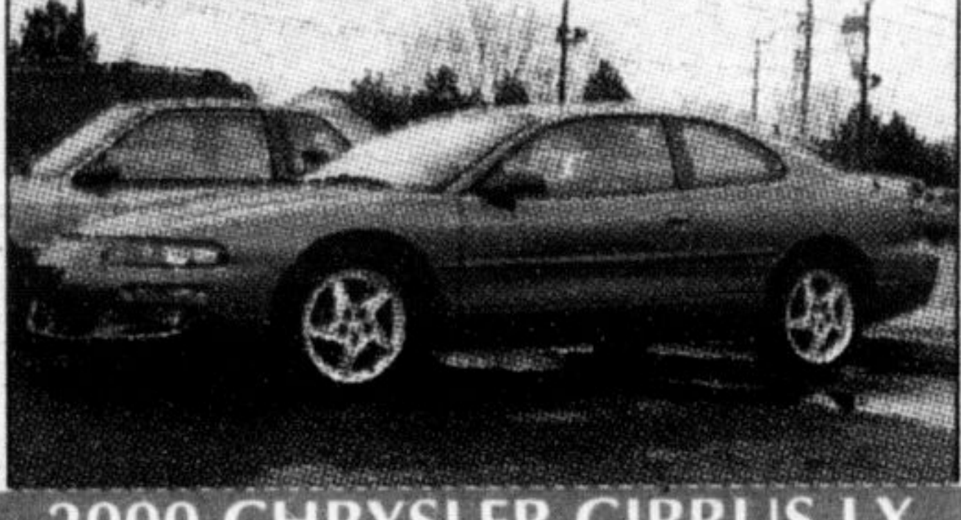
2000 CHRYSLER CIRRUS LX Only 28,000 km, Auto, Air, PW, PLocks, Cruise, Tilt $15,995*

* Bank rate is 9.9% Ex $10,000 over 48 mths, Payment $215.95, Interest charge $2,957.25 O.A.C. (Cannot be combined with special interest rates offered by Chrysler Canada.) * All Taxes Extra & Lic. Fee.