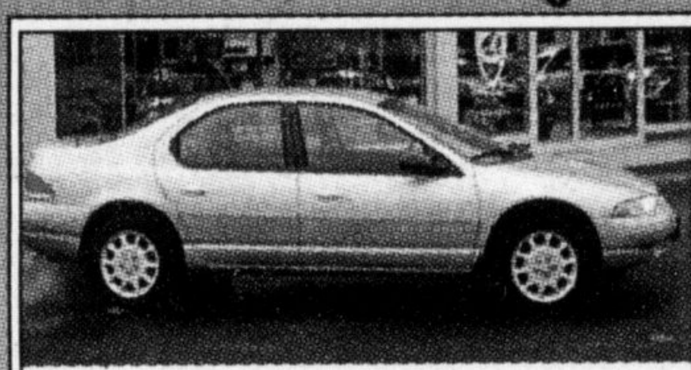
2000 DODGE AVENGER ES 6 cyl., Auto, PW, PL, Tilt, Cruise, only 53,000 kms $15,995*