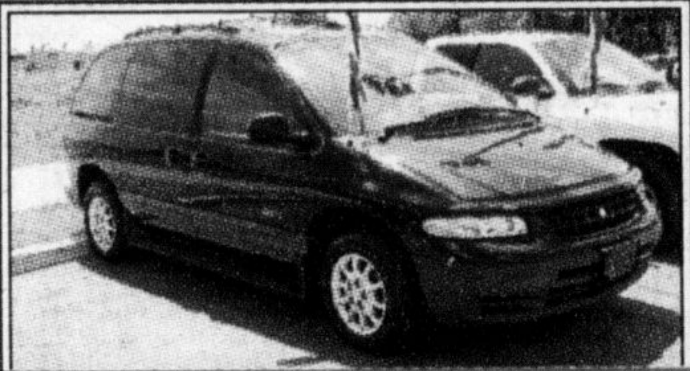
1998 VOYAGER 6 cyl., auto, air, p. locks, AM/FM, 42,000 k, tilt, cruise control $15,995*