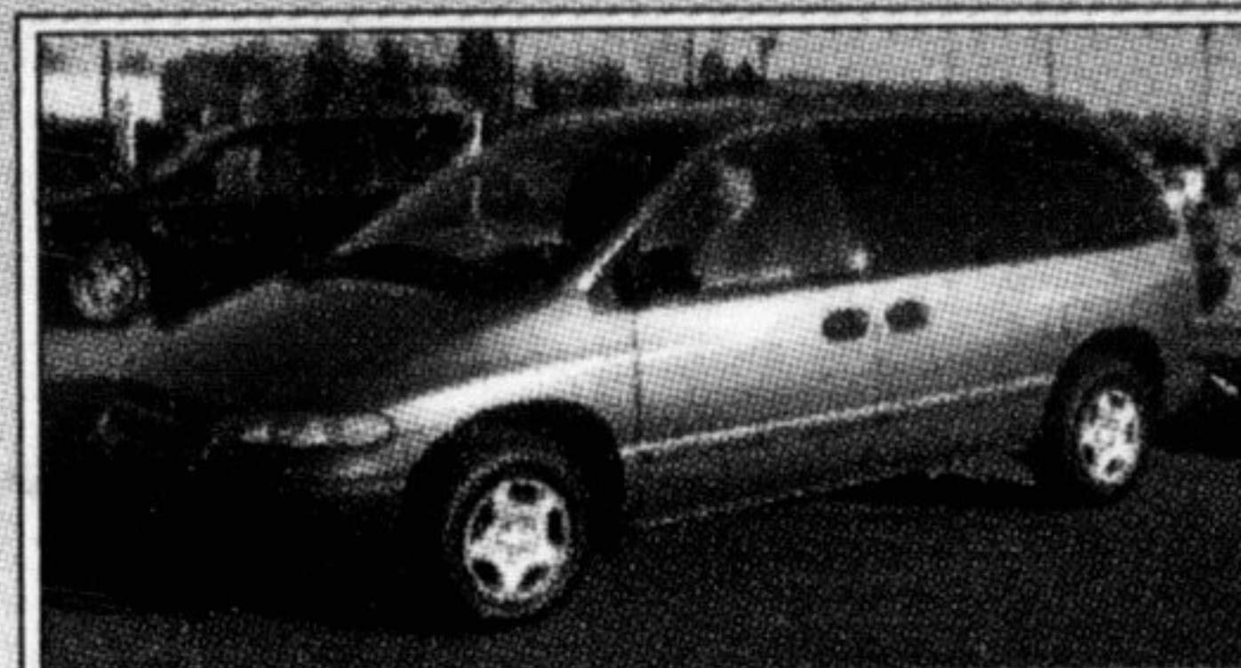
1998 CARAVAN Alpine green, 6 cyl., auto, air, p'lock, tilt, cruise, balance of factory warranty. 51,000 kms $15,995*