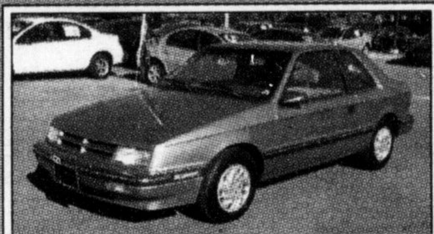
1992 DODGE SHADOW 2 DR 4 cyl., auto, air cond. PS, PB, great car for the kids $3,995*