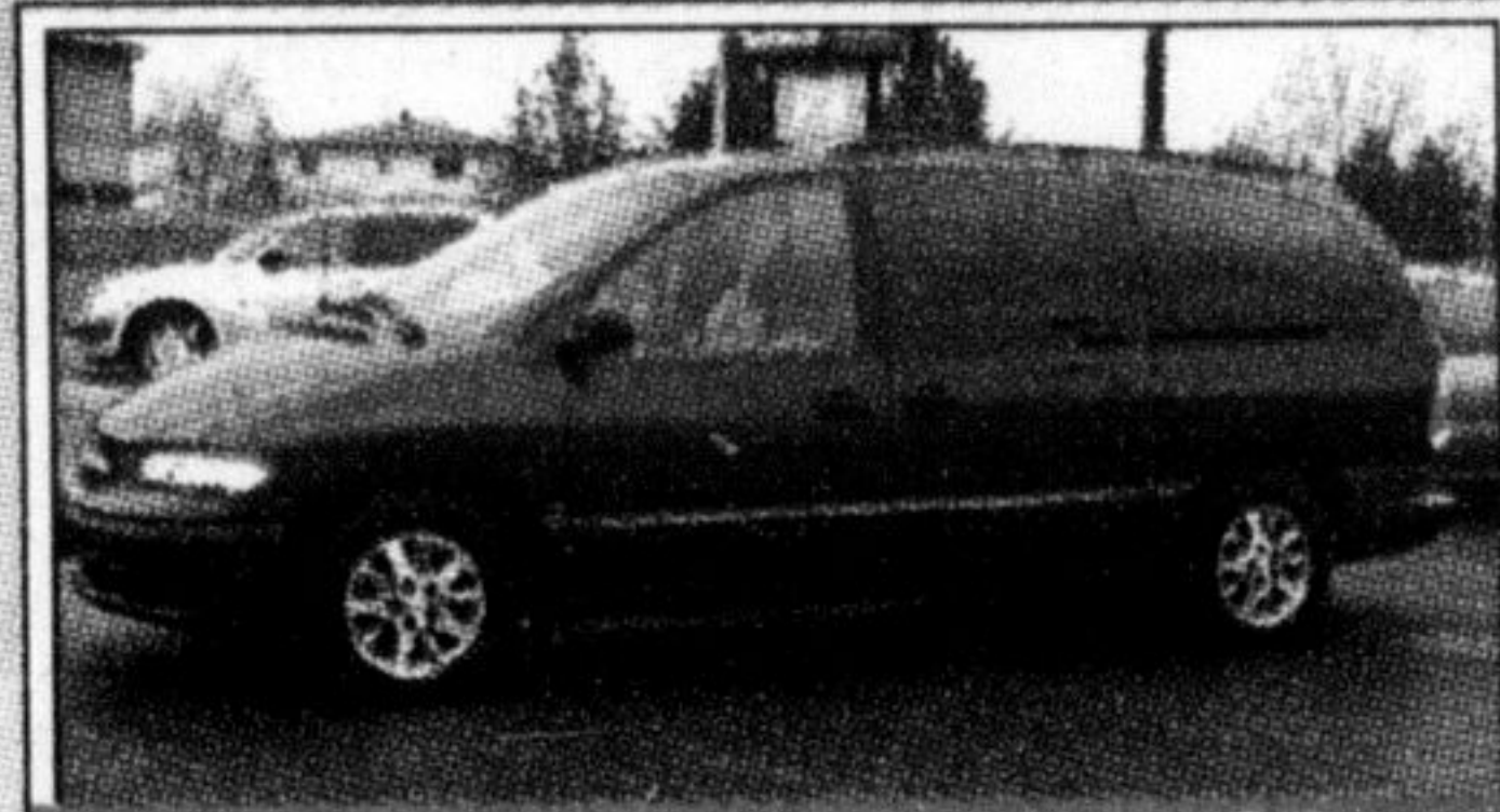
1996 GR CARAVAN SE 3.3 Litre 6 Cyl., Auto, Air, PW, PL, Tilt, Alum Wheels, Child Bench Seat $14,995*