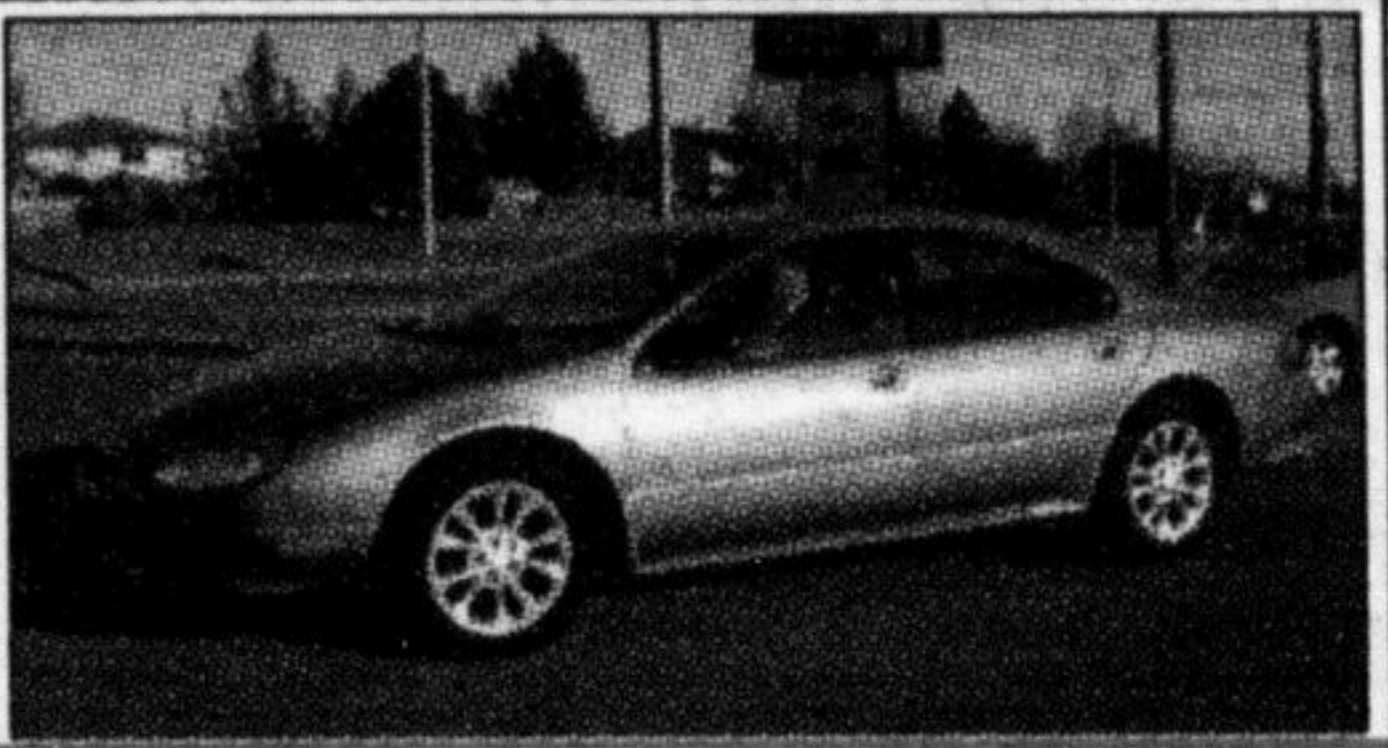
1999 CHRYSLER LHS Fully equipped, leather interior, bal. of warranty. Only 34,000 kms $26,995*