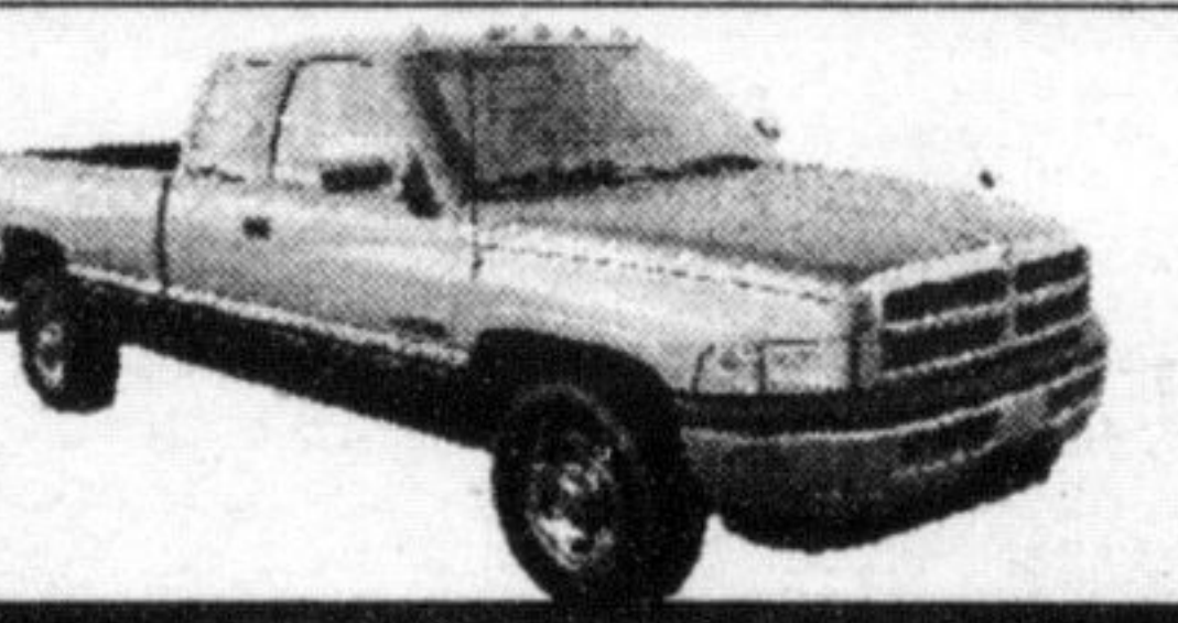
1996 DODGE RAM

2500 HD, cummings, turbo diesel. Ext cab/long box, 4x2. Only 68,000 km. Loaded. Trail tow package.