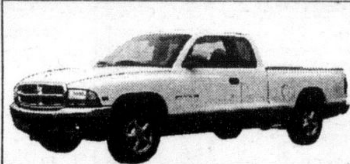
1999 DODGE DAKOTA SLT CLUB CAB 4X2

Well equipped. 3.9L SMP V6, 4-sp, auto, tilt, cruise, 40/20/40 split bench, fog lamps, two-tone paint, box liner and more, balance of factory warr.