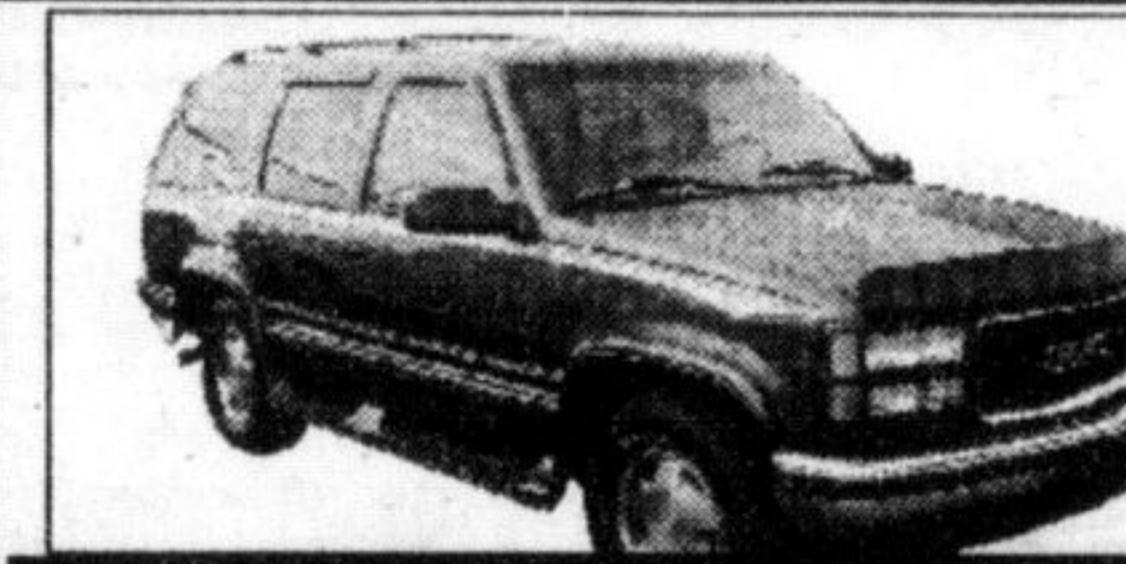
1996 GMC YUKON SLT STARCRAFT

4x4, 5.9L, V8. Wow what a truck. Primrose metallic/neutral leather. 91,000 km. Will not disappoint.