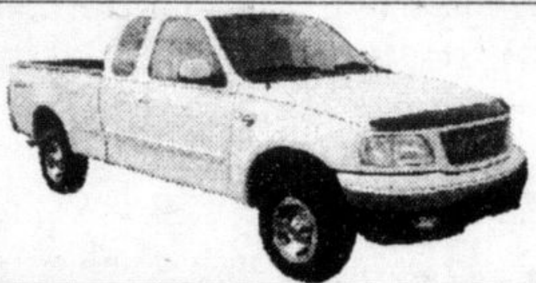
1999 FORD F-150 XLT SUPER CAB 4X4

TRUCKS, SUV'S & MINI VANS Come & see our great selection of pre-owned vehicles. All prices have been reduced!