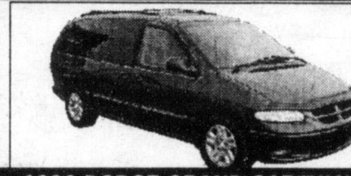
1996 DODGE GRAND CARAVAN ES

Top of the line. 3.8 L, V6. Cherry red/grey inter. 4DR, keyless entry, capt. chairs, P.seat, P.W, P.L, tilt, cruise, privacy tint, roof rack, c/d player, alloys & more!