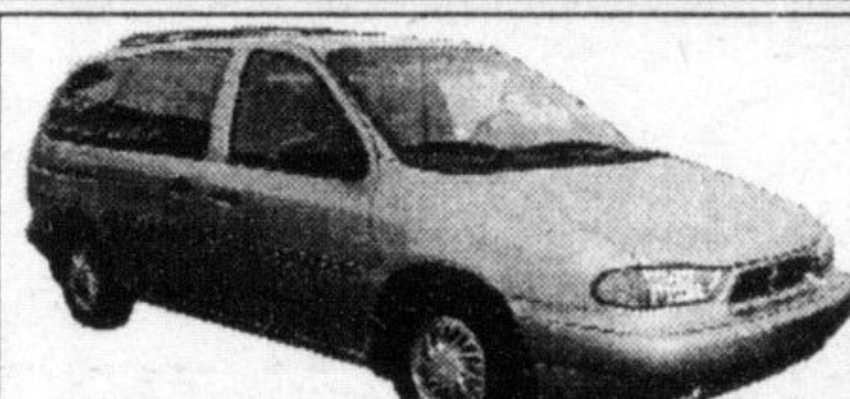
1998 FORD WINDSTAR GL

Blue w/ grey inter., 38,000 km, bal. of f. warr. Features incl. 3.8L VG, capt. chairs, rear audio control, privacy tint, roof rack, alloy rims, A/C, P.W, P.L, tilt, cruise.