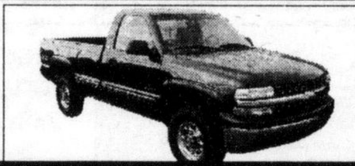
1999 CHEV 2500 SILVERADO-HD

4x4, 6L, V8, 51,000 km, 8600lbs GVW. Dark blue/charcoal grey inter., P.S, P.B, tilt, cruise, alloy rims. ABS, A/C, bal. of f. warr. Hard to find.