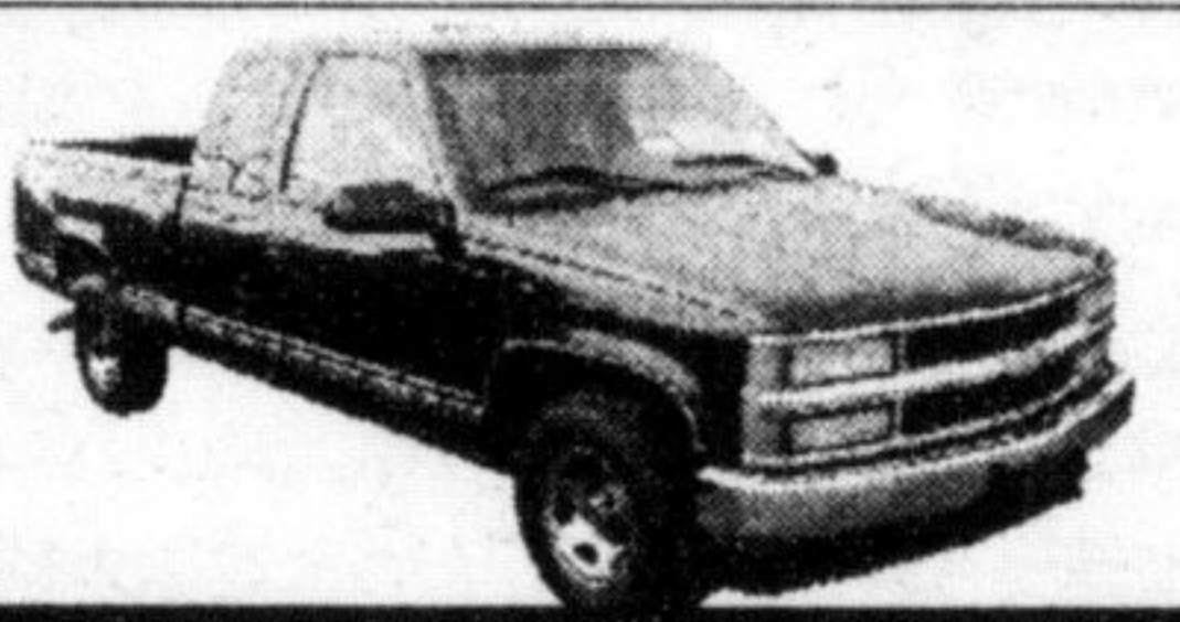
1998 CHEV 1500 CHEYENNE

Thunder edition, ext. cab, 4x2, 5.0L V8, 60/40 split, bench, tilt, cruise, A/C, chrome polished alloy rims, box liner, floor carpets and more.