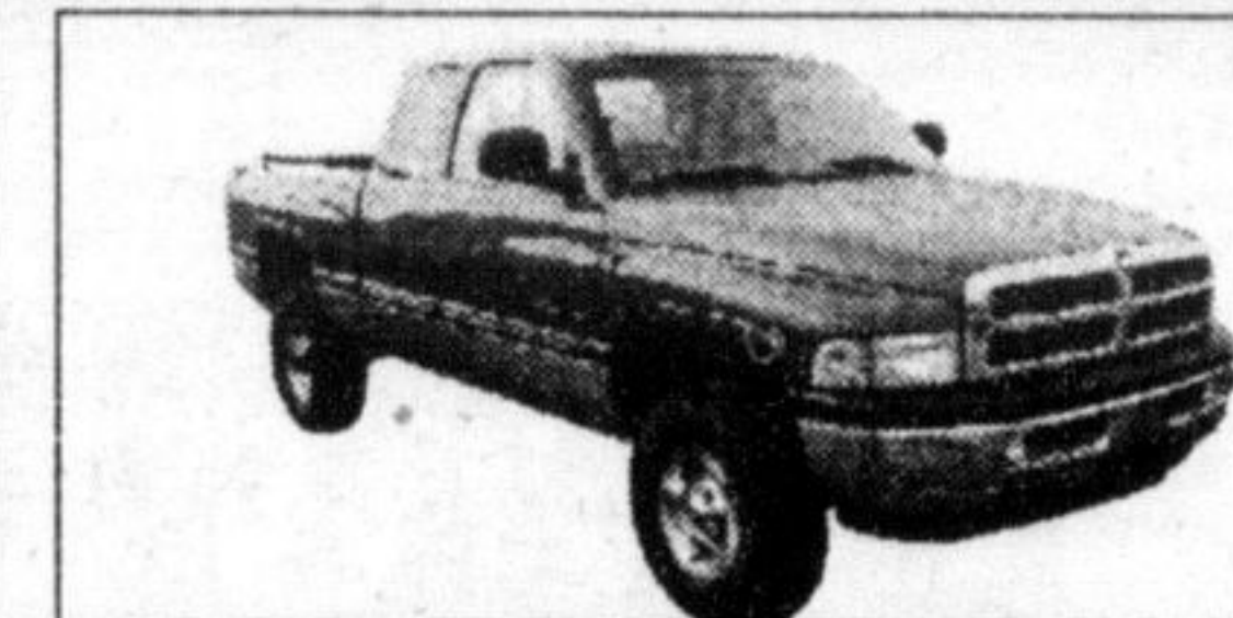
2001 DODGE RAM 1500 SLT LARAMIE

Quad cab, 4x4, V8, 5.9L, red & silver two tone. Loaded. Save thousands from new. 4600 km, balance of factory warranty.