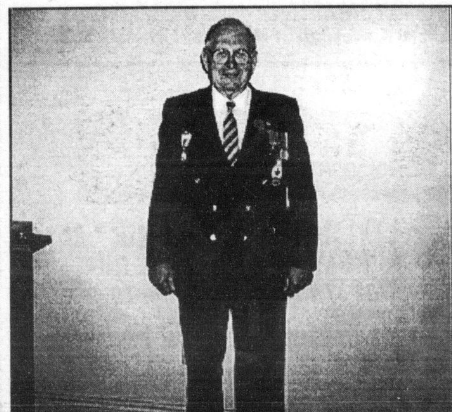
✓ Mr. Jack Charlton