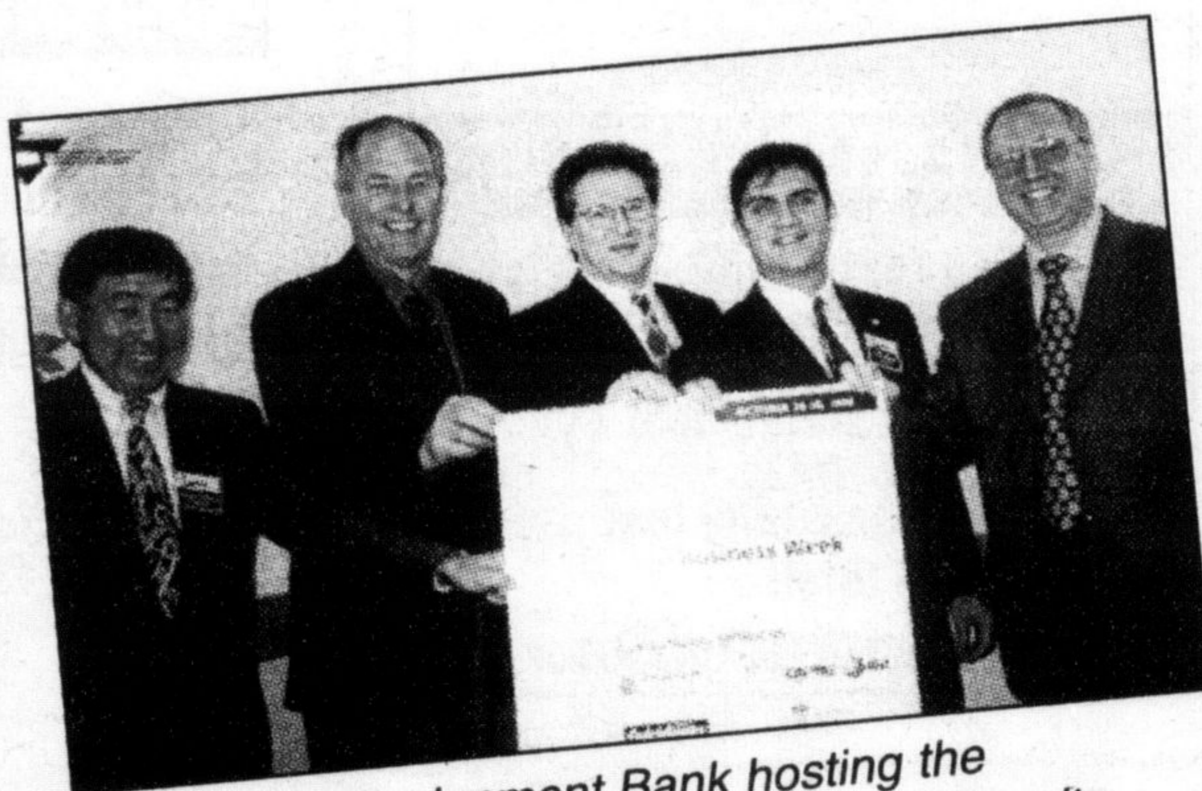
Business Development Bank hosting the Celebration of Excellence luncheon at Granite Ridge October 1999.