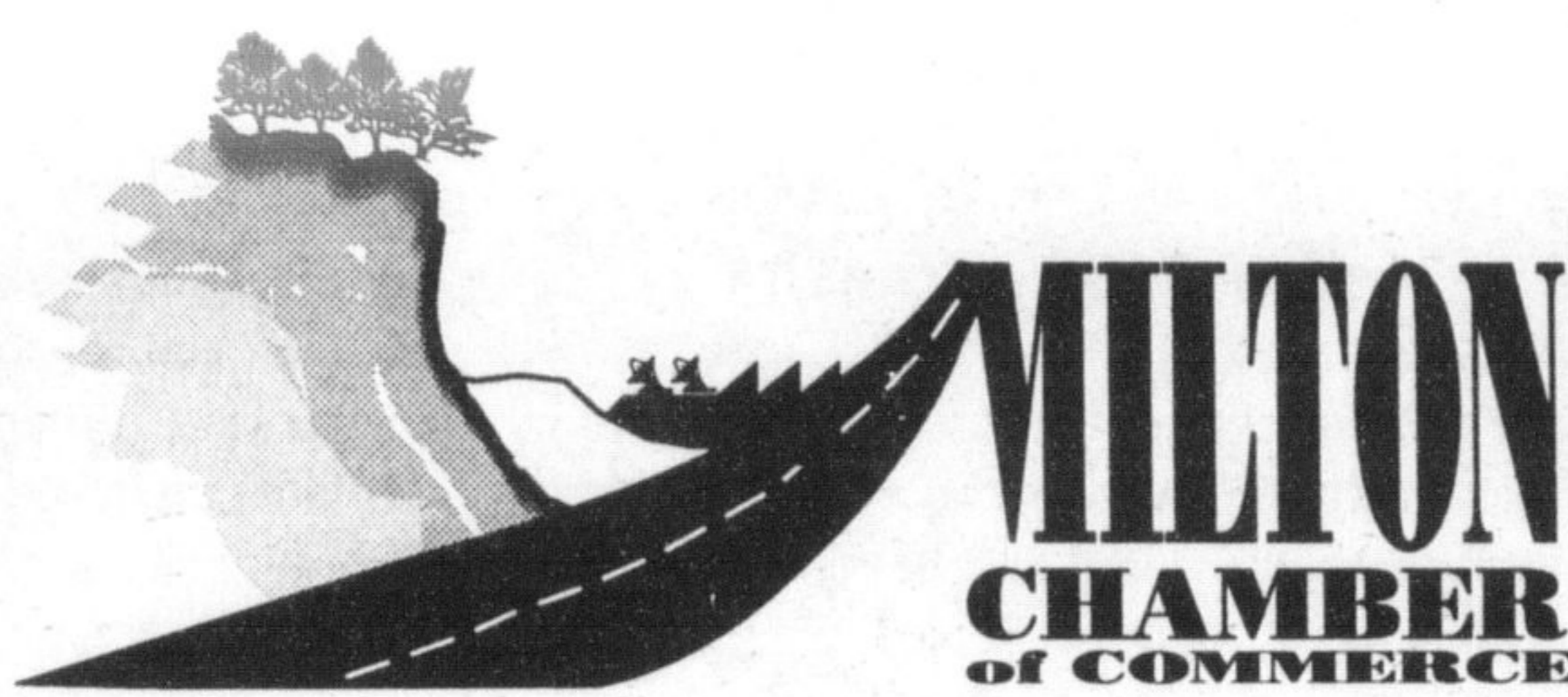
Logo designed by Shoot Photographic

375 Wheelabrator Way, Milton (905) 875-1427 (416) 798-7099