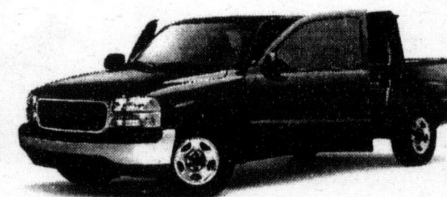
SIERRA EXTENDED CAB