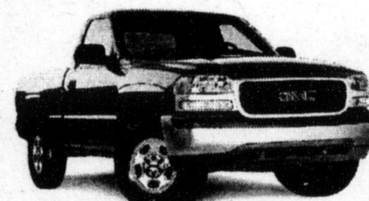
SIERRA REGULAR CAB