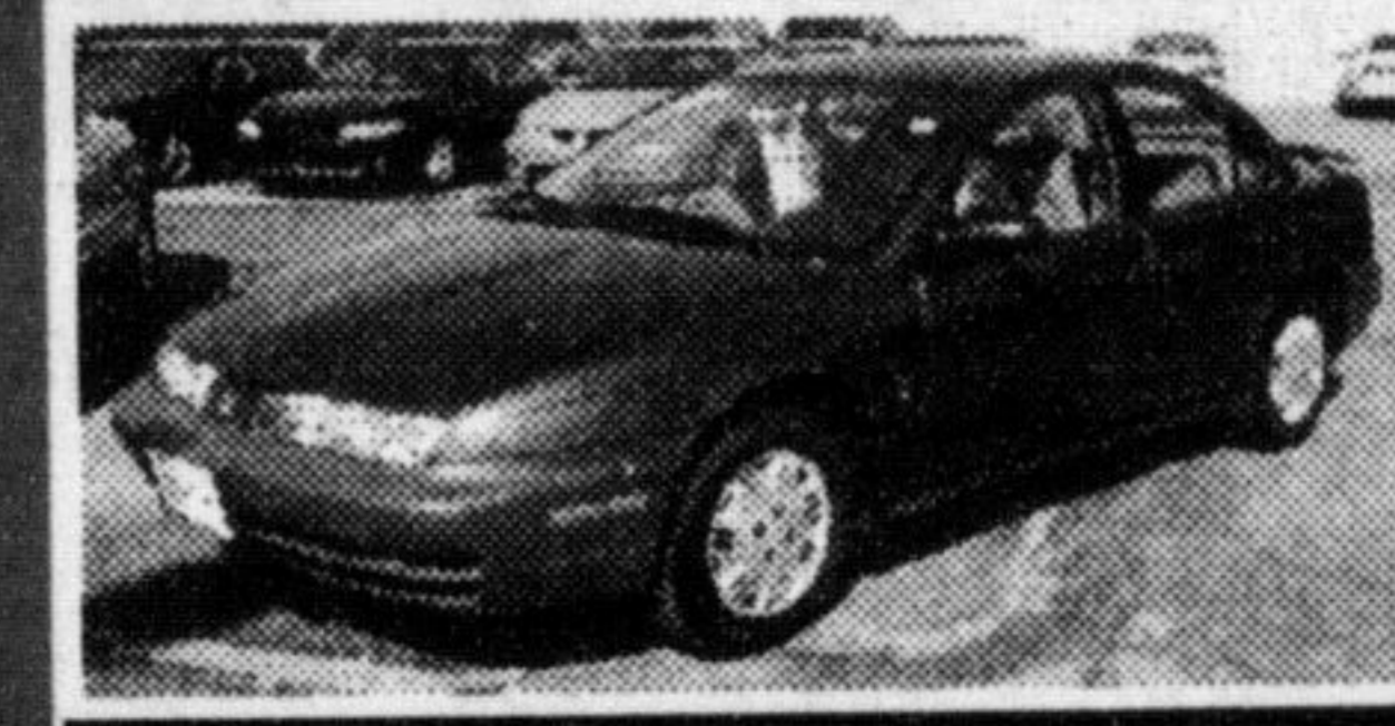
'99 SATURN SLI 4 DR

ONLY $22,895 LEASE $499 00 + Taxes 36 mths