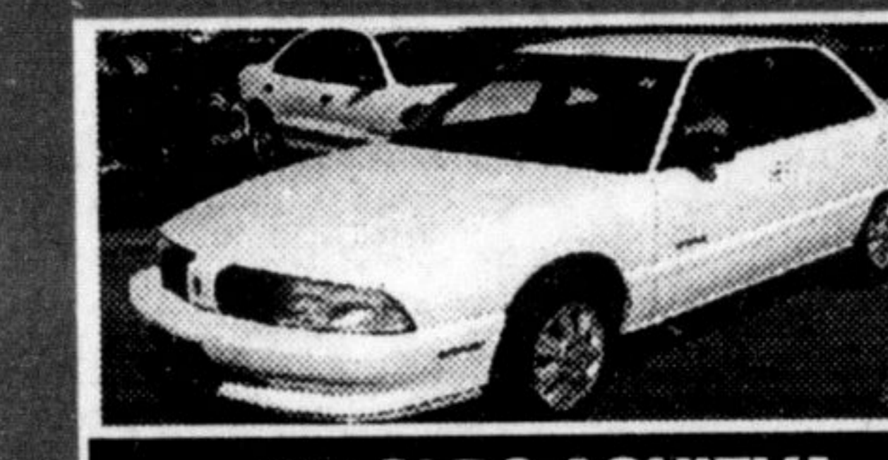
'97 OLDS ACHIEVA

2 owners, white on graphite cloth, fully loaded V6, w/ power pkg, only 41,000 kms.