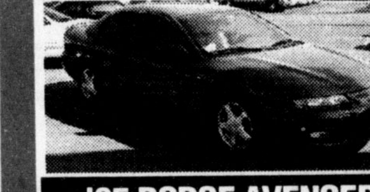
'95 DODGE AVENGER

1 owner, red on grey leather, fully loaded w/ pwr. seat, auto, A/C, 2.5L, alarm system & remote starter.