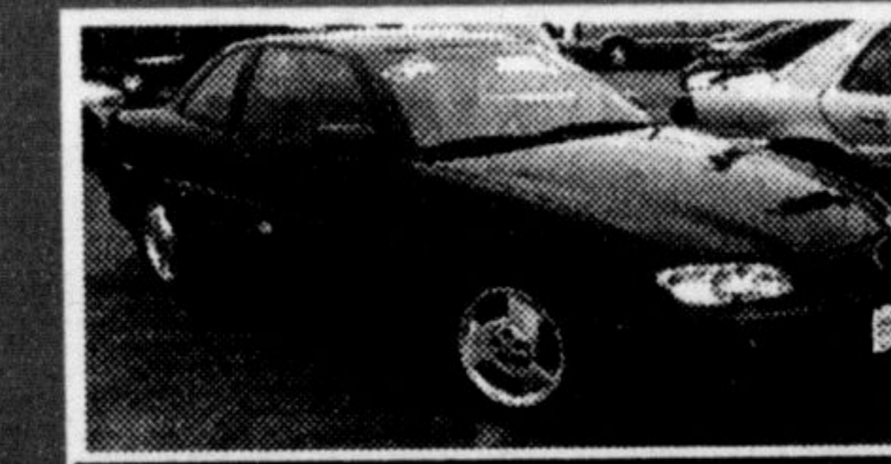
'97 GRAND AM GT

black on black, 3.1 L V6, 1 owner, fully loaded w. pwr. moonroof, well maintained, only 72,000 km.