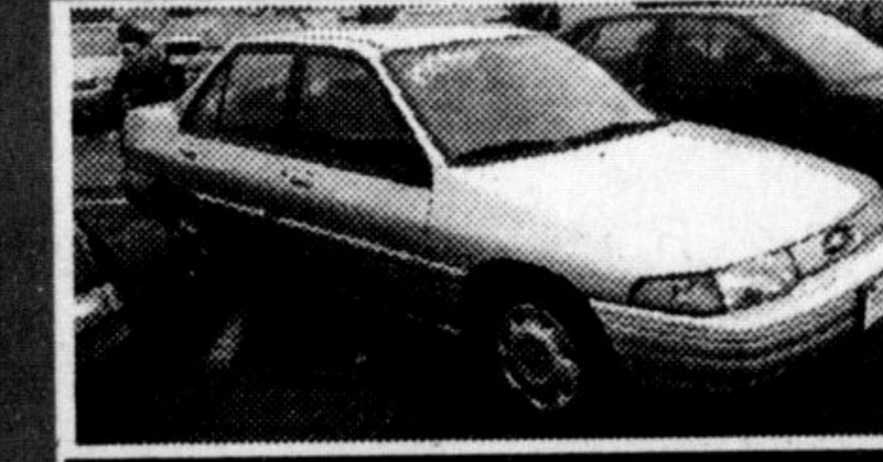
'94 FORD ESCORT

silver on grey in excellent condition, 4 dr w. air and automatic only 112,000 kms