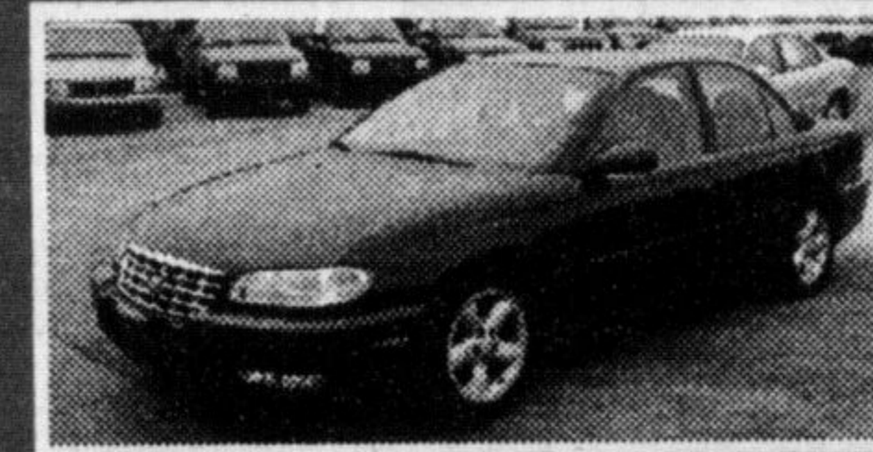
'97 CADILLAC CATERA

36 MONTH LEASE OR FINANCING AVAILABLE. Call Today for details.