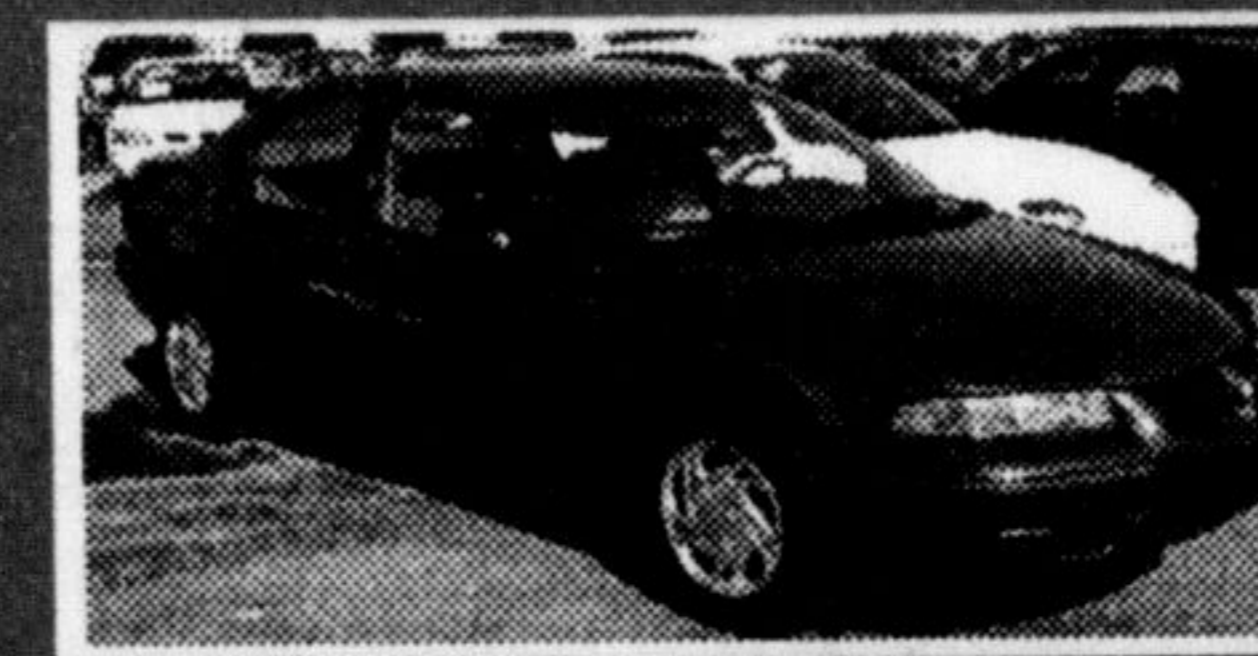
'95 DODGE STRATUS

4 dr., air, 1 owner, only 89,000 km. st# 538377A