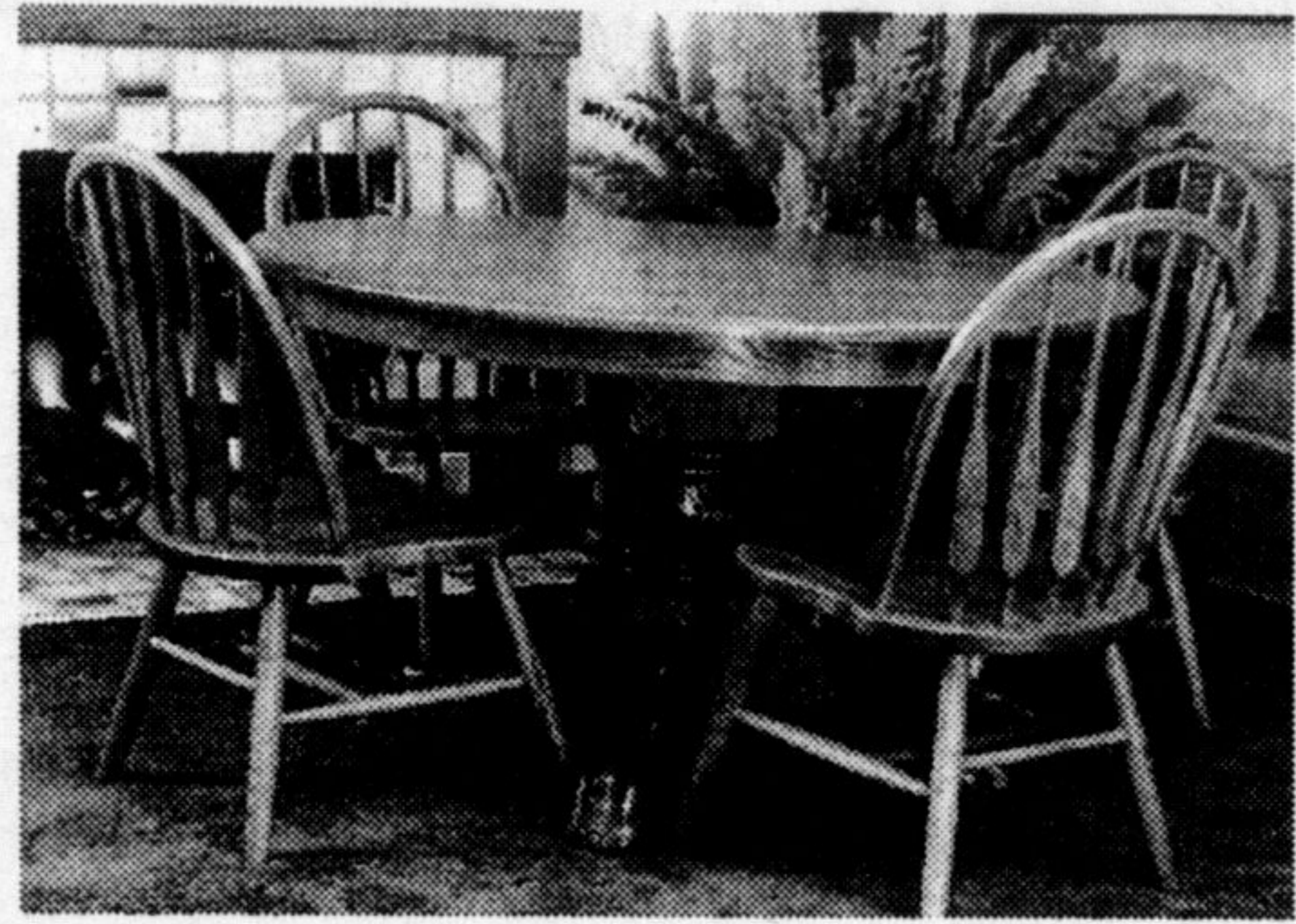
Huge selection of solid oak dining room suites Mission & French Country Mix & Match tables & chairs to create your own setting, many stains to choose from

SOUTHERN ONTARIO IS COMING HOME TO FINE OAK THINGS