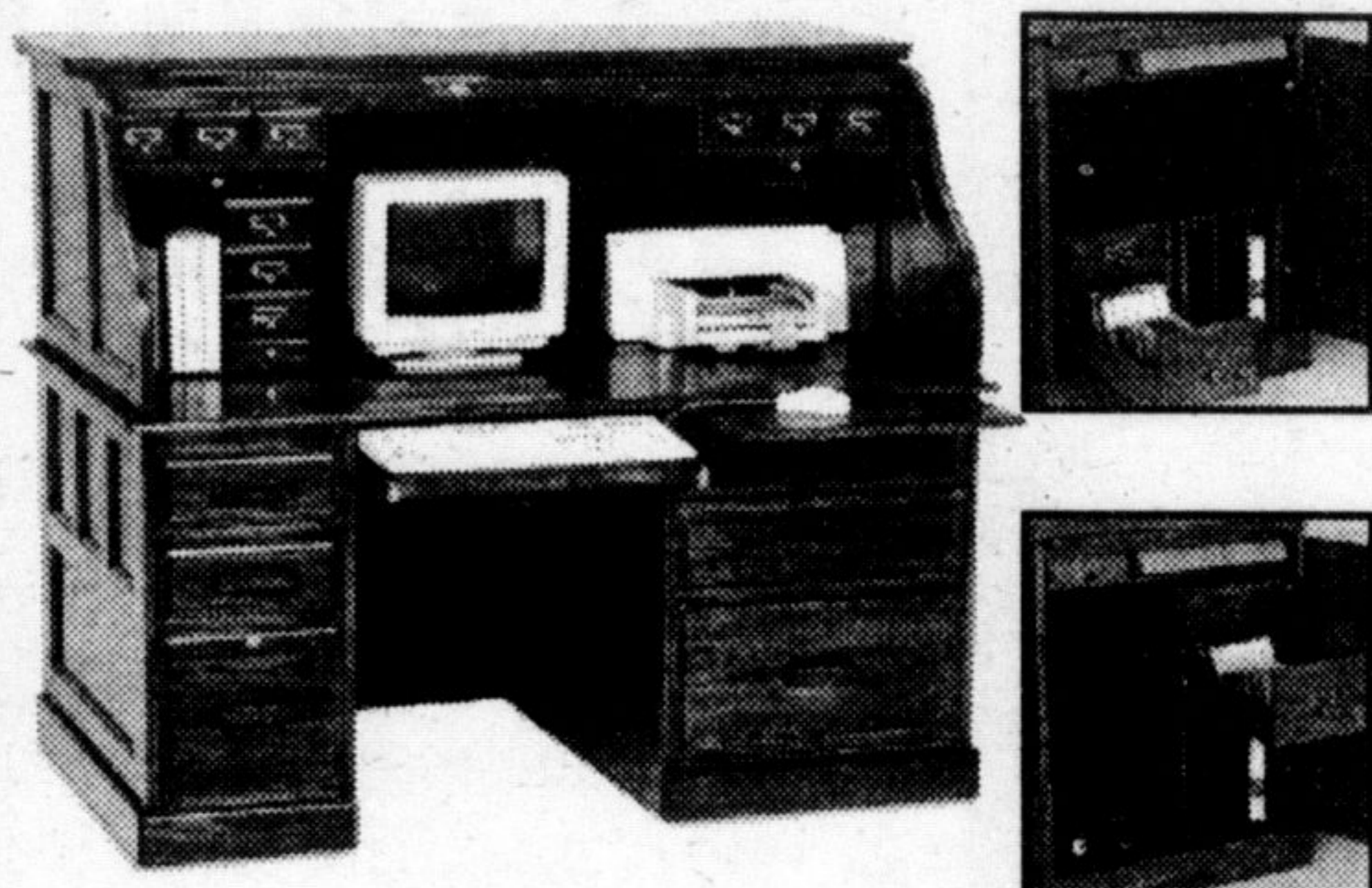
Many roll tops, flat top desks, book cases, file cabinets & office chairs for all your home office needs