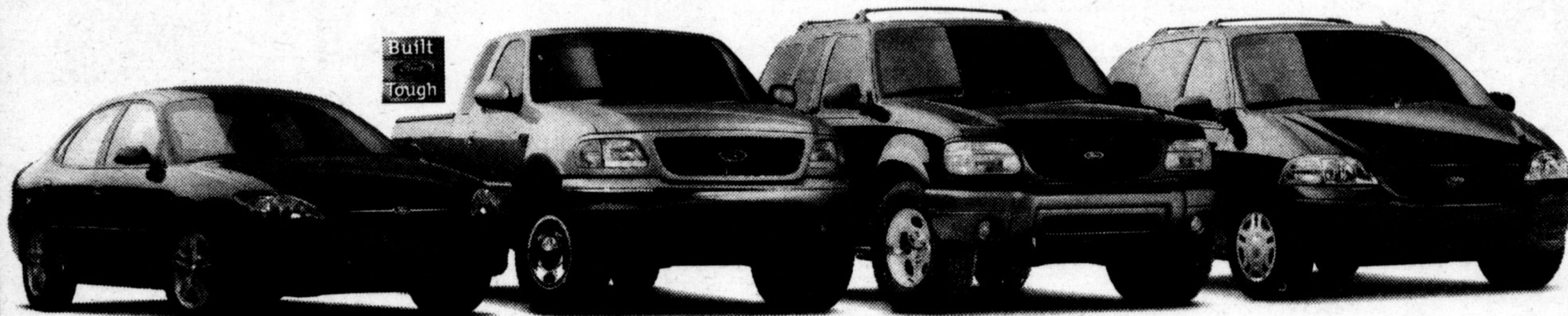
All 2000 Taurus

CHOOSE 0.9% 48 Month Purchase Financing OR $2000 + CASHBACK