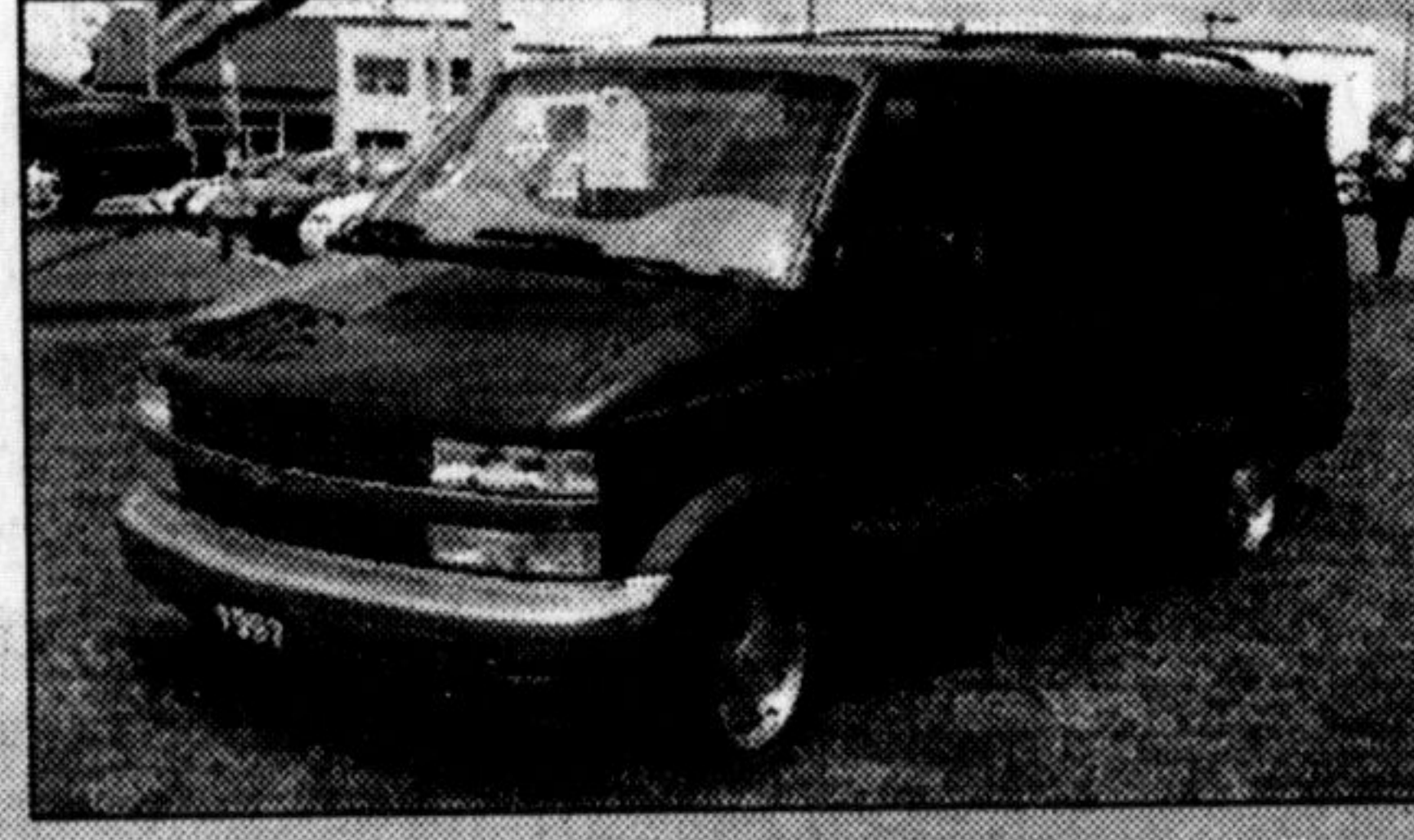
1997 CHEV ASTRO VAN LS Auto, air, Tilt, cruise, P.wind., P.locks, rear heat, app. 66,000 kms. Carmine red and gold tutone.