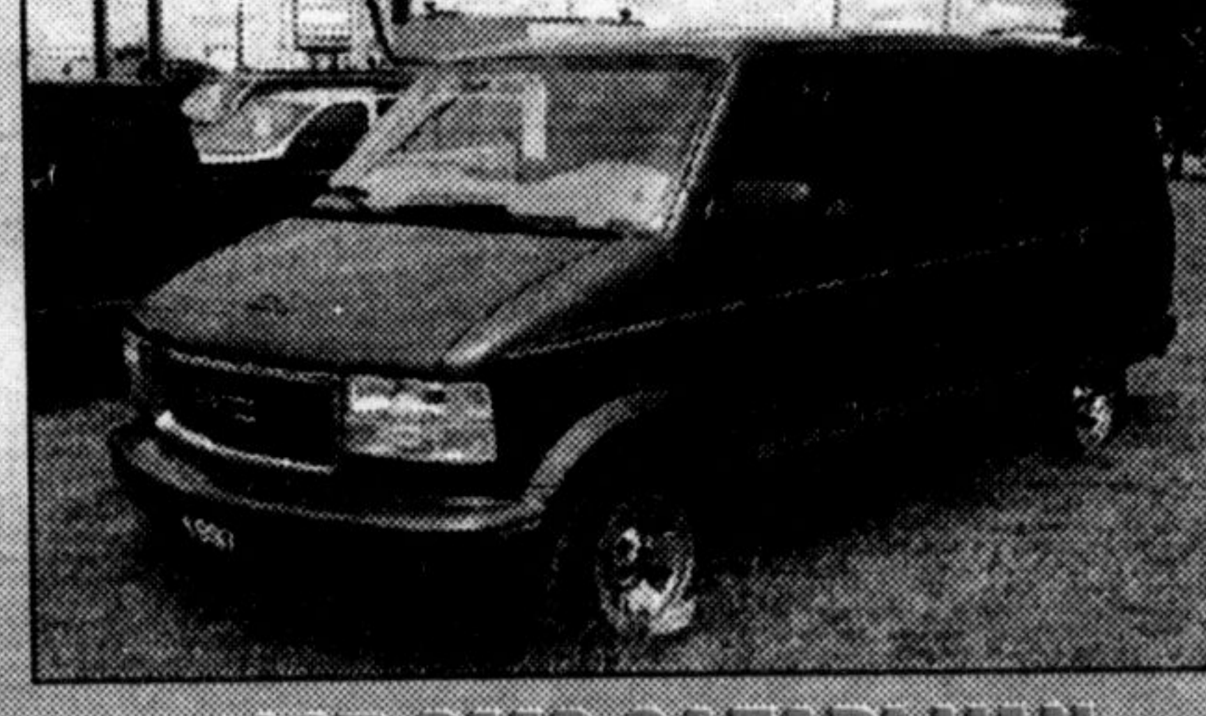
1997 GMC SAFARI VAN 7 pass., auto, air, tilt, cruise, P.wind., P.locks, cass., rear heat, chrome wheels, teal blue, app. 58,000 kms.