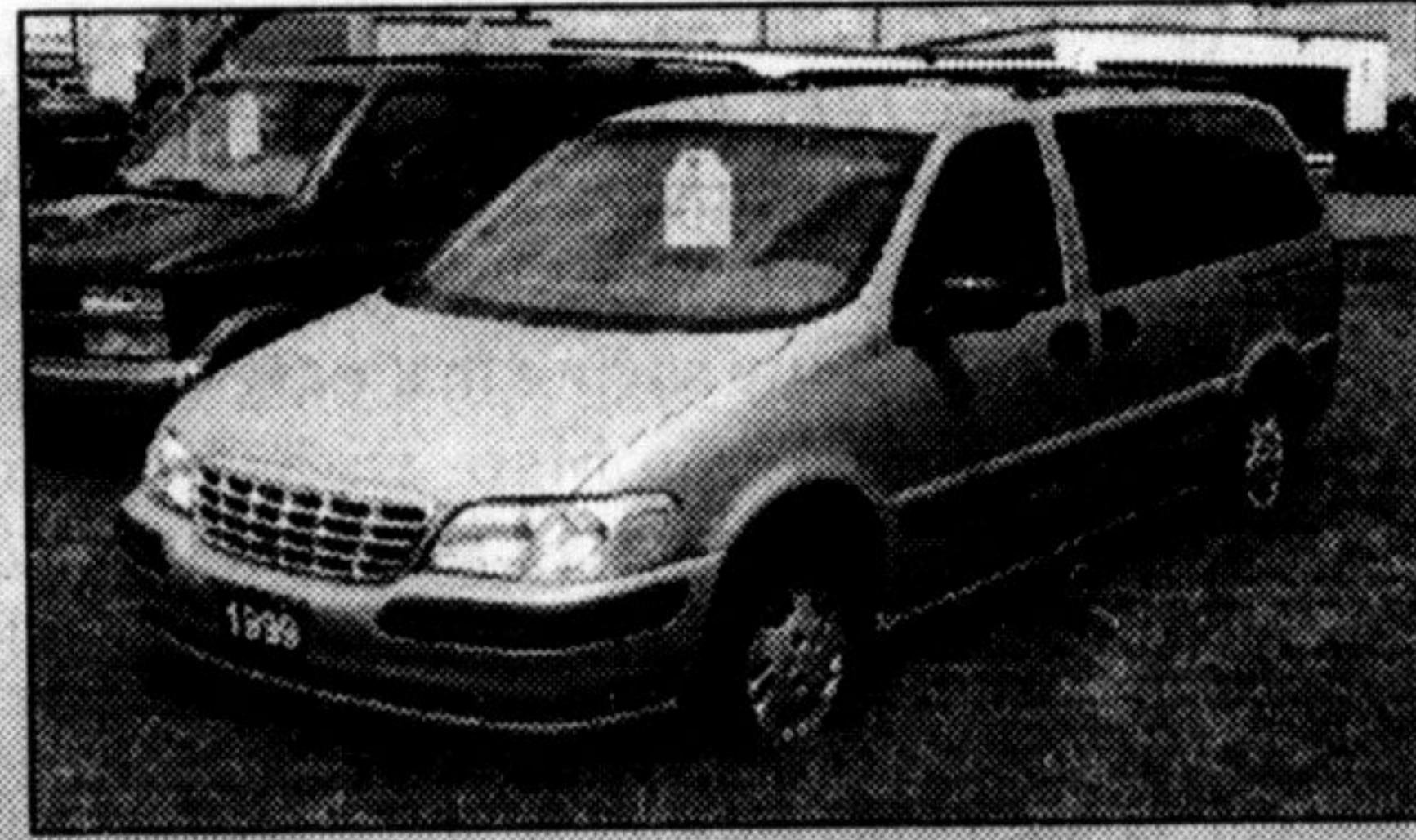
1999 CHEV VENTURE EXT WAGON 7 pass., auto, air, tilt, cruise, P.wind., P.locks, cassette, P.mirrors, radiant silver.