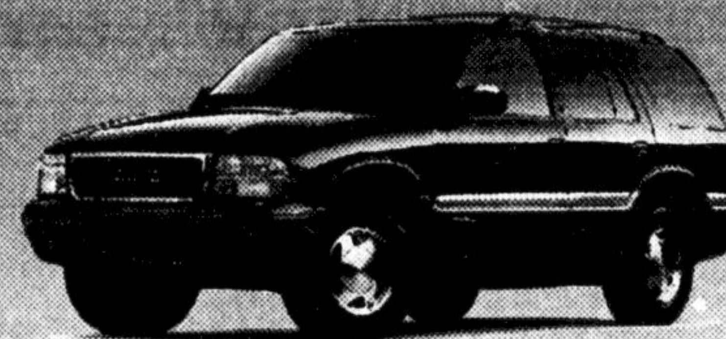
Jimmy 16 Available