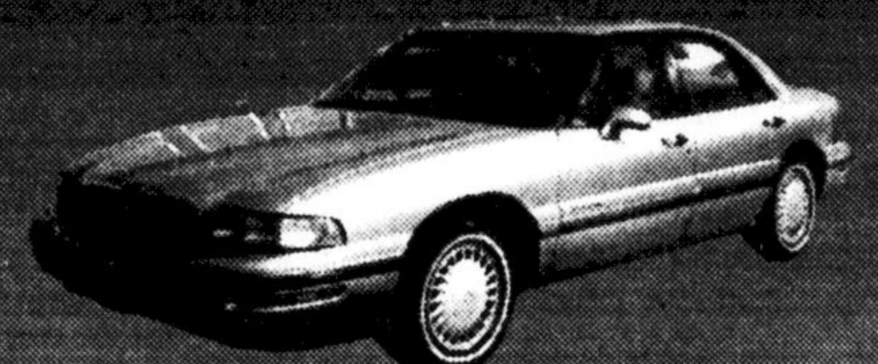
LeSabre 6 Available