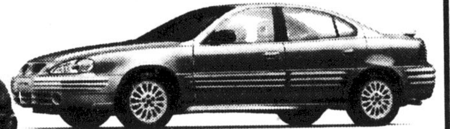
Grand Am 6 Available