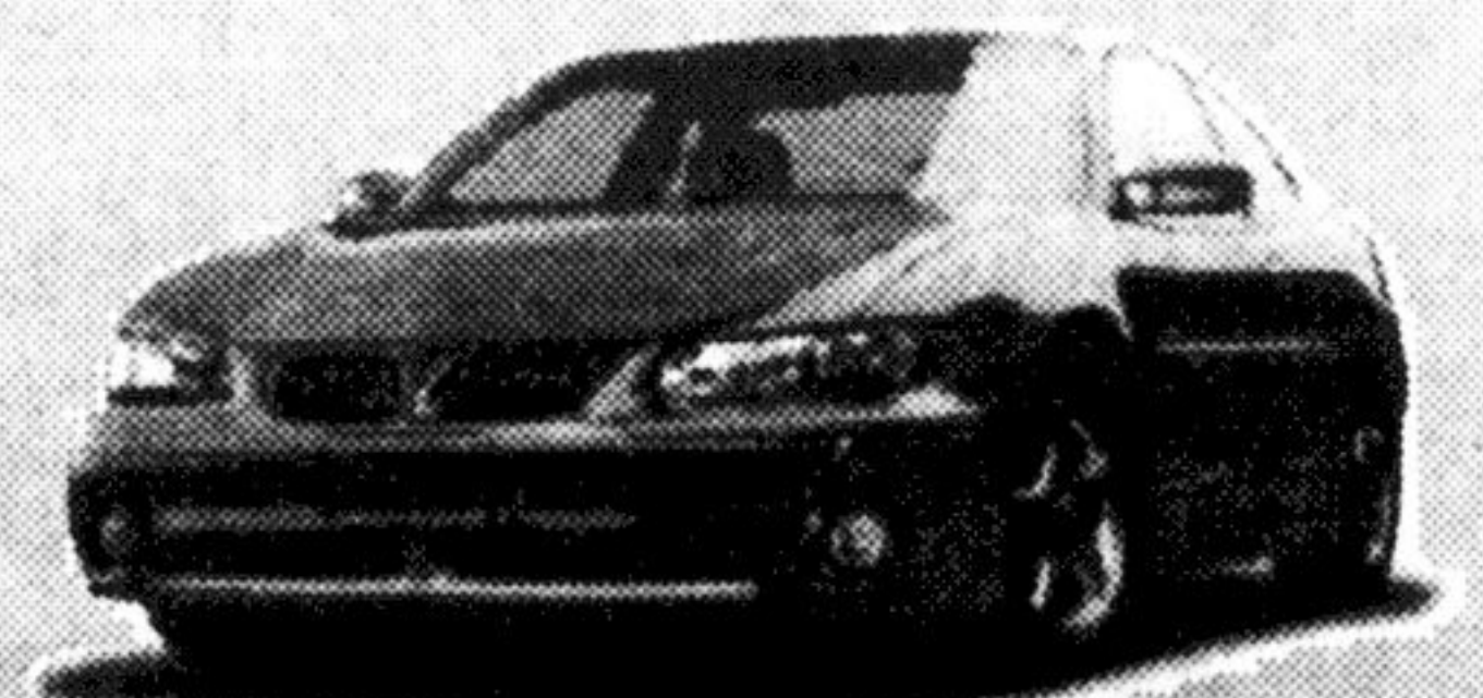
Grand Prix 10 Available