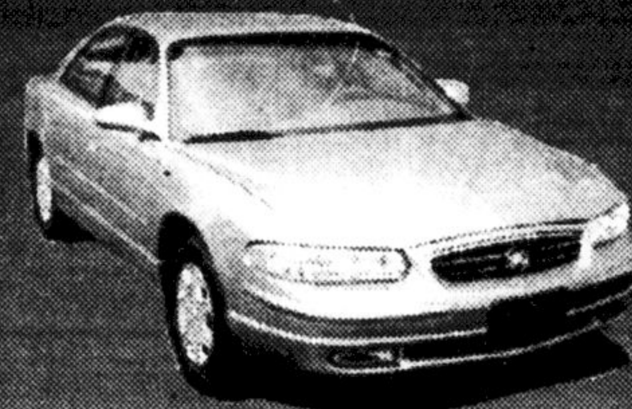
Century 4 Available