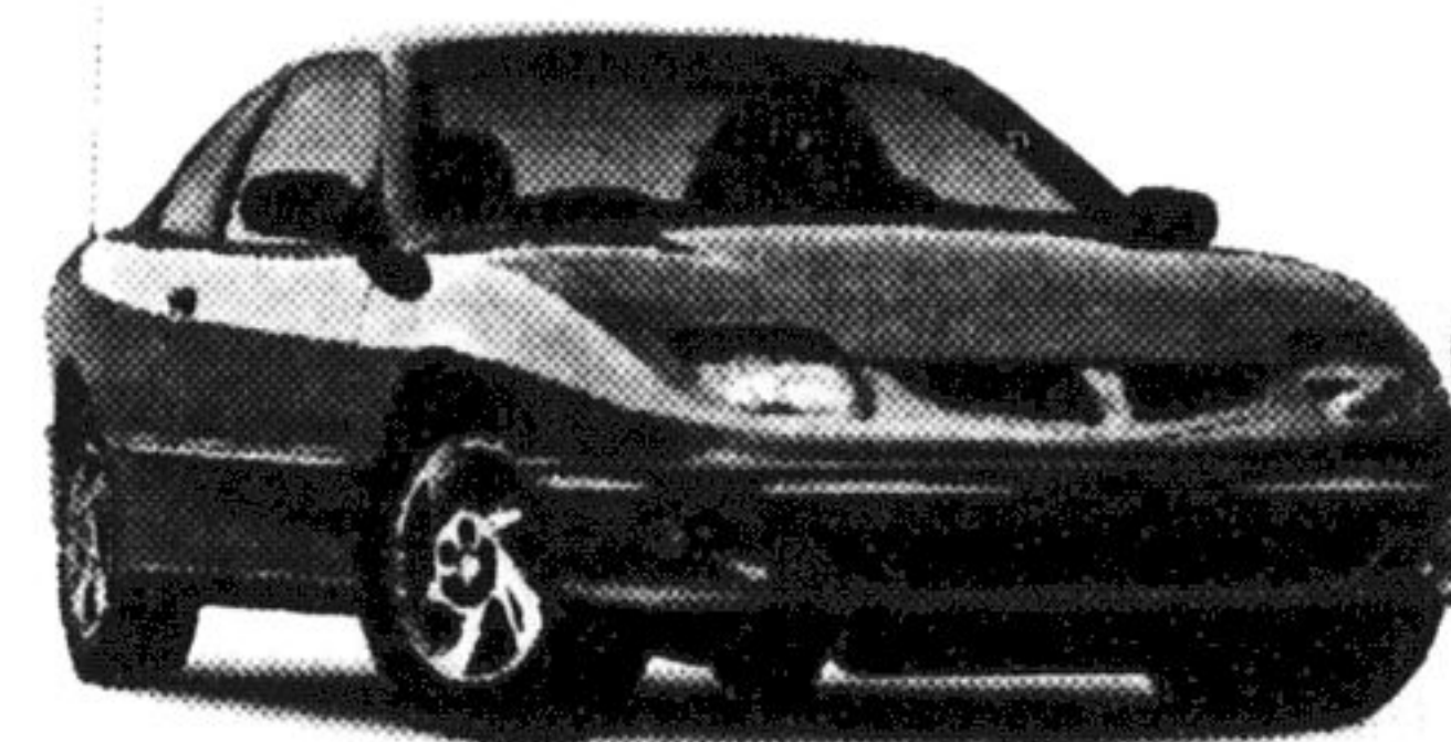
Sunfire 20 Available