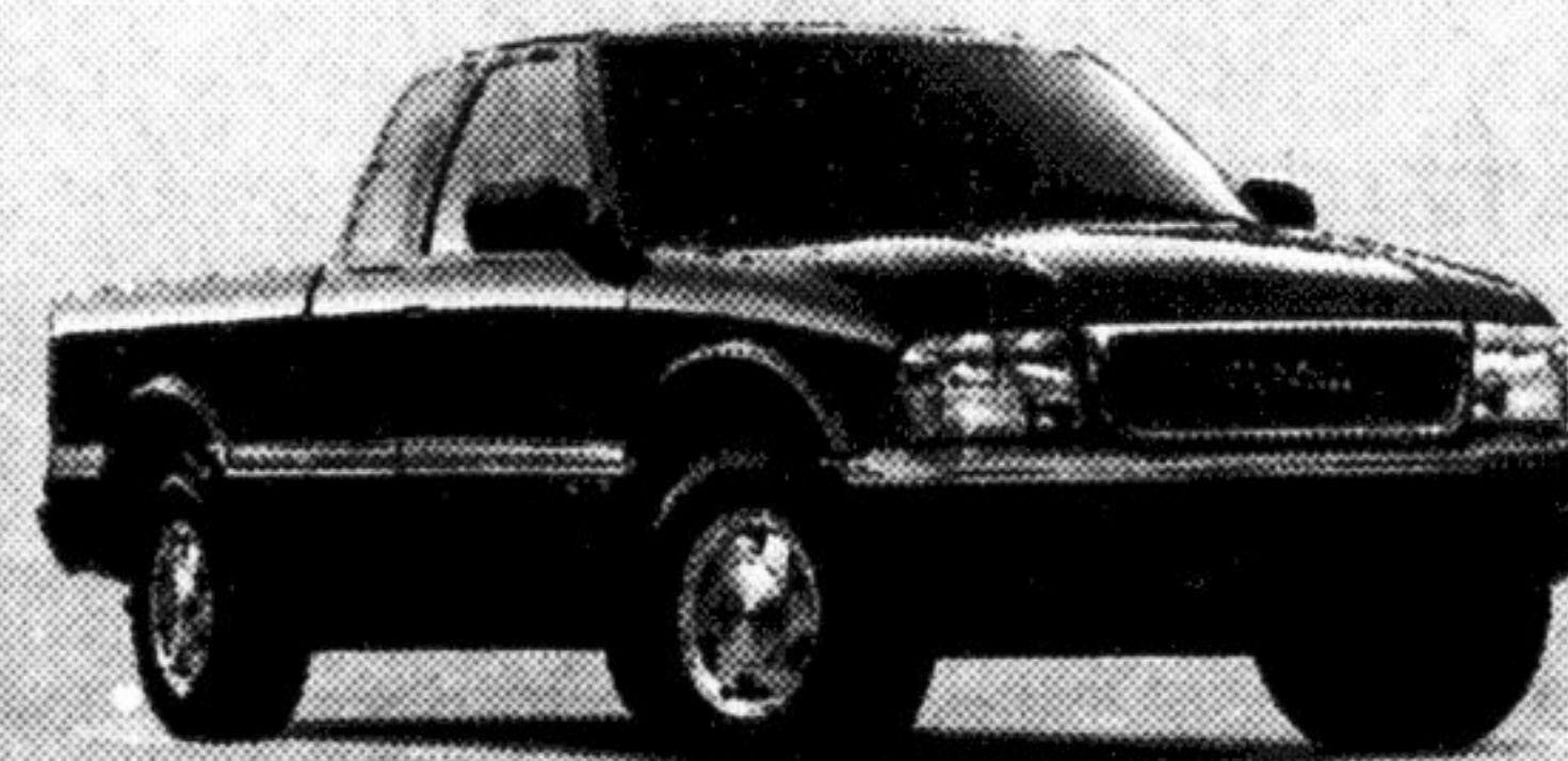
Regular Cab Pickup 8 Available