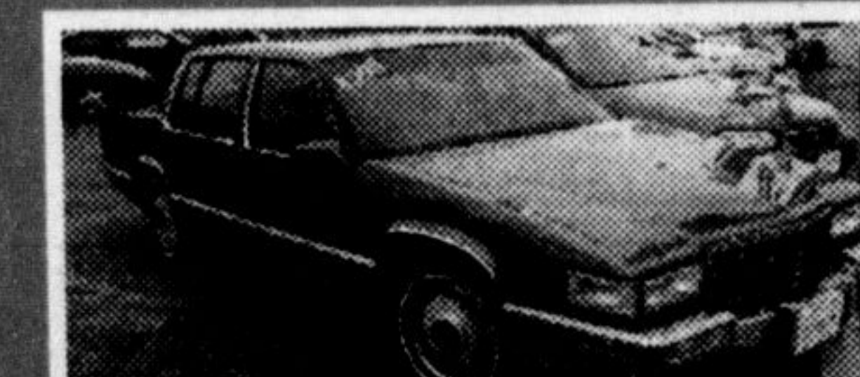
'93 CADILLAC DE VILLE

nice clean luxury car, grey on grey leather, all the Cadillac features, only 113,000 kms