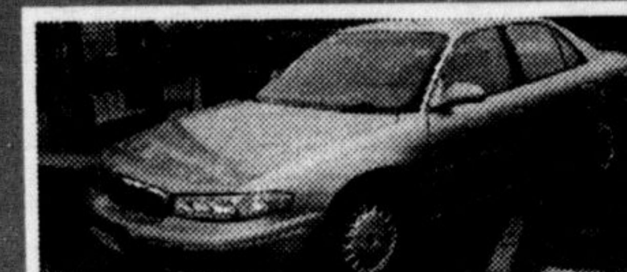
'98 CENTURY LTD.

1 owner, beige on beige, fully loaded, w. power seat, balance of factory warranty, only 17,800 km.