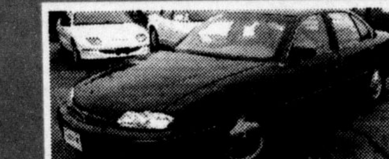
'97 CHEV LUMINA LS

dk. green on grey cloth, 1 owner w. only 36,000 kms, car is like new.