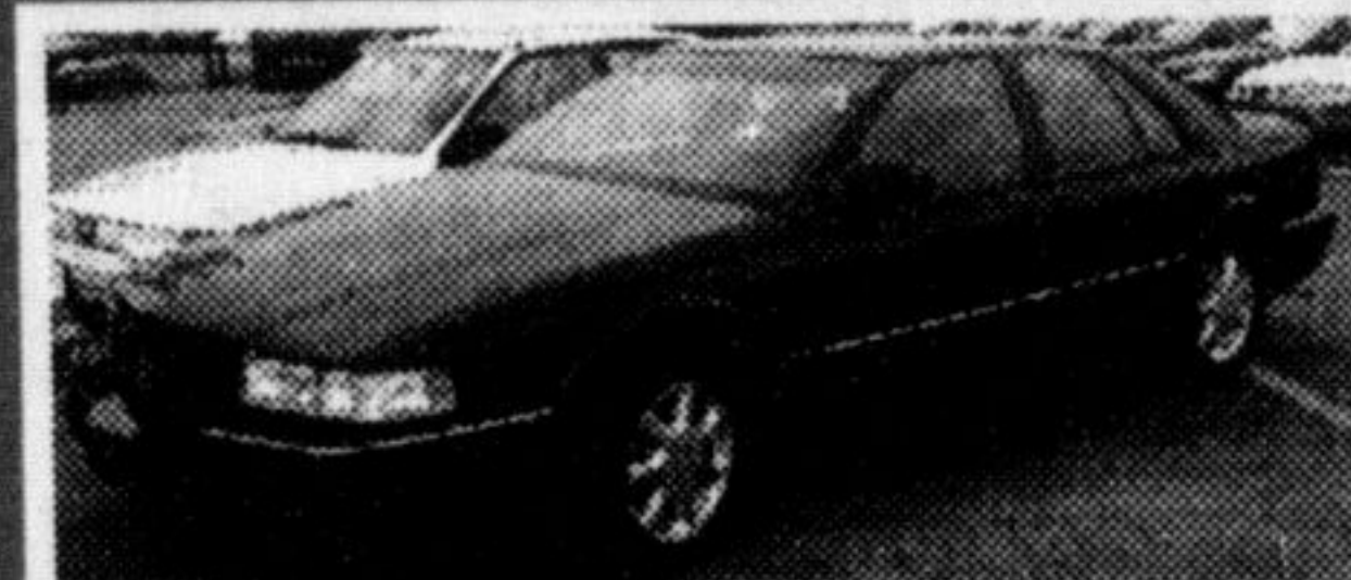
'97 CADILLAC SEVILLE STS

36 MONTH LEASE OR FINANCING AVAILABLE. Call Today for details.