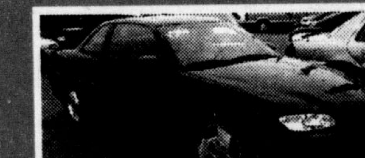
'97 GRAND AM GT

black on black, 3.1 L V6, 1 owner, fully loaded w. pwr. moonroof, well maintained, only 72,000 km.