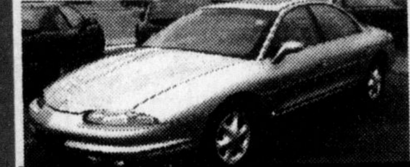
'97 OLDS AURORA

auto, air, tilt, cruise, power moonroof, lux. leather, fully loaded. 2 Available st# P1595