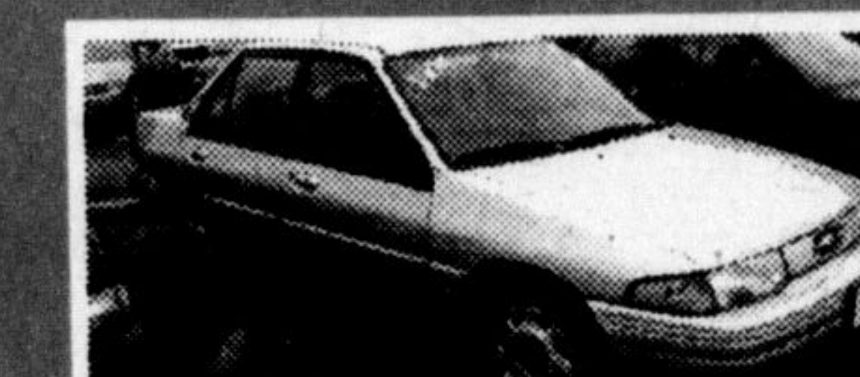
'94 FORD ESCORT

silver on grey in excellent condition, 4 dr w. air and automatic only 112,000 kms