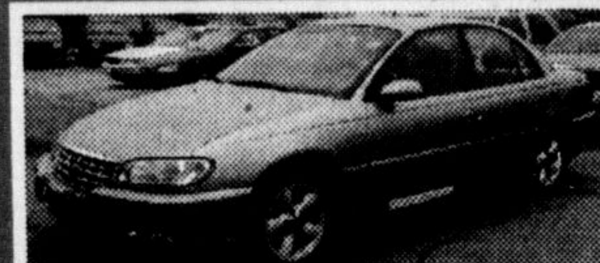
'99 CADILLAC CATERA

GM Exec. Car, beige on neutral leather, all the std. Cadillac features, virtually full 4 yr./80,000 km warranty and maintenance pkg. only 000038 km.