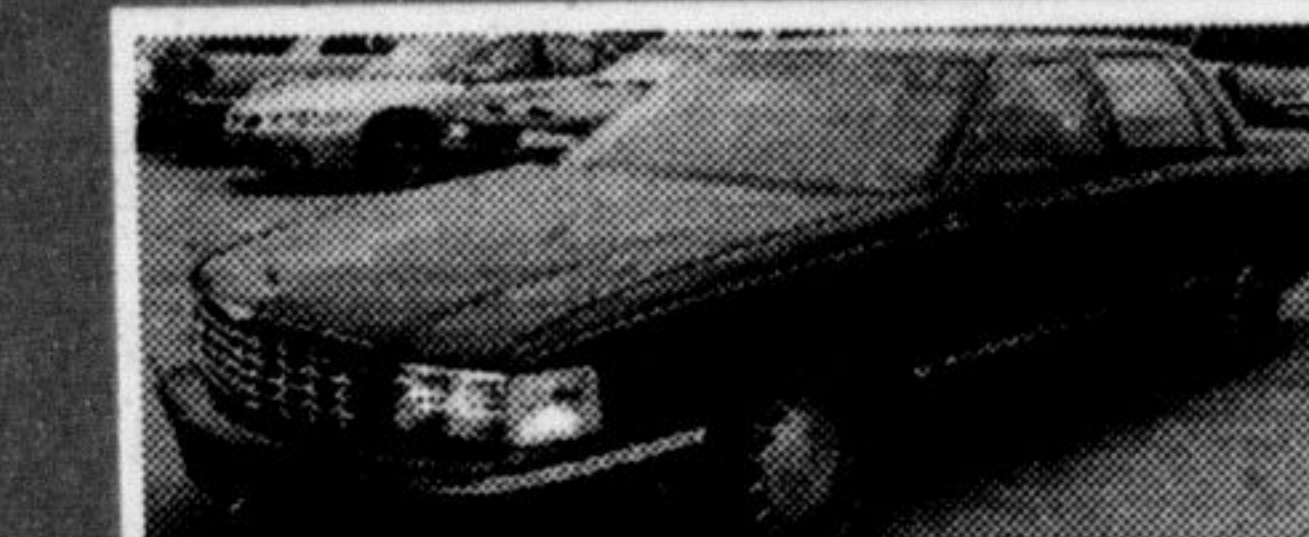
'99 CADILLAC DE VILLE

GM Daily Rental, dk. green, grey leather, fully loaded, balance of GM 4 yr./80,000 km warranty, only 30,870 kms