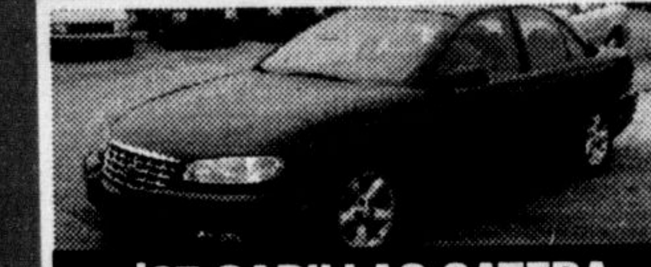
'97 CADILLAC CATERA

Black on black leather, fully loaded w. moonroof, bal. of GM Warranty to 80,000 kms and Cadillac maintenance, only 67,800 kms