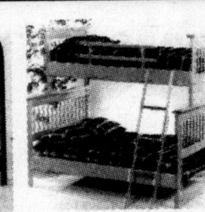
Milan Twin/Double BUNK