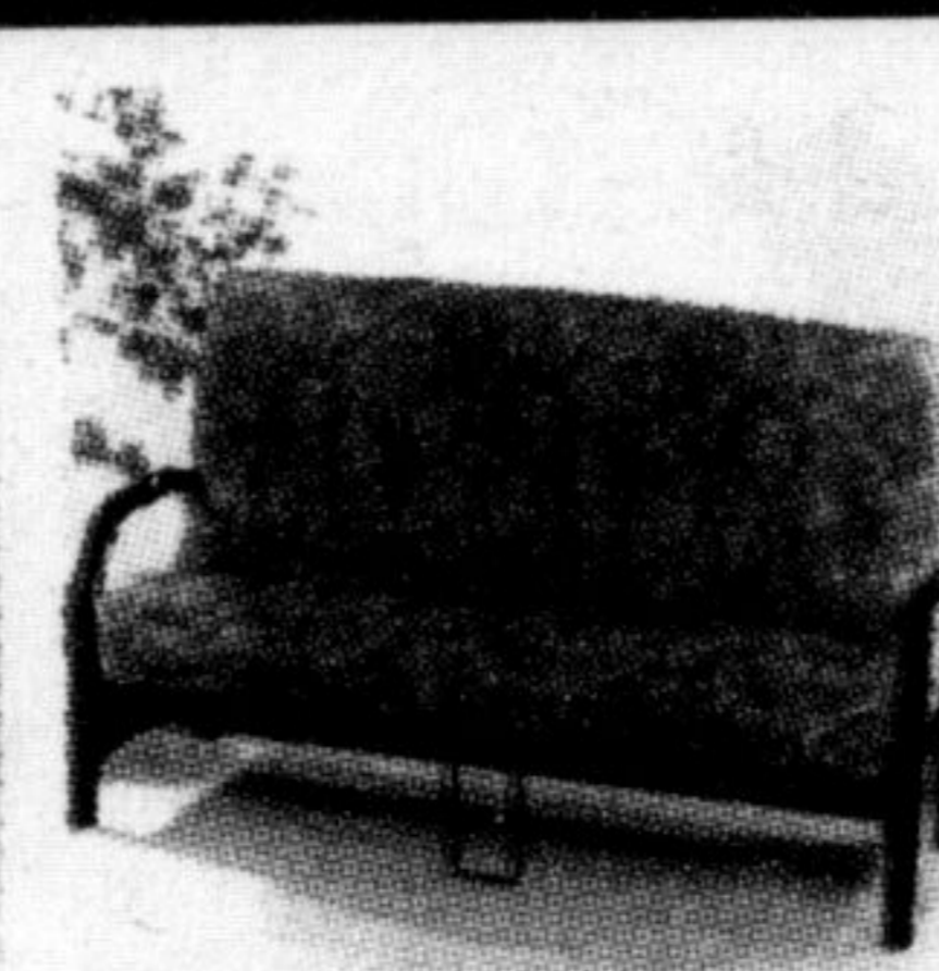
Iron Futon SOFA