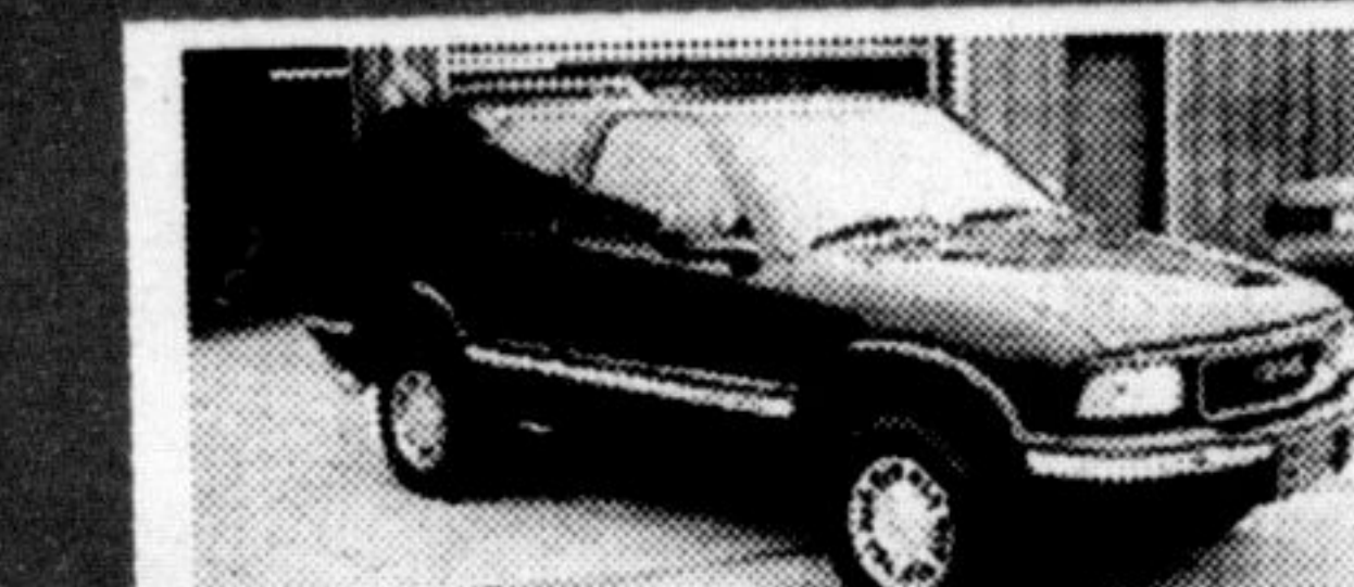
'97 GMC JIMMY SLE

4dr, 4x4, SLE pkg, pw, pl, tilt, cruise, am/fm st cass, only 72,000kms.