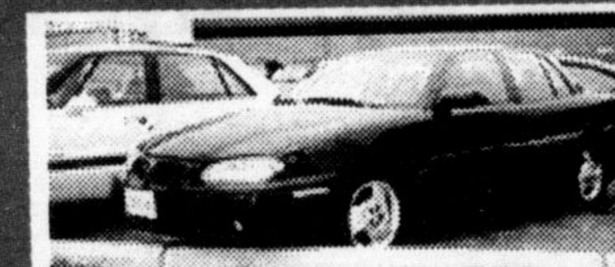
'97 GRAND AM GT

Black on black leather, 3.4L V6, full pwr pkg, 16" alloy rims, spoiler, CD, 83,500kms.