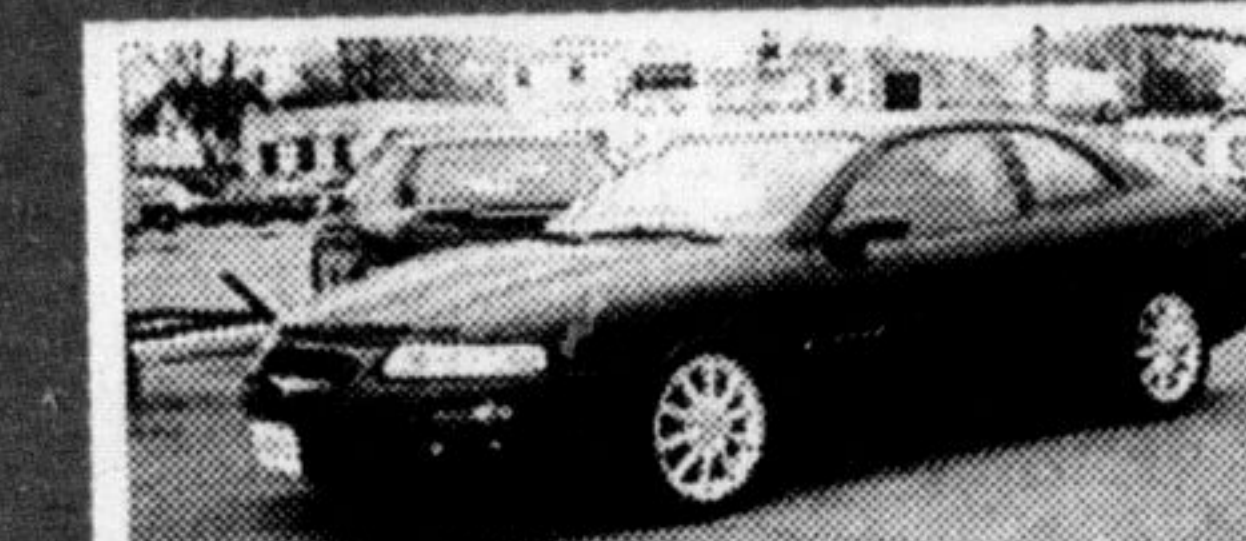
'97 CHRYSLER SEBRING LXi

Black on black leather, all pwr options incl moonroof, pwr seat, and CD, ABS brakes and ally rims, 90,500kms.