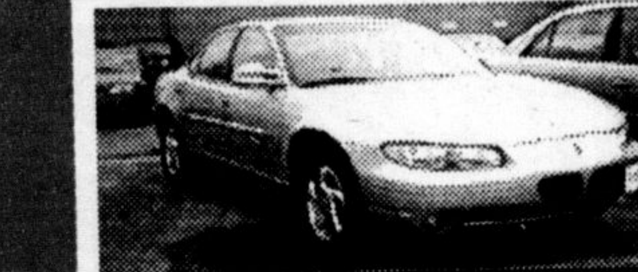
'99 PONTIAC GRAND PRIX SE

4dr, V6, auto with Overdrive, pw, pl, tilt, cruise.