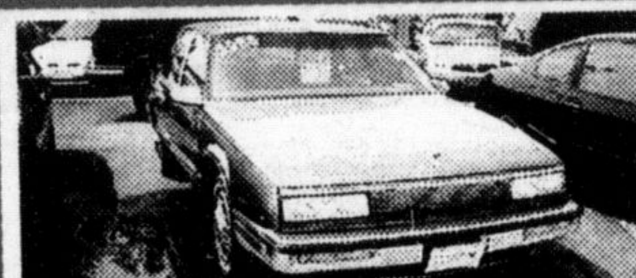
'88 BUICK LESABRE LTD.

6 MONTH POWERTRAIN WARRANTY WITH ALL OPTIMUM USED VEHICLES