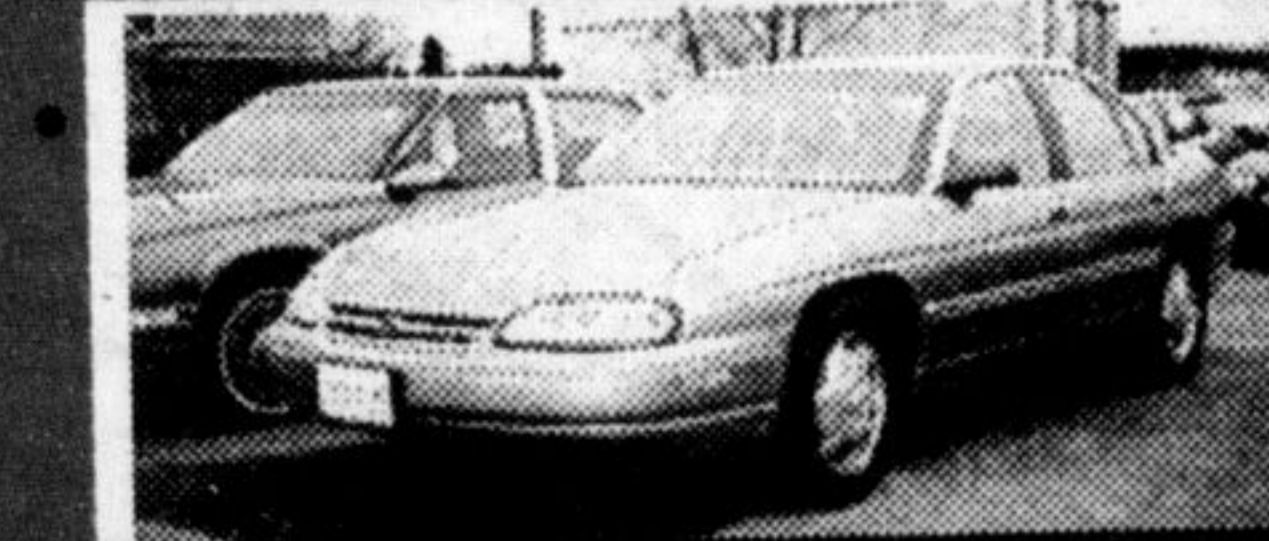
'97 LUMINA LS

Silver on grey cloth, 3.1L V6, full pwr options w/ pwr seta, dual zone A/C, and CD, alloy rims, only 50,000kms.