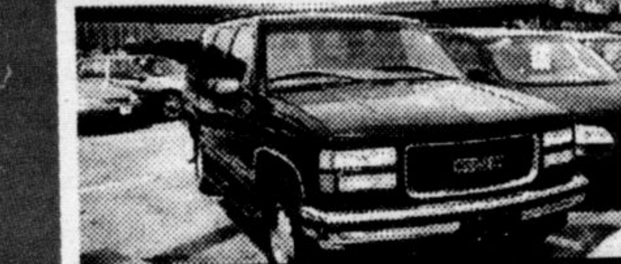
'97 GMC YUKON

4 dr, SLT, 2 to choose from, 1-black, 1 green, pw/pl, tilt, cruise, power seats, cassette & CD. 1 owner. P1548 & P1552A