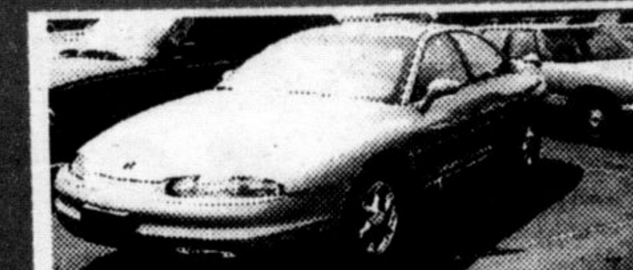
'97 OLDS AURORA

4 dr, auto, air, pw/pl, tilt, cruise, leather int., power roof, fully loaded, champagne colour. P1560A