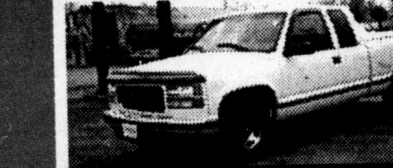
'98 EXT CAB SIERRA 2WD

SLE, auto, air, loaded, tonneau cover, pw, pl, tilt, cruise, only 45,000kms.