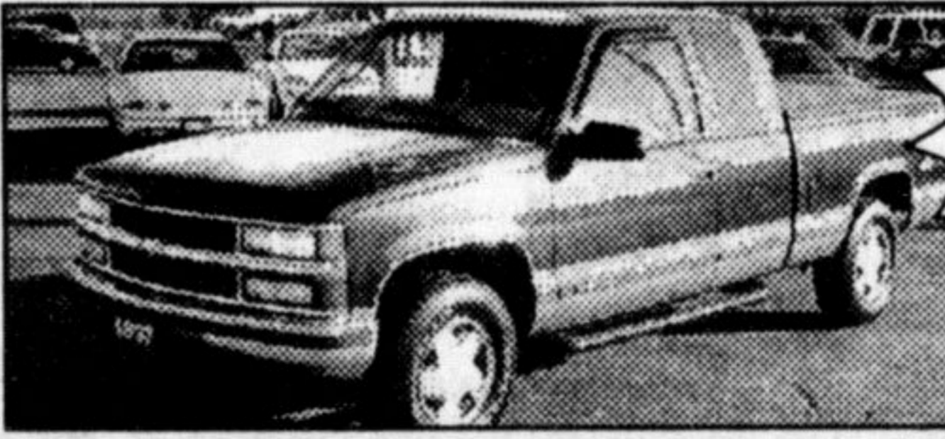
'97 CHEV SILVERADO 3DR, EX. CAB 4X4

5.7 eng., auto O/D, air cond., p. windows, p. locks, tilt, cruise, AM/FM cassette, CD player, bucket seats, console, Z-71 package, alum. wheels, two-tone, trailer pkg., nerf bars, tonneau cover, remote starter, exceptional condition. Approx. 79,500 kms. Stk. #P1845.