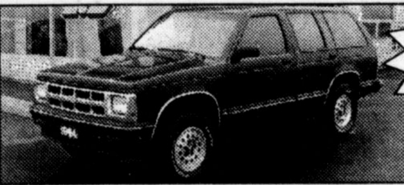
'94 BLAZER LT 4X4 4DR

Finished in burgundy with complimentary grey interior. Equipped with 4.3 litre engine, auto trans., w/O.D., power windows, locks, tilt, cruise, bucket seats, centre console, roof rack, aluminum wheels & much more. Only 110,000 kms. Stk. #P1829.