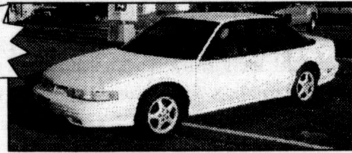
'97 CUTLASS SUPREME 4DR

V6, auto O/D, air cond., P. windows, P. Locks, tilt, cruise, AM/FM cassette, bucket seats, centre console, aluminum wheels & more. Low, low mileage. Approx. 41,300 kms. Stk. #P1710.