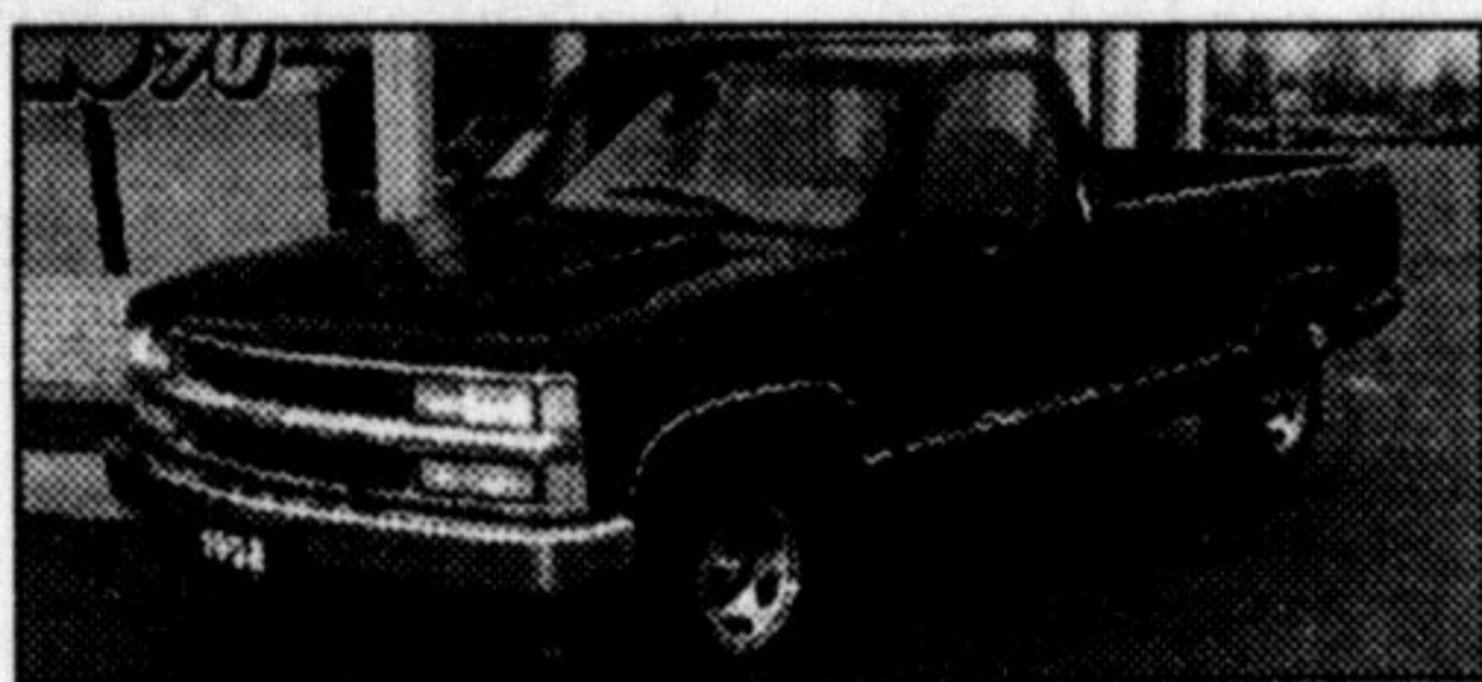
'98 CHEV 1500 WT PICK UP

V8, auto, air, cassette. Alum. wheels, box liner, under 17,000 kms. Gleaming Black Finish. Stk. #P1863.