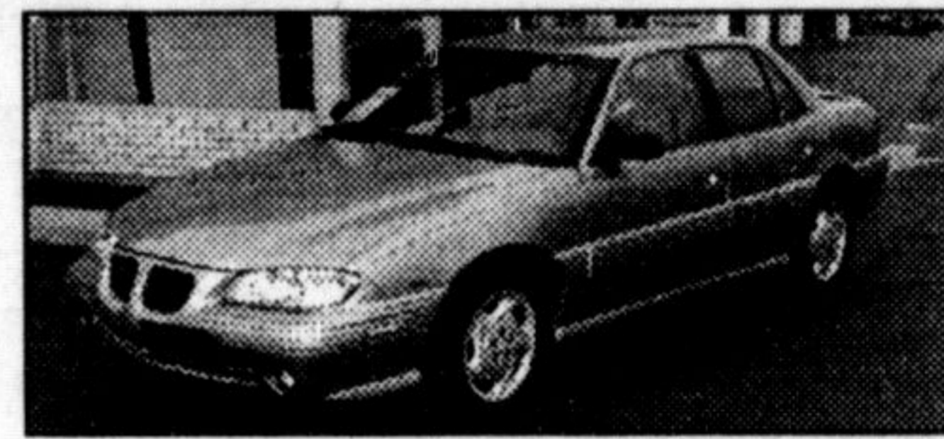
'97 PONTIAC GRAND AM

3.1 V6, auto, air, cassette, P. Window, P. Locks, P. Mirrors, Harvest Gold. Approx. 45,000 kms. Stk. #P1860.