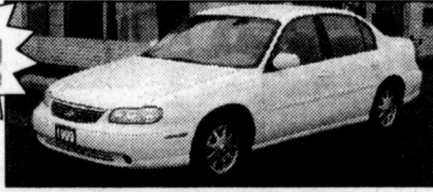
'99 MALIBU 4DR

Finished in Arctic white with grey interior. Equipped with bucket seats & centre console, 3.1 litre V6, auto trans. w/O.D., power windows, locks, tilt, cruise, AM/FM stereo w/cassette. Balance of new vehicle warranty. Only 25,000 kms. Stk. #P1854.