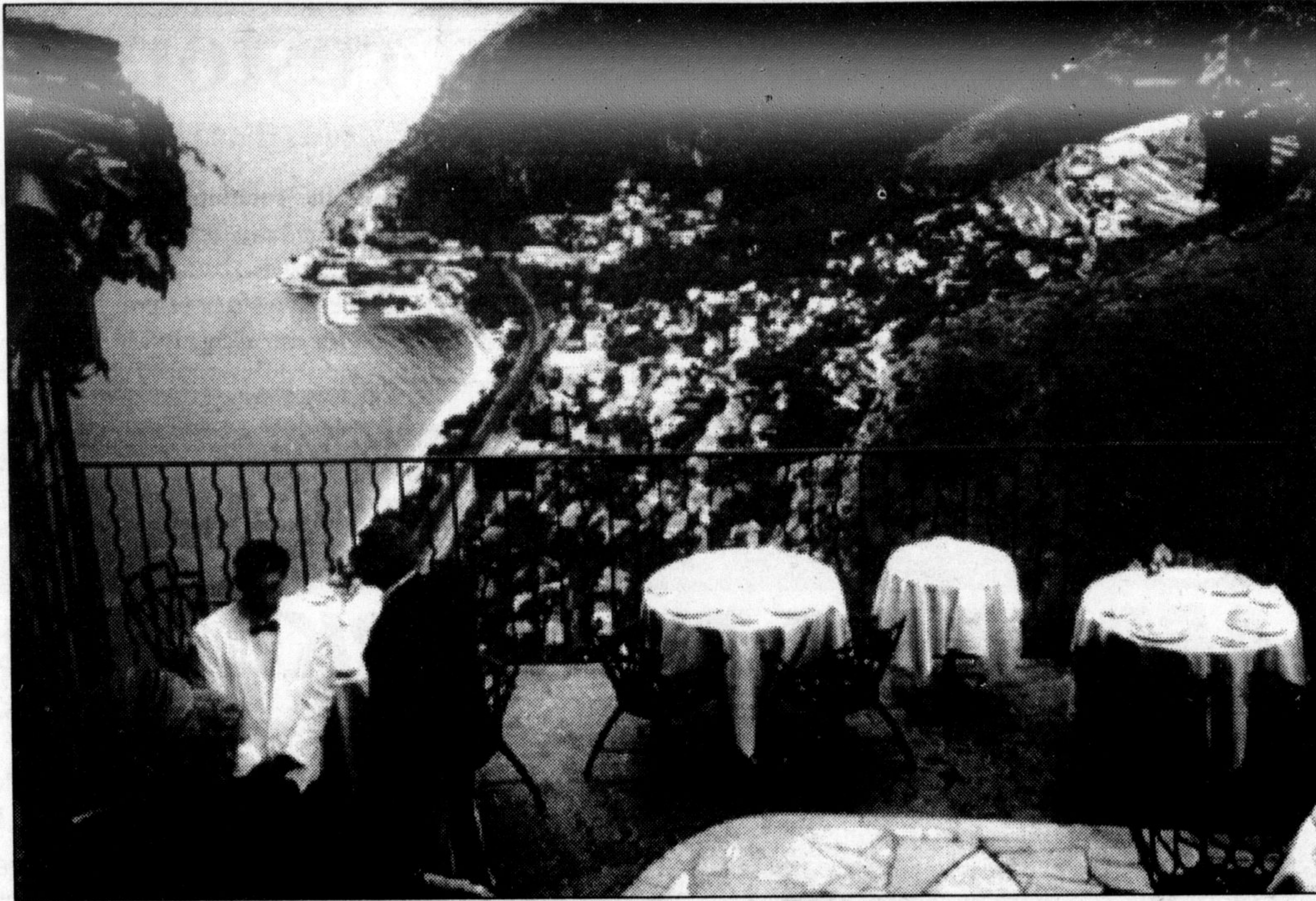
A view of the French Riviera.

(NC)-How about the possibility of covering 771 fabulous French kilometers in 4 hours and 20 minutes? That would happen on the Train Grande Vitesse, the TGV, from Paris to Marseilles on the French Riviera. Or you could do 934 kilometers, Paris to Nice, in just under seven hours.