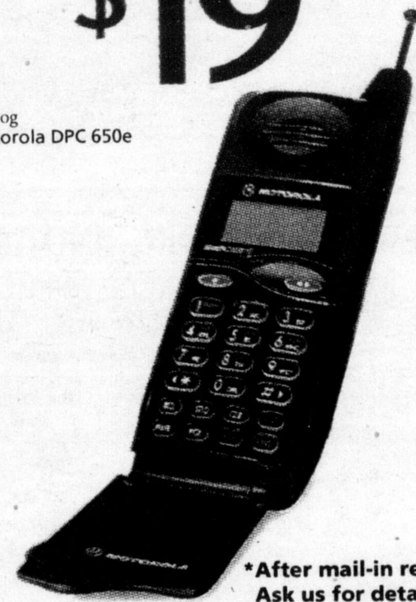
Analog Motorola DPC 650e

*After mail-in rebate. Ask us for details