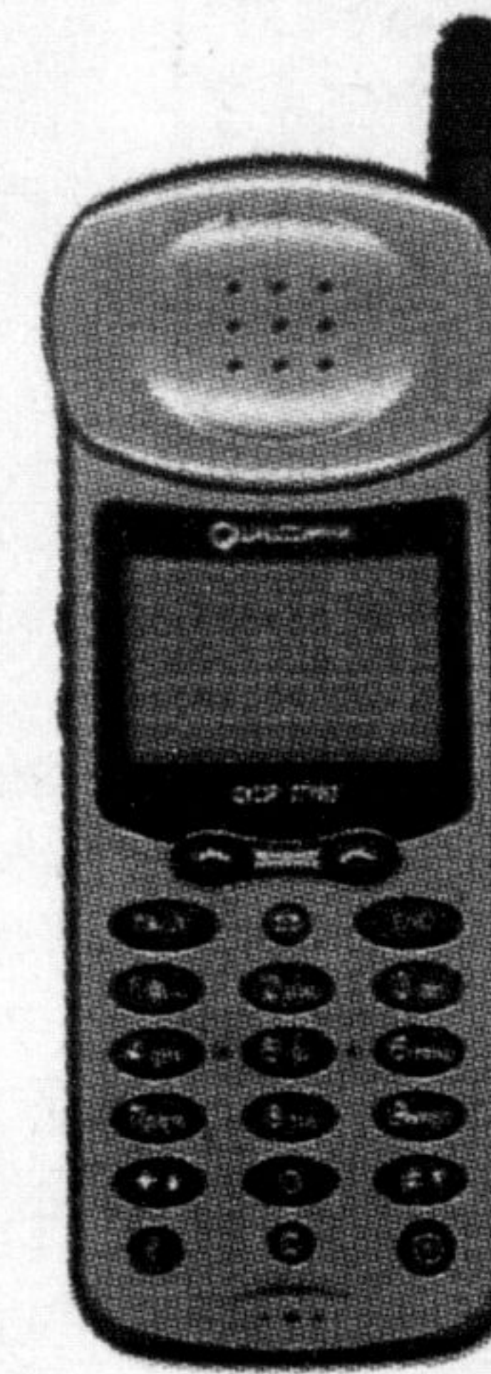
Digital PCS QUALCOMM QCP 2760