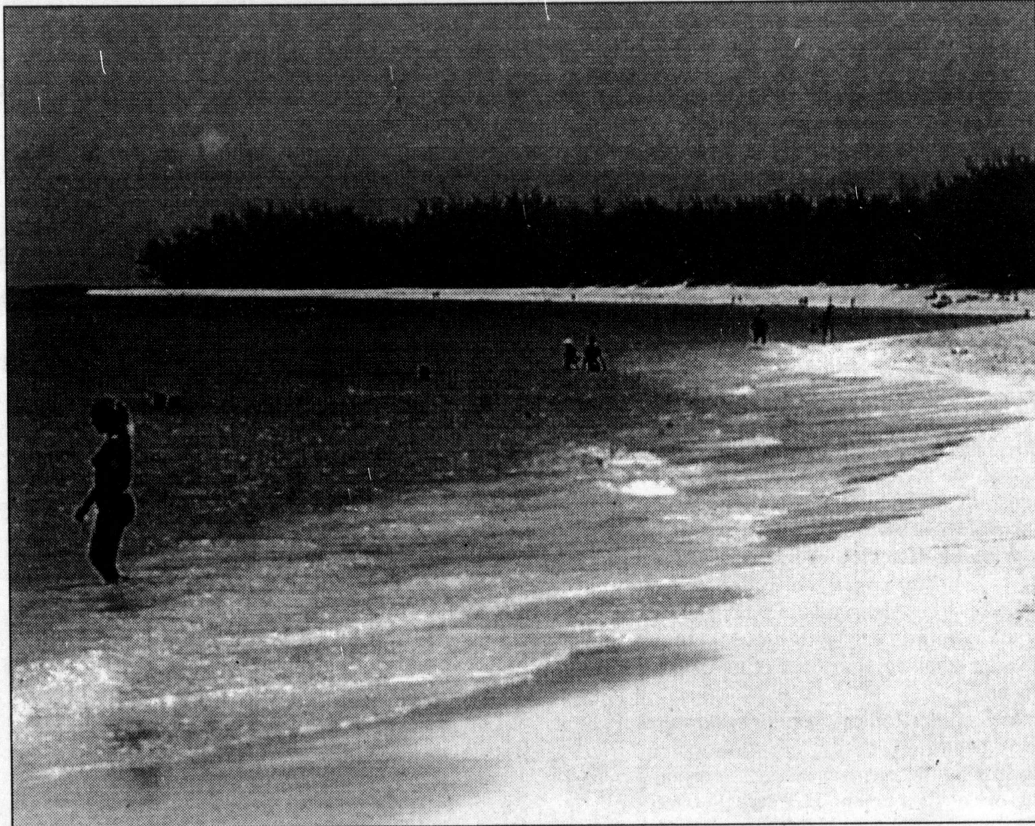
Vacationers enjoy the beautiful surf and sand on one of the many sunny beaches in Nassau.

For the traveller or looking for a unique adventure, just a twenty minute scenic boat ride from Paradise island takes you to Blue Lagoon Island. Famous for its beautiful beaches, great snorkeling and nature trails. While on the island visitors can take part in the Close Encounter experience. You sit in shallow water while dolphins play around you. For the more adventurous, the Swim with Dolphins program lets you spend 30 unforgettable minutes swimming in the water with