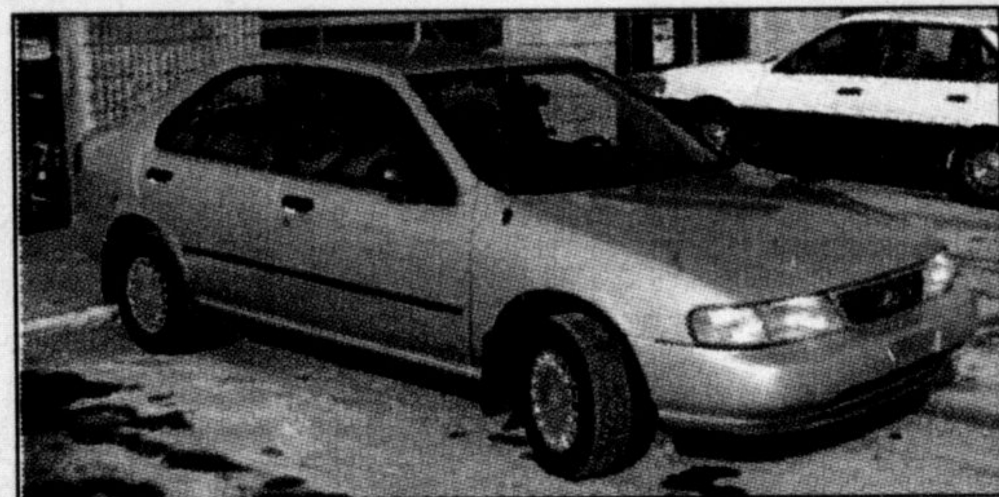
1996 Nissan Sentra XE, Standard, A/C, 47,000 Kms, Balance of Nissan Warranty.

AUTOPRO West End Auto Service 5 Main St. E. 878-5323