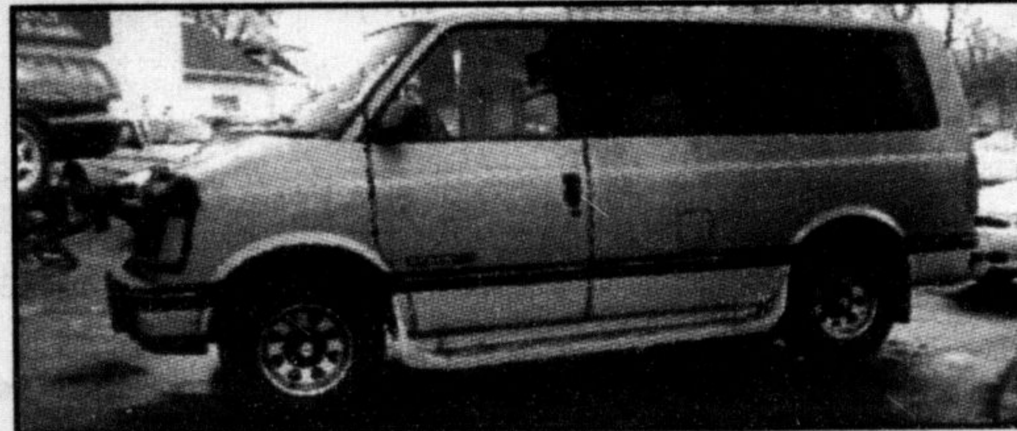
1994 GMC Safari XLT Loaded, 100,000 Kms, Finished in aqua blue & silver 1 Year warranty $ 11,900

AUTOPRO West End Auto Service 5 Main St. E. 878-5323