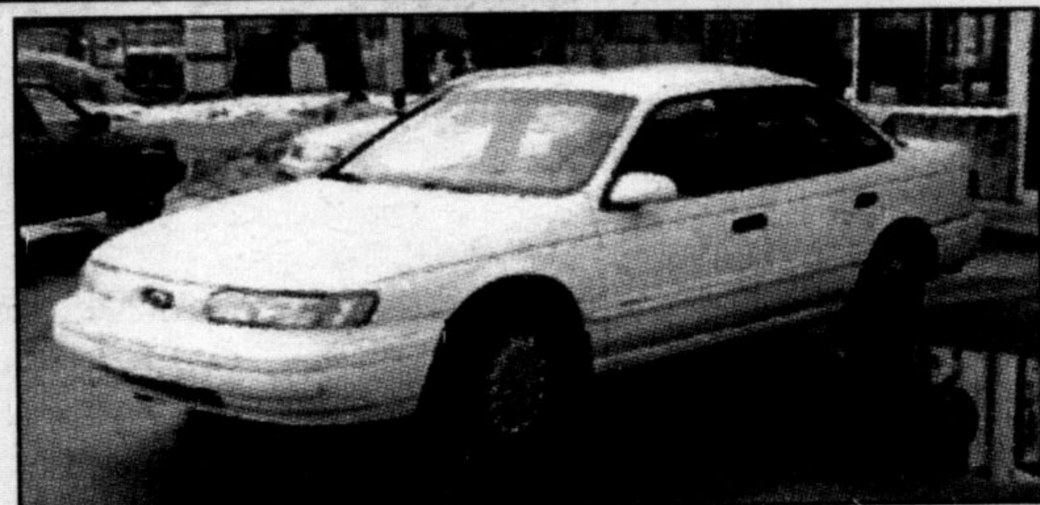
1993 Taurus GL, V6, Auto, A/C, P/W & P/L, $4,195

AUTOPRO West End Auto Service 5 Main St. E. 878-5323