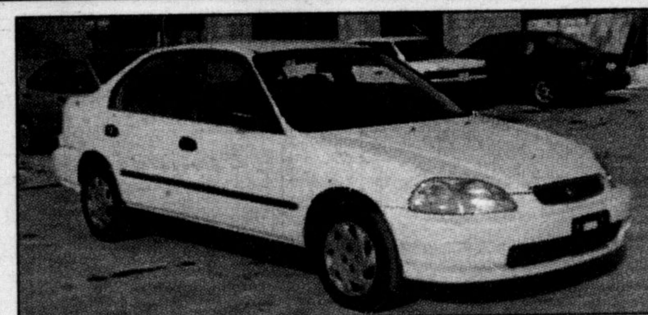
1996 Honda Civic-EX 4 Dr Auto, A/C, Cruise, P/W, P/DL, 65,000 kms, Balance of Honda Warranty.

AUTOPRO West End Auto Service 5 Main St. E. 878-5323