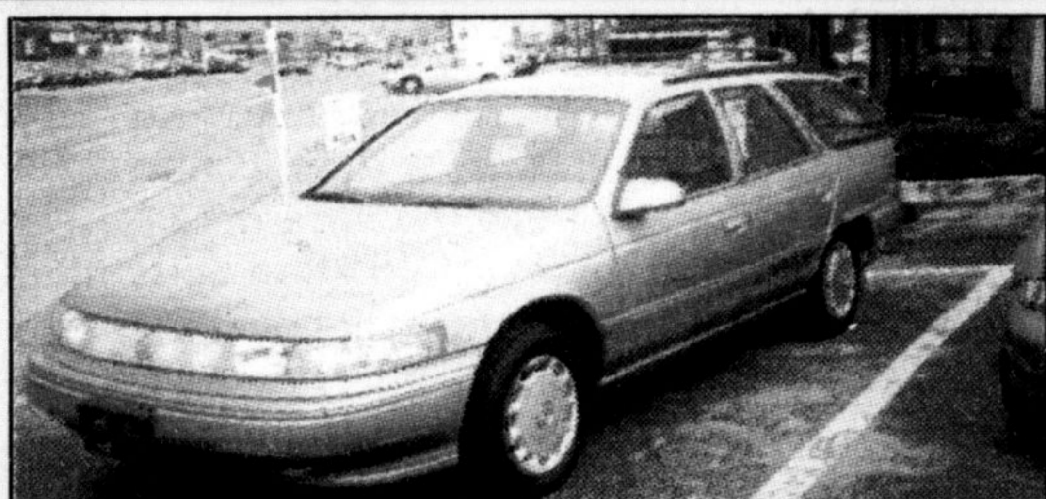
'94 Mercury Sable Wagon Loaded, 104 Kms (low mileage) 1 year warranty $7,495.

slessor 388 Main St. AUTOMOTIVE 875-0089