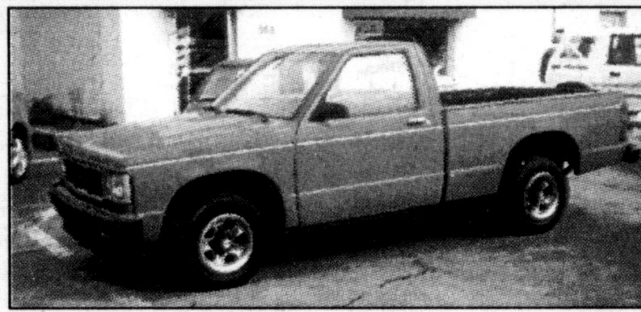
'1988 GMC S15 V6, auto, power steering. Certified & emission checked, includes 3 month warranty. $3,995

slessor 388 Main St. AUTOMOTIVE 875-0089