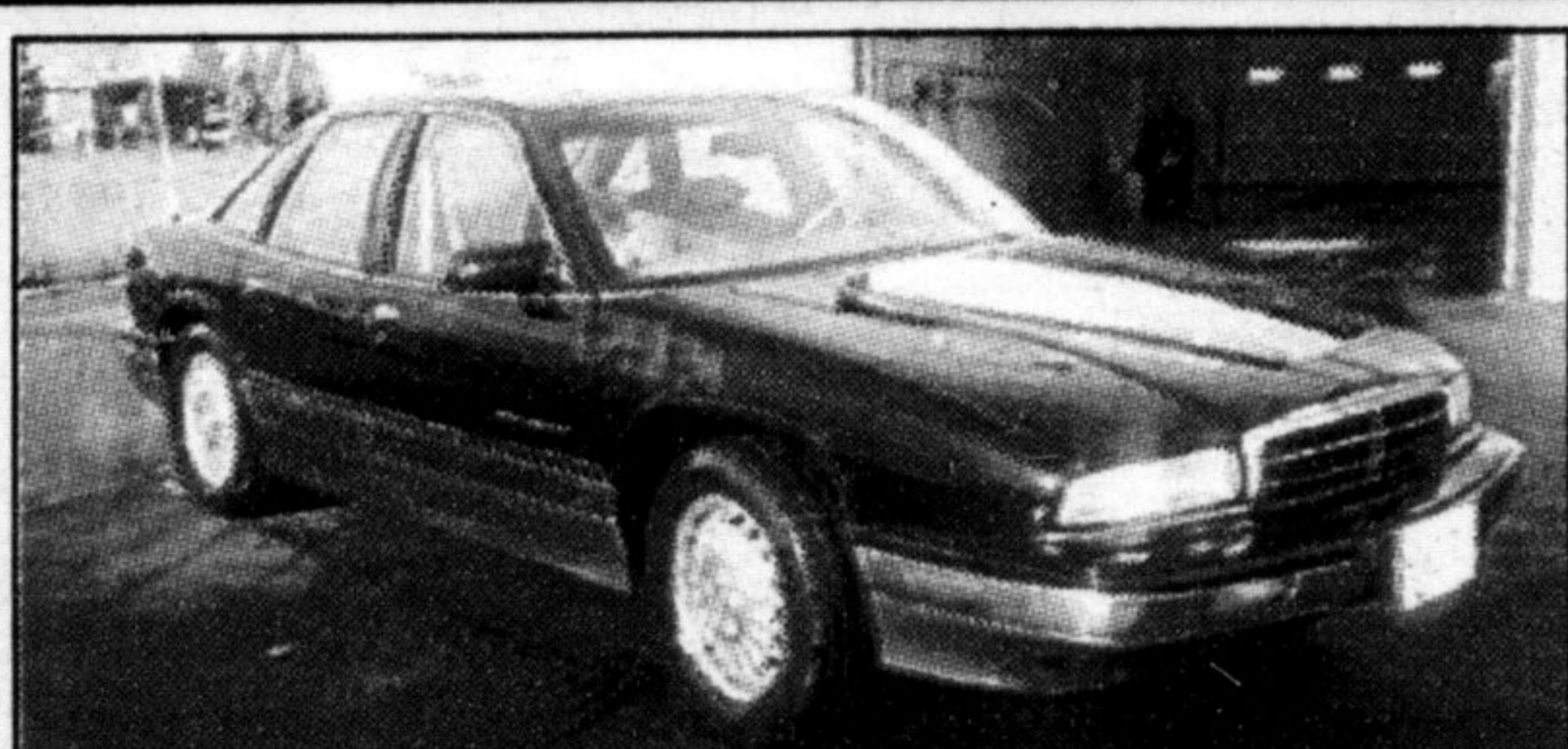
1993 Buick Regal GS - Mint condition, never been in an accident, fully loaded top of the line model. Black ext., Grey leather int., popular 3.8L V6, auto, sunroof. Power everything. 6 month warranty. $6,995

slessor 388 Main St. AUTOMOTIVE 875-0089