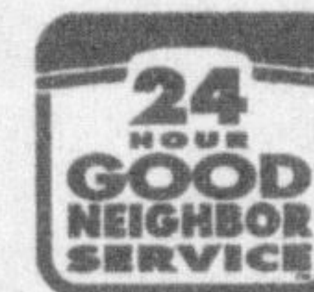
Anita Cutaia 878-8871