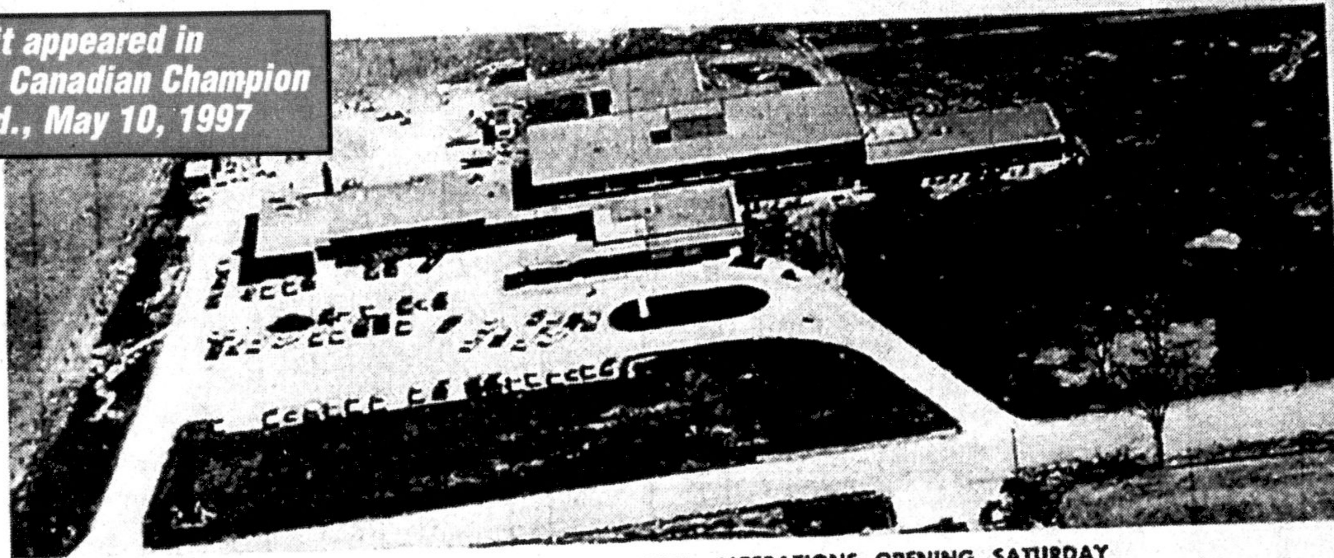
MILTON DISTRICT HOSPITAL ADDITION, ALTERATIONS OPENING SATURDAY