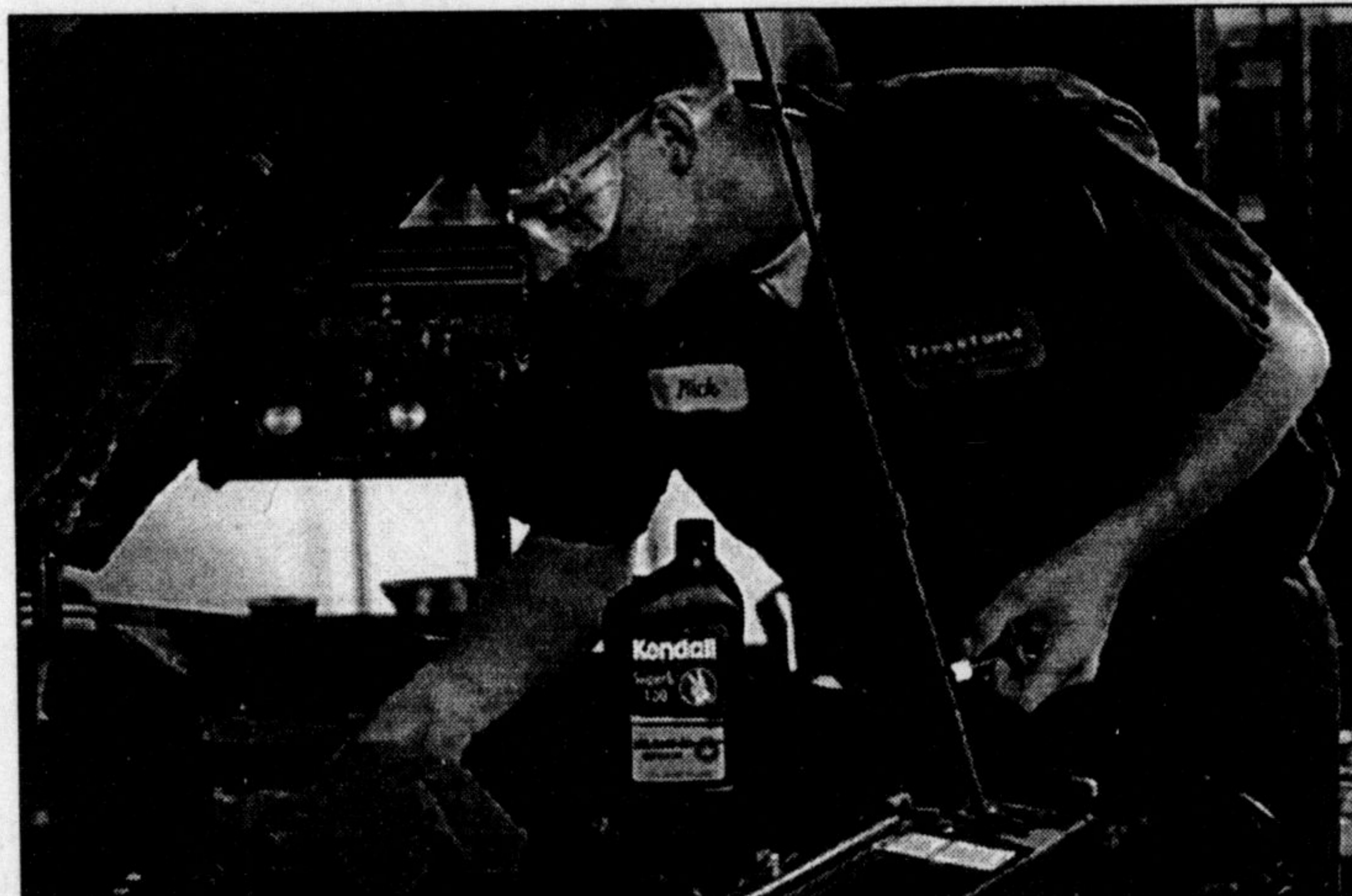
According to engineers at Kendall Motor Oil, car-care centers, like Firestone Tire & Service Centers, are a convenient solution for consumers who want to provide quick and easy maintenance for their cars without dealing with the disposal issues associated with old tires and used oil.

FC99A878