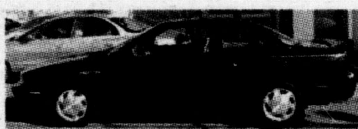
1995 Oldsmobile Achieva