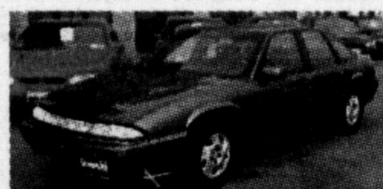
1996 Pontiac Grand Prix