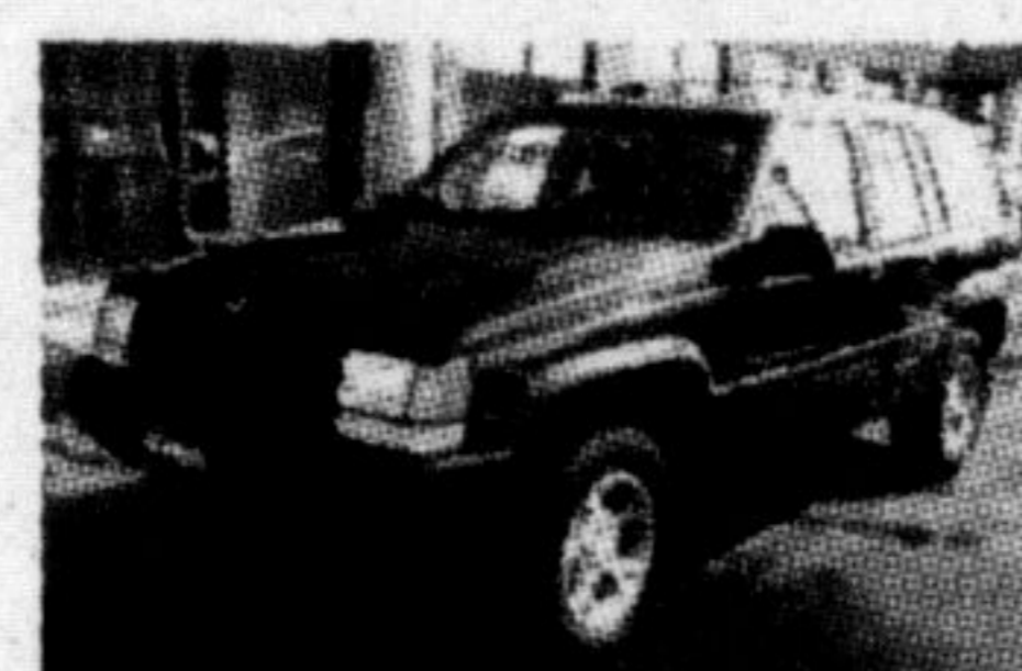
1996 Grand Cherokee