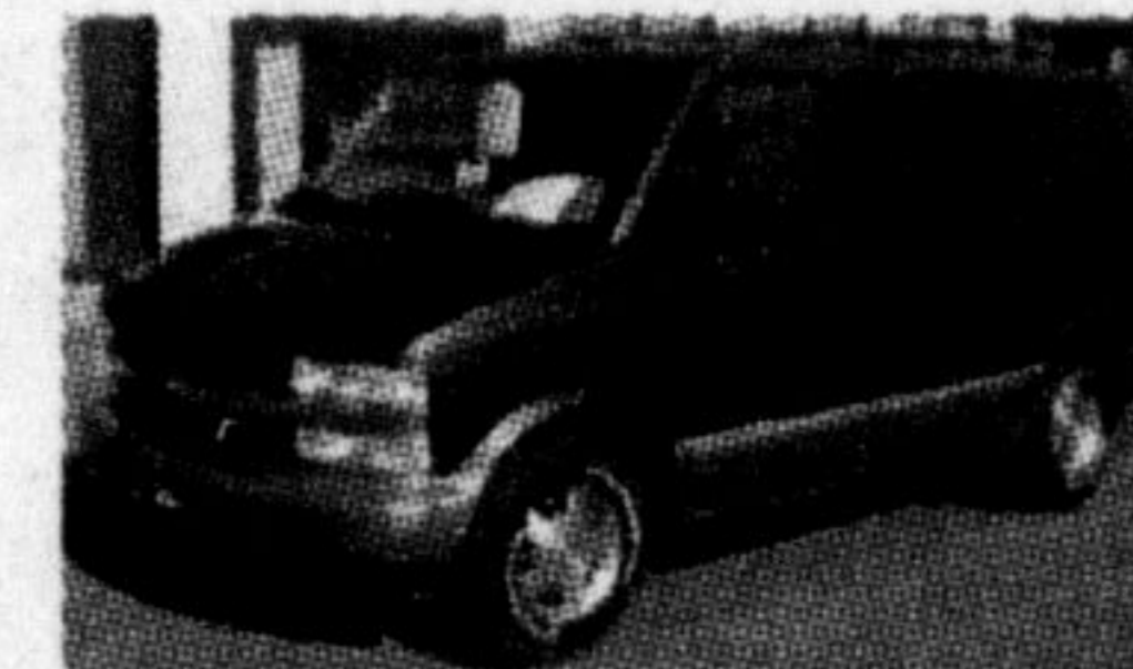
1997 Chevrolet Astro