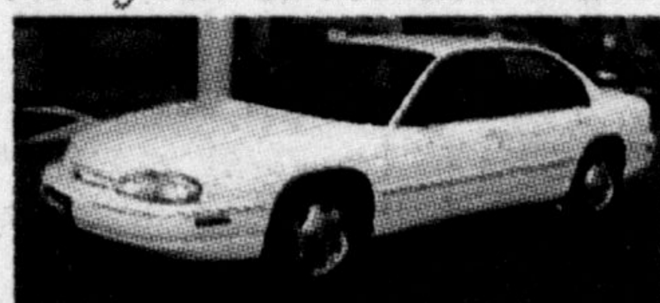
1998 Chevy Lumina