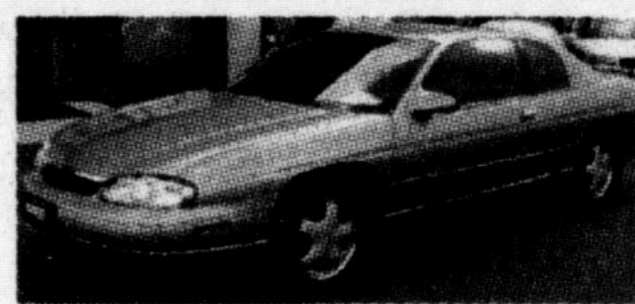
1997 Chevrolet Monte Carlo LS

** 2.9% finance available for 24 months on selected units, see dealer for details, other special finance rates available. Limited time offer.