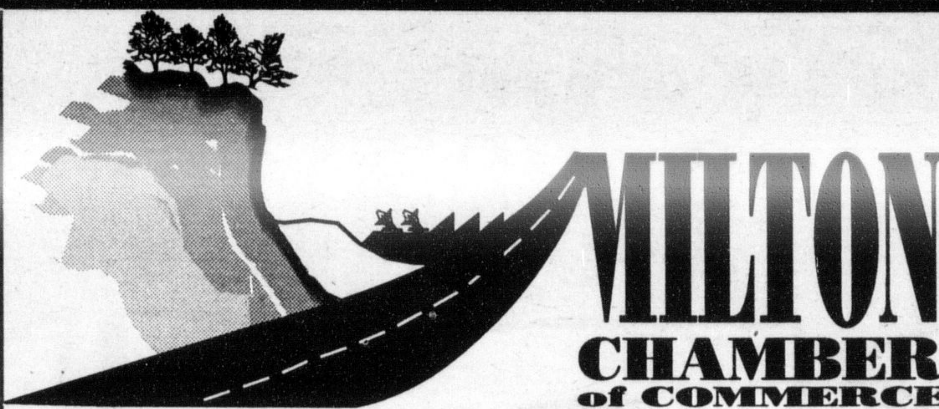
Logo designed by Shoot Photographic

375 Wheelabrator Way, Milton (905) 875-1427 (416) 798-7099