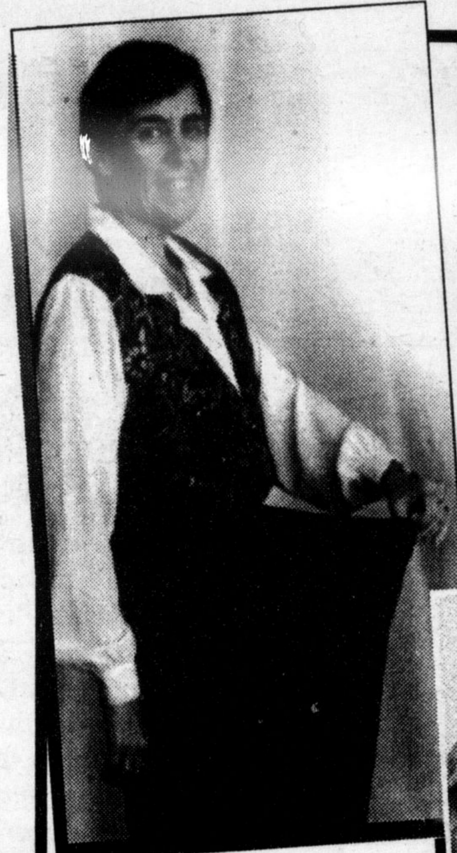
*Based on full program. Excludes product.

Ms Stelter was recognized as an outstanding role model of Catholic leadership who is widely known for her spiritual and emotional support.