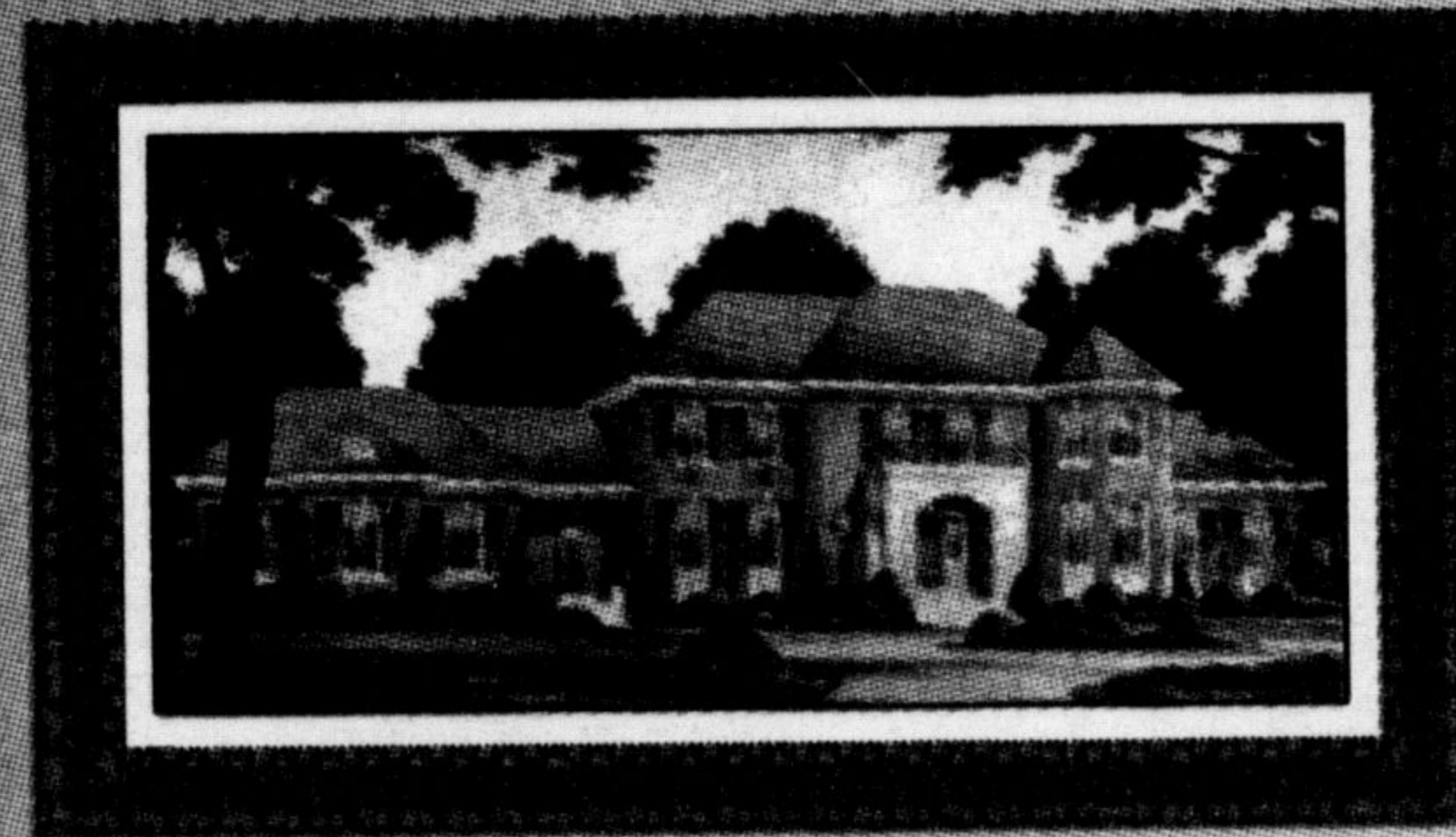
"The Lexington" 3500 Sq. Ft. $469,000