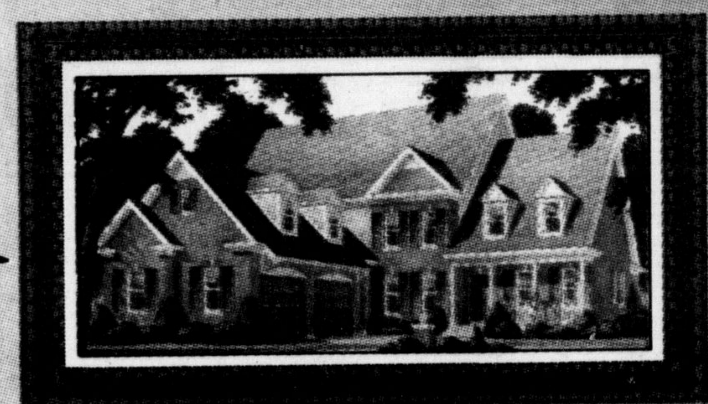
"The Norfolk" 2889 Sq. Ft. $439,000