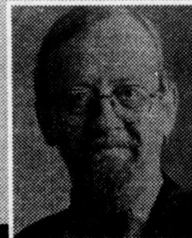
Michael Enright, Host CBC Radio's "This Morning" and the "Aging Dangerously" series