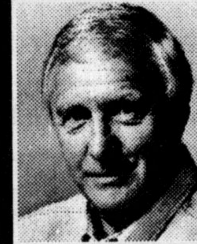
Don Harron, Co-Chair of the Canada Coordinating Committee of the International Year of Older Persons