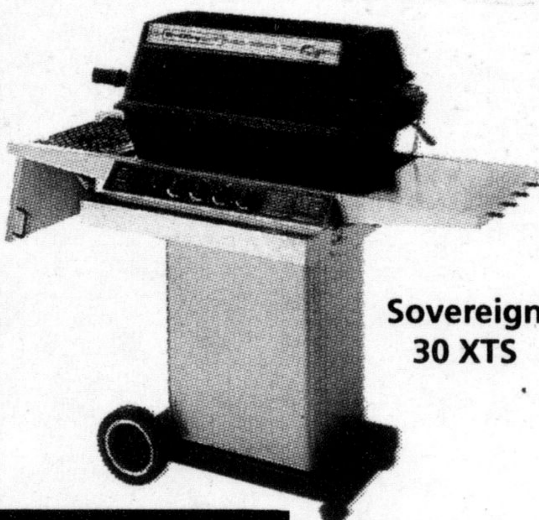
Sovereign 30 XTS

Broil King oven castings are made deeper and thicker than ordinary gas grills. This means better cooking performance at all heat levels.