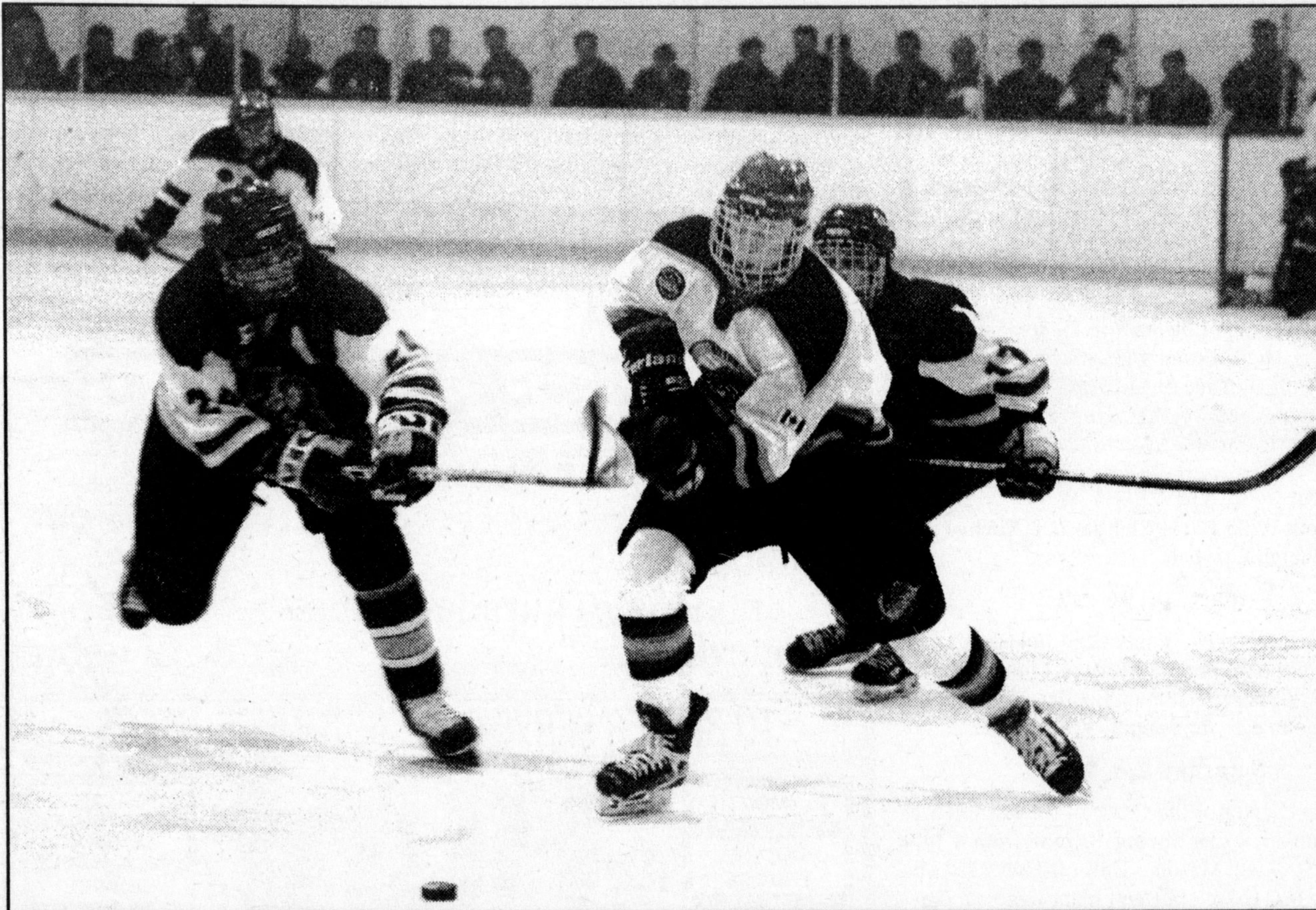
An unidentified Merchants player blows by a couple of Bramalea opponents during game four at Memorial Arena Sunday. Milton won 6-2 to knot the series at two wins each.