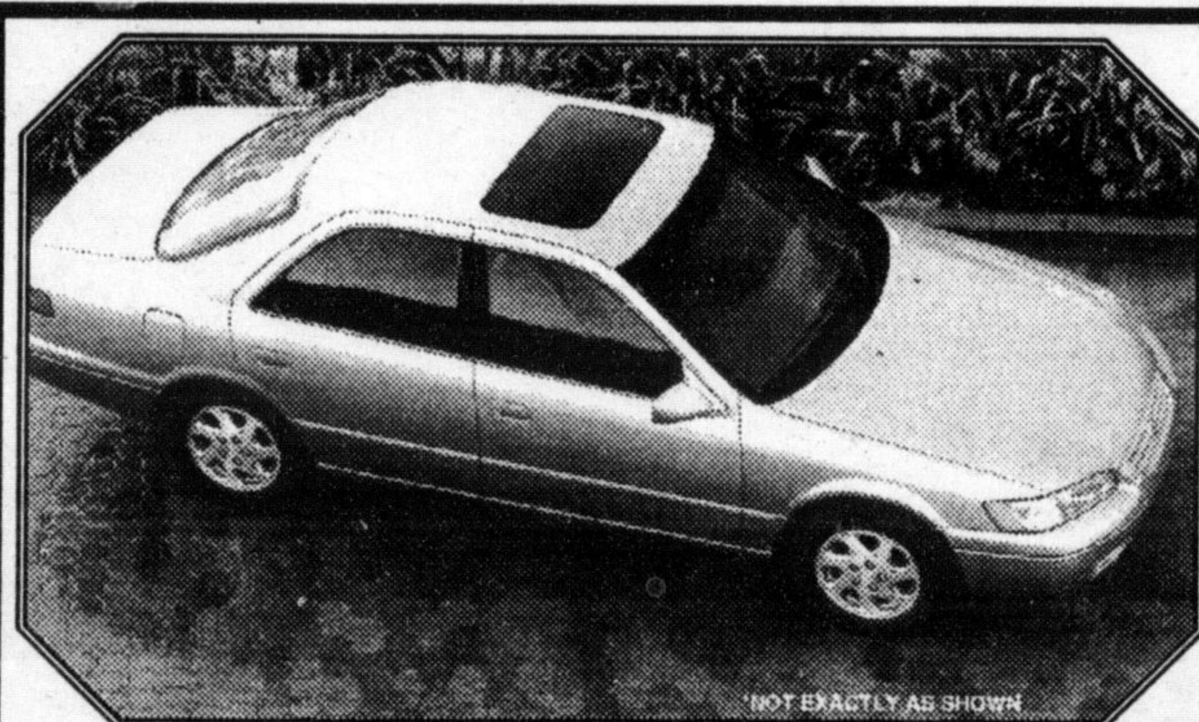
1999 TOYOTA CAMRY CE