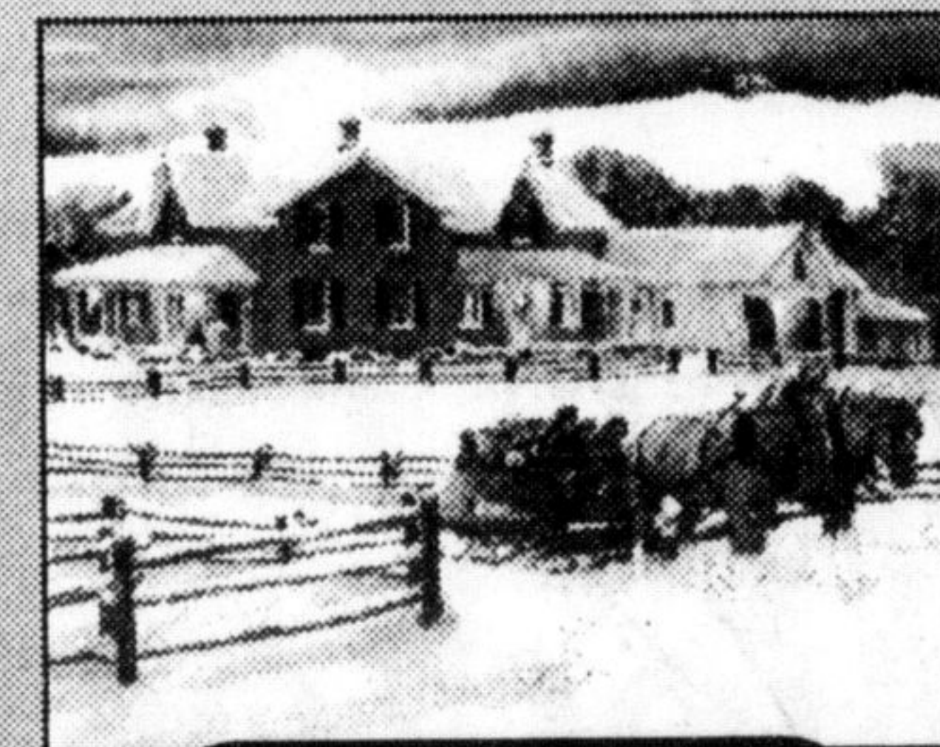
CAMPBELL "Country Homestead"