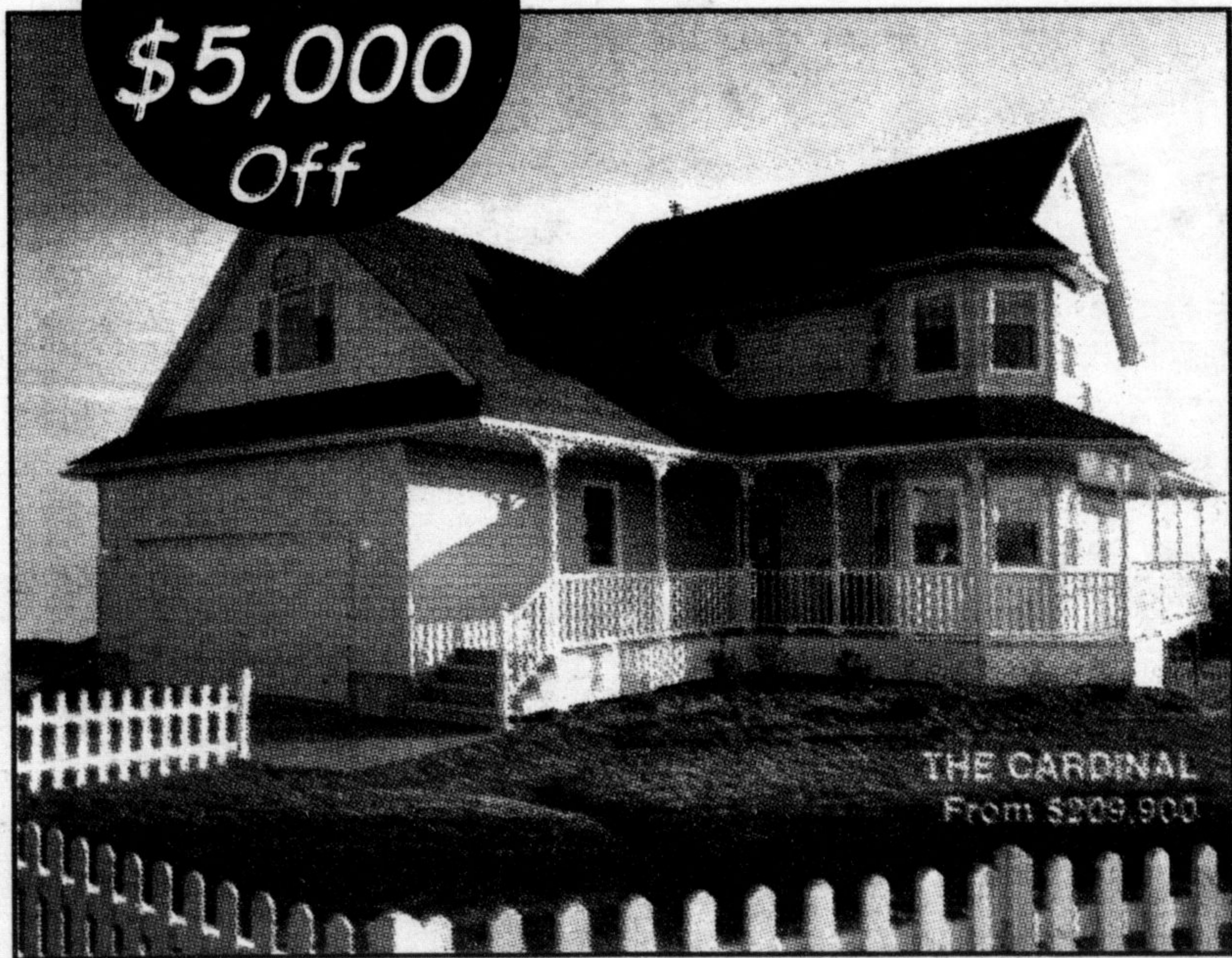
THE CARDINAL From $209,900