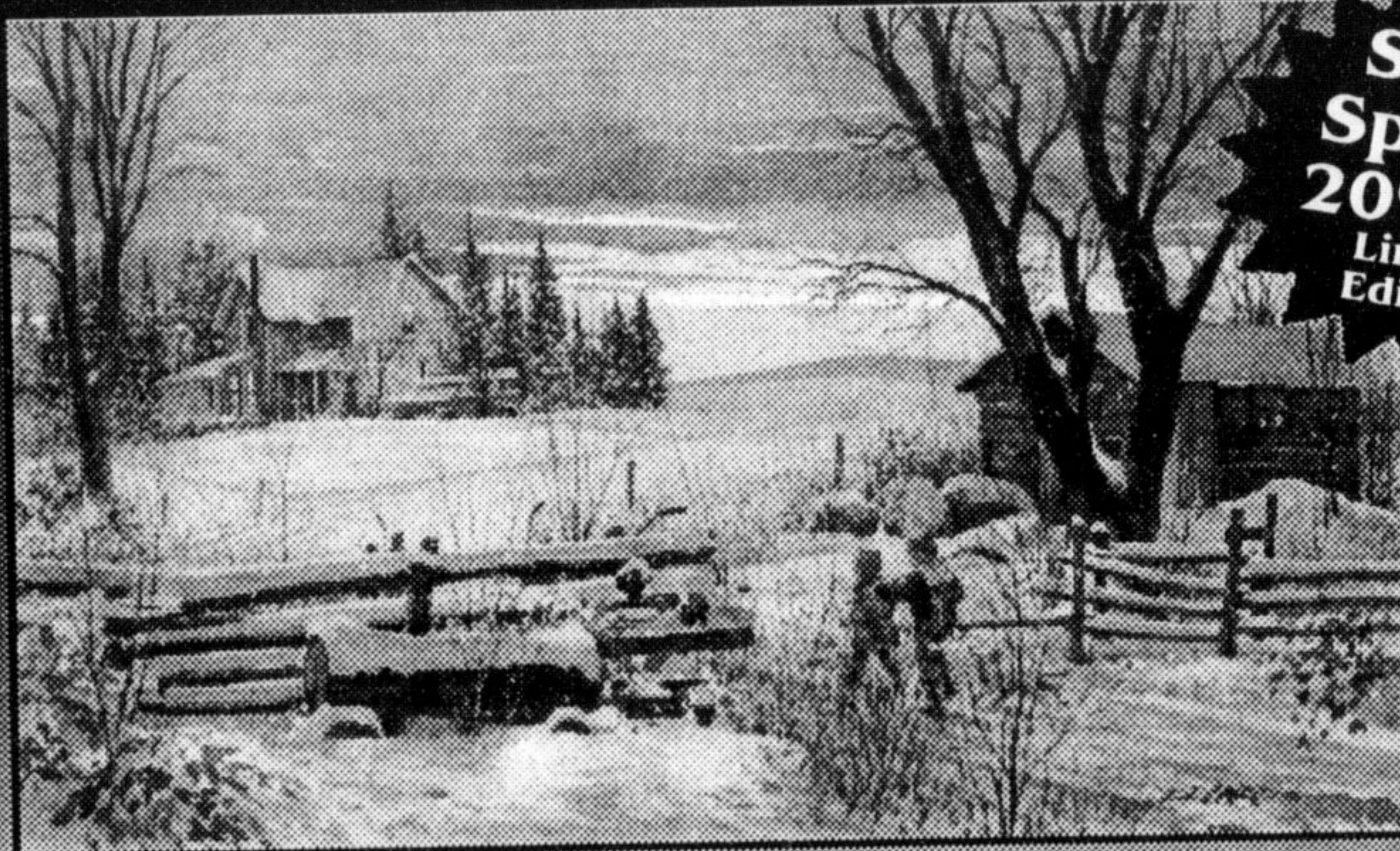
"After the Game" Reg. Price $95.00 unframed