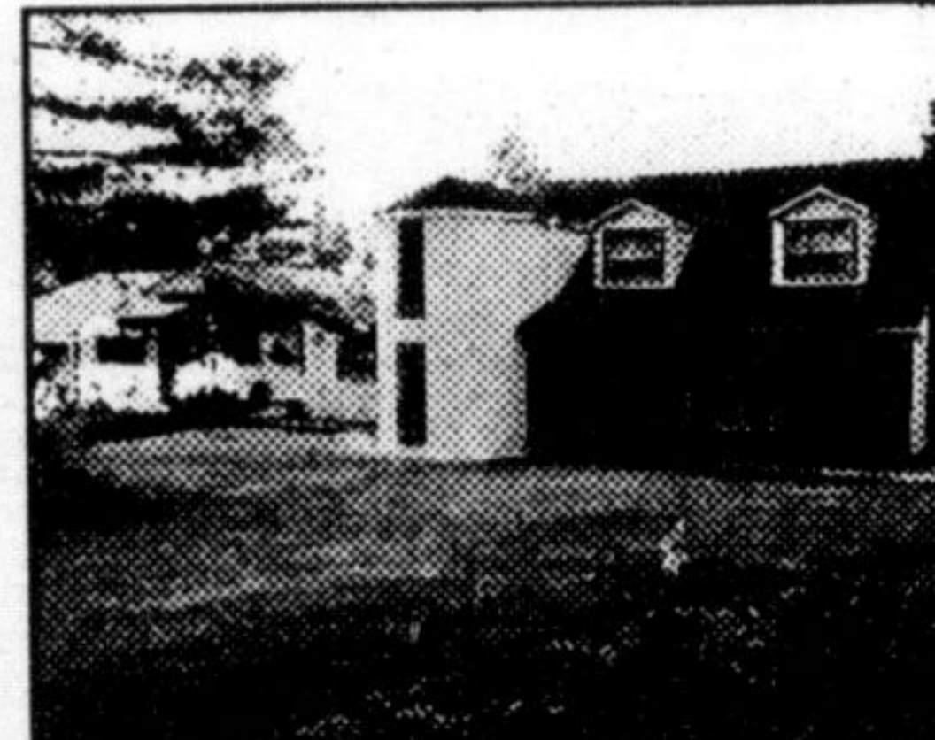
PRIVATE - QUIET

10 acres, natural pond, swimming pool, 4 bedrooms, great room is 25'x23'9". Main bedroom is 21'9"x19' with large 6 pc ensuite. ASKING $485,000 FOR THIS EXECUTIVE HOME. To view or for more information, please Ask for Stewart HADDON, Assoc. Broker. 878-3333.