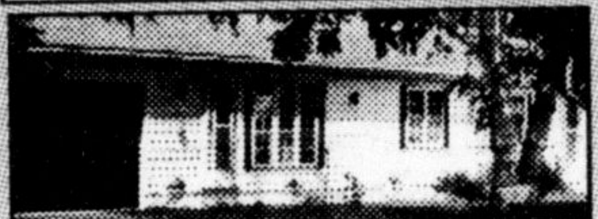
COUNTRY PROPERTY THAT IS AFFORDABLE

3500 sq. ft C1 zoned building available close to downtown core. 5 service bays (possible 6) fully fenced compound. Call me today for more details. Was $299,900. Now $229,900