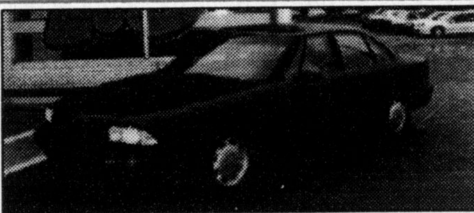
'95 OLDS LSS 4DR

auto, air cond. P/W, PDL, AM/FM cassette & CD Player, power, leather seats, console, alum wheels. Like New. Only 59,000 Kms. Stock #P1737