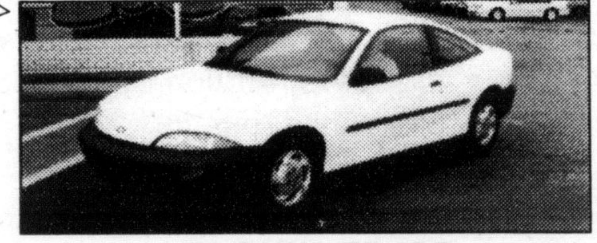
'95 CAVALIER 2DR

auto, air cond., AM/FM cassette, buckets & console, Only 55,000 Kms. Very Clean Stock #P1759