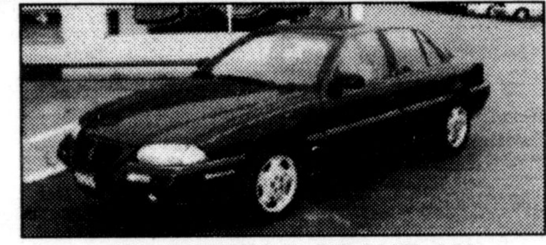
'95 PONTIAC GRAND AM

V6, auto, air cond. P/W, PDL, AM/FM cassette, bucket seats & console, Very clean. Only 59,000 Kms. Stock #P1726