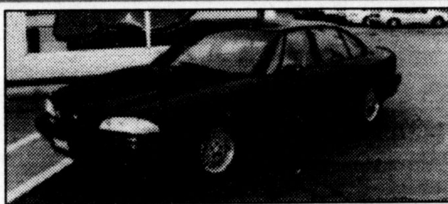
'95 BONNEVILLE SE 4 DR

V6, auto, air cond. P/W, PDL, tilt cruise, AM/FM cassette, sliding roof, leather buckets & console, alum wheels. Only 59,000 Kms. Stock #P1733