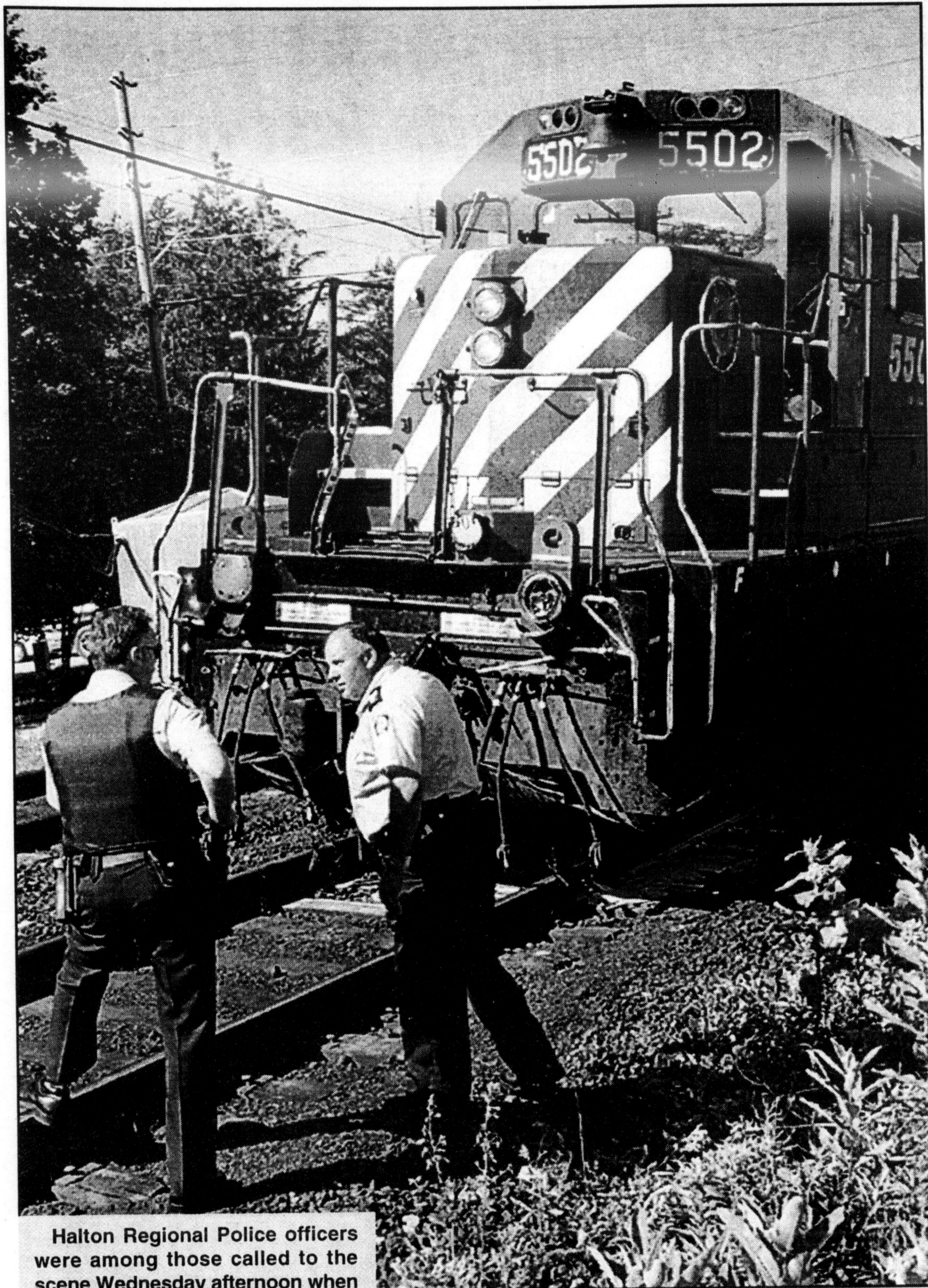
Halton Regional Police officers were among those called to the scene Wednesday afternoon when a CP train struck a crane/railway tie remover in rural Campbellville.