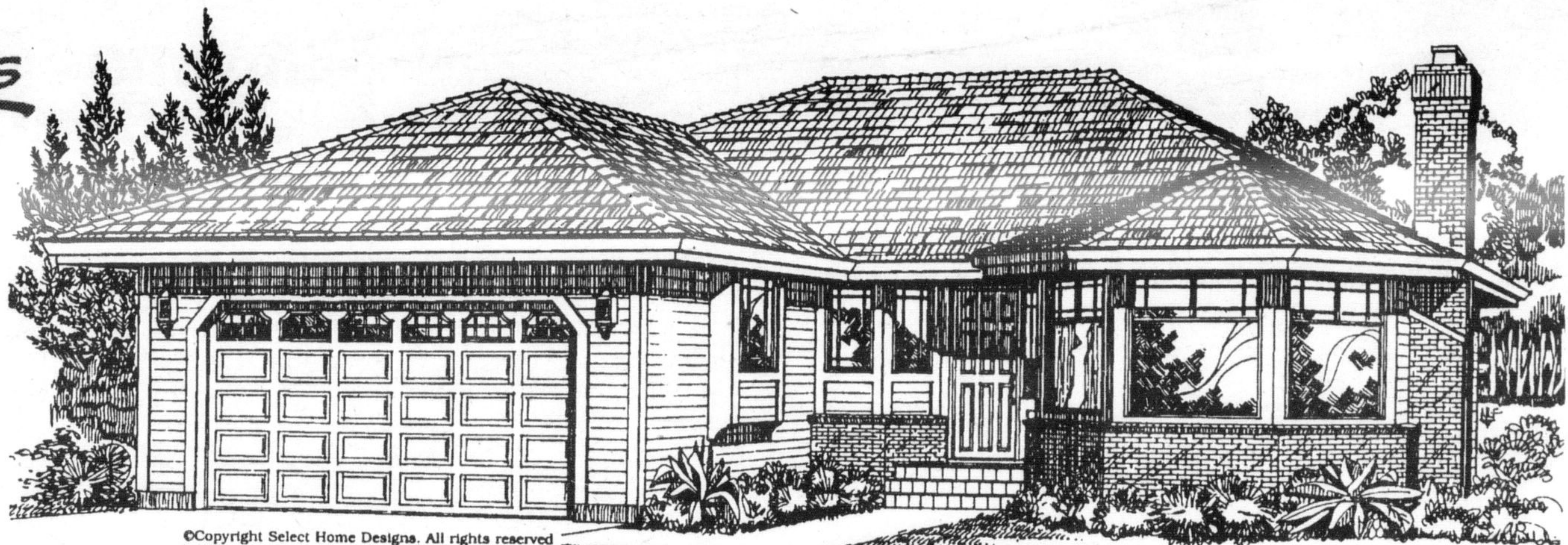
Plan No. 1688-1495