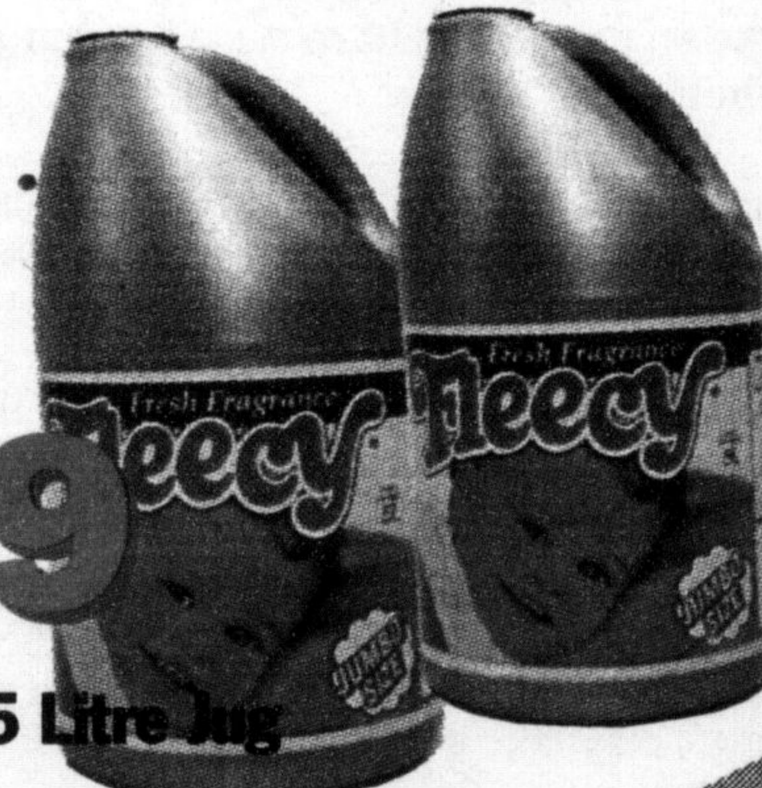
5 Litre Jug