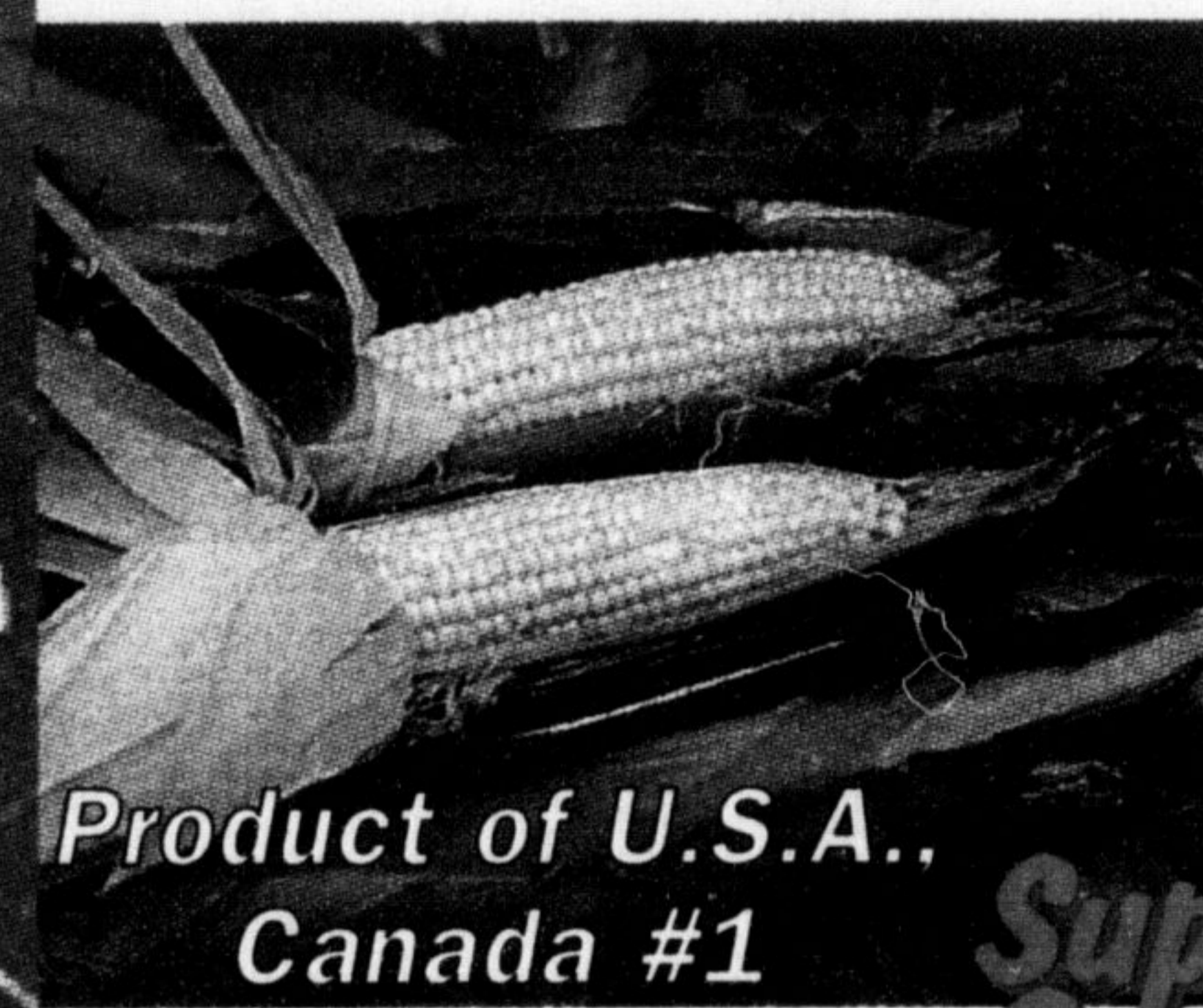
Product of U.S.A., Canada #1