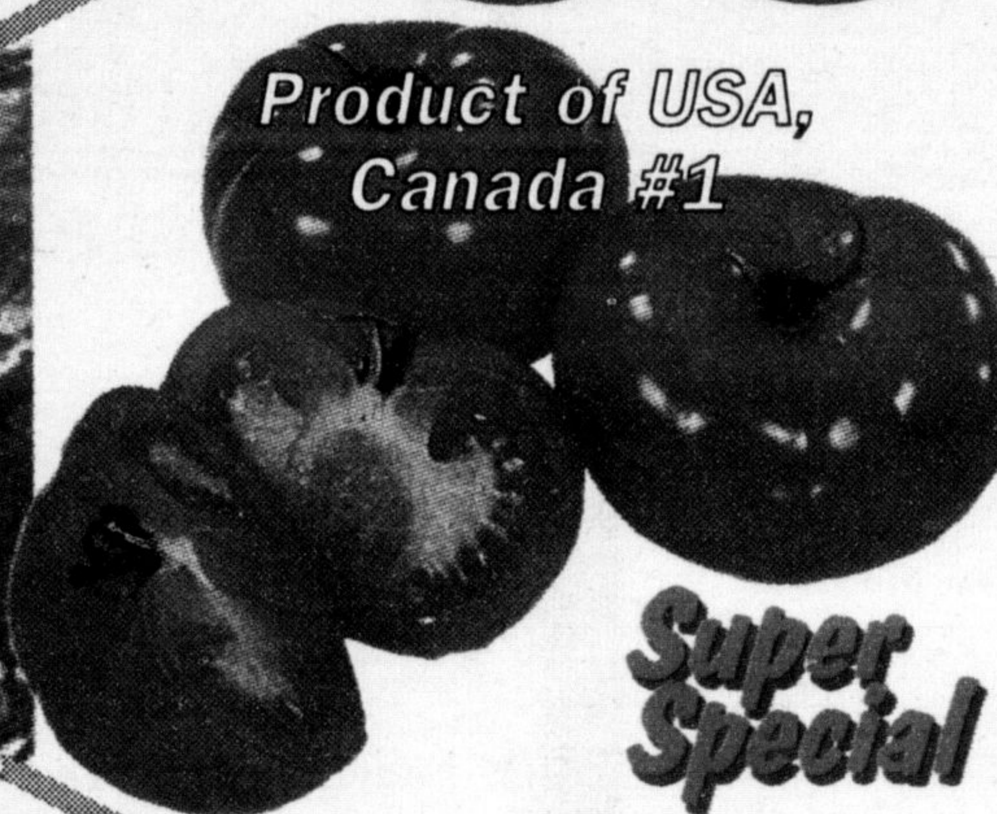
Product of USA, Canada #1