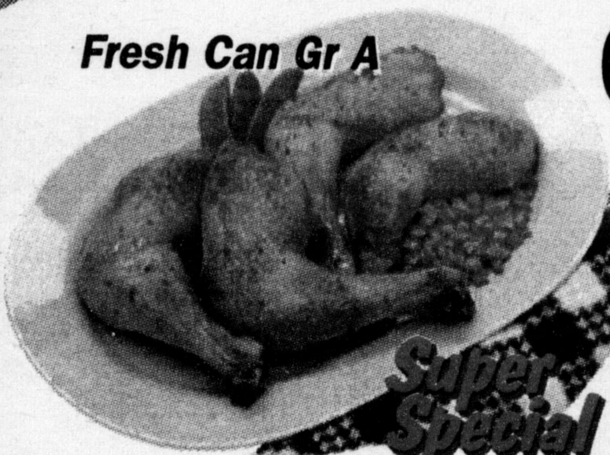
Fresh Can Gr A