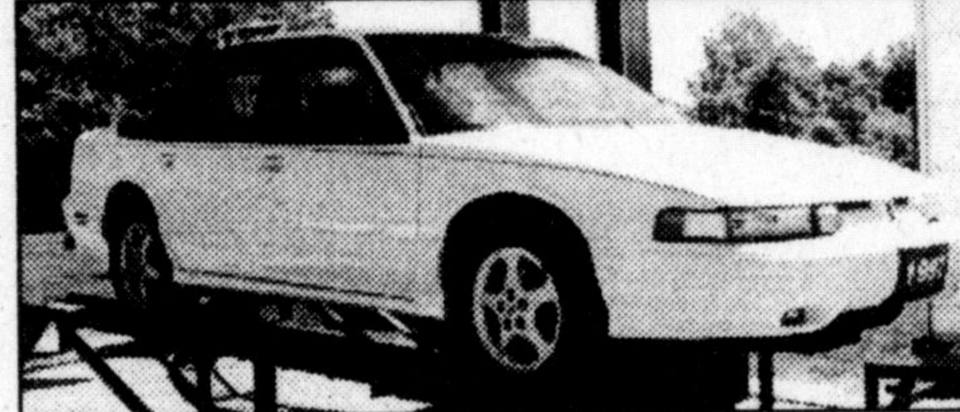
'97 CUTLASS SUPREME SL 4DR

V6, auto O/D, air cond., P/D locks, P/windows, tilt, cruise, AM/FM cassette, bucket seats, console, alum. wheels. Balance of factory warranty. Stock #P1710