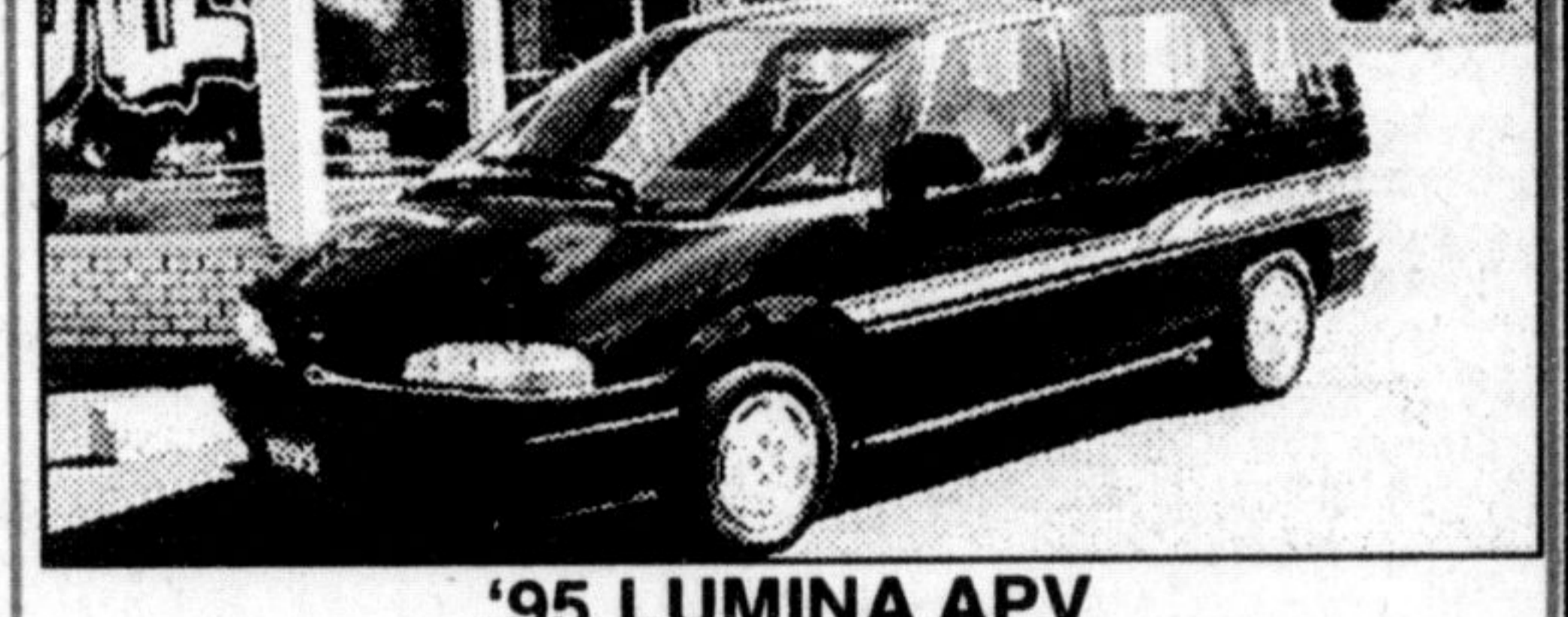
'95 LUMINA APV

V6 eng, auto, air cond., AM/FM cassette, stripe package. Only 57,000 kms. Stock #P1690. 6 month warranty.