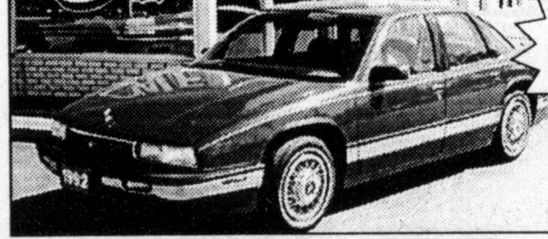
'92 BUICK REGAL LTD 4 DR

3800 V6, auto O/D, P/windows, P/D locks, tilt, cruise, air cond., AM/FM cassette, wire wheels & more. Stock # P1656