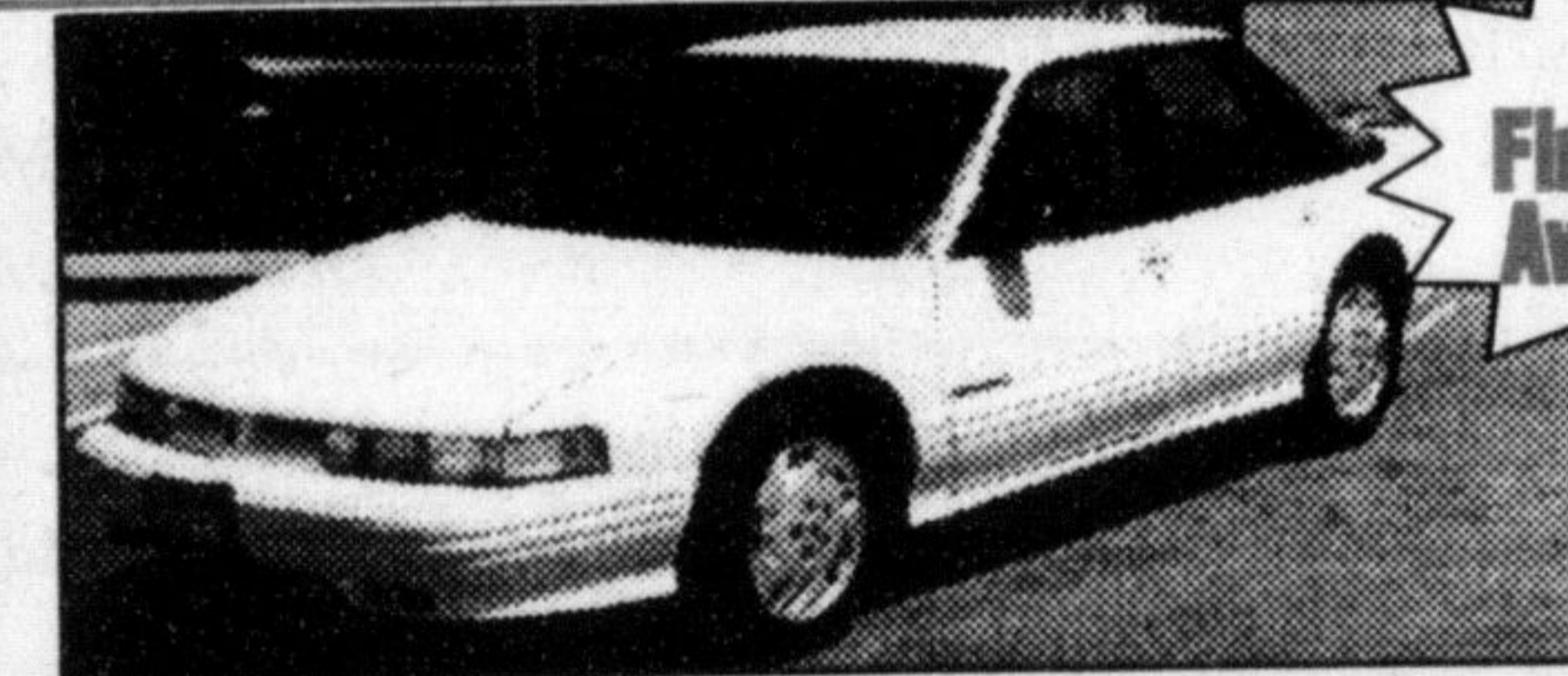
'94 CUTLASS SUPREME SL 4DR

V6, auto O/D, air cond., P/windows, P/locks, tilt, cruise, AM/FM cassette, bucket seats, console, alum. wheels, low kms. Very clean. Stock #1504A