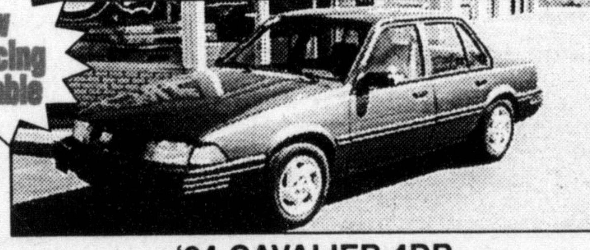
'94 CAVALIER 4DR

Automatic, air cond., AM/FM cassette. One owner, only 84,000 kms. Stock #1205A.