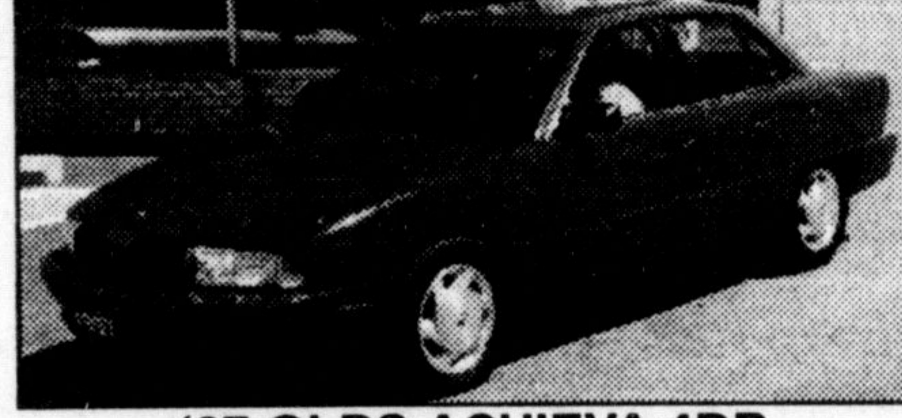
'97 OLDS ACHIEVA 4DR

V6, auto O/D, P/locks, P/windows, P/seat, tilt wheel, cruise, air cond., AM/FM cassette, buckets, console & alum. wheels. Balance of factory warranty. Stock #P1720