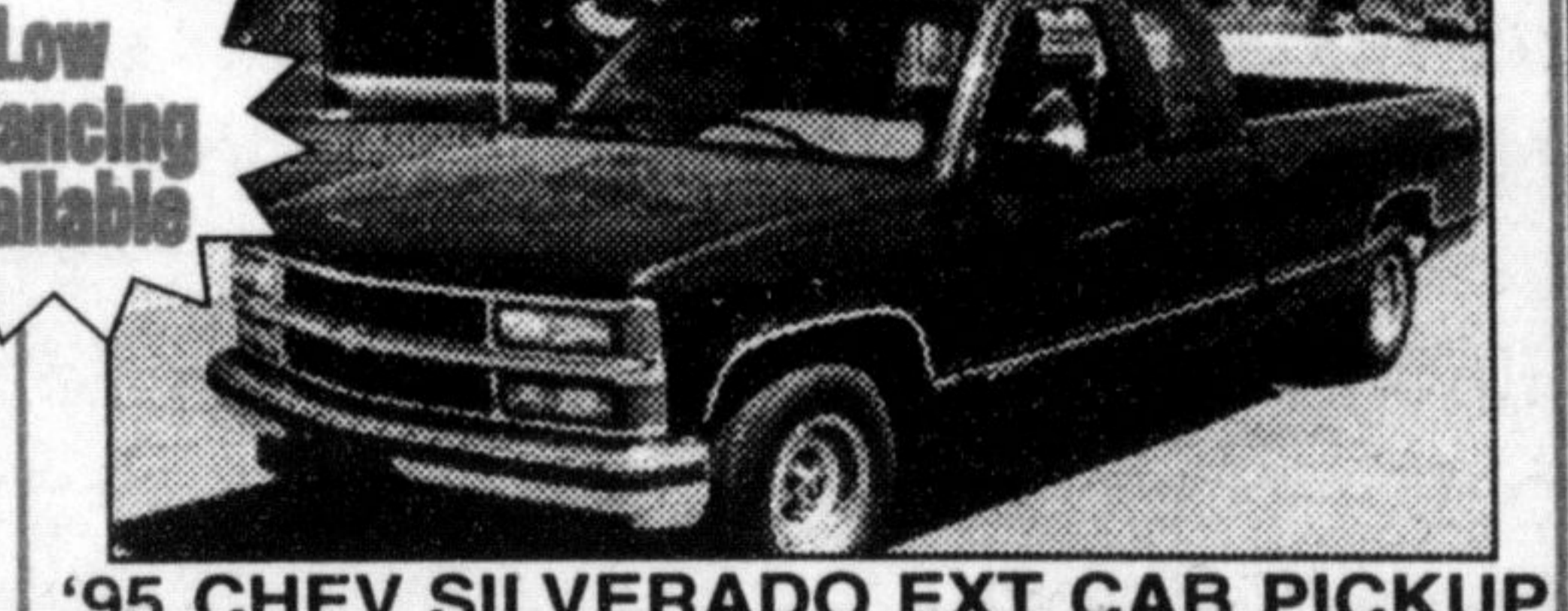
'95 CHEV SILVERADO EXT CAB PICKUP

V8 eng, auto O/D, air cond., P/windows, P/locks, tilt, cruise, AM/FM cassette, box liner. Only 39,000 kms on this one owner. Stock #1706