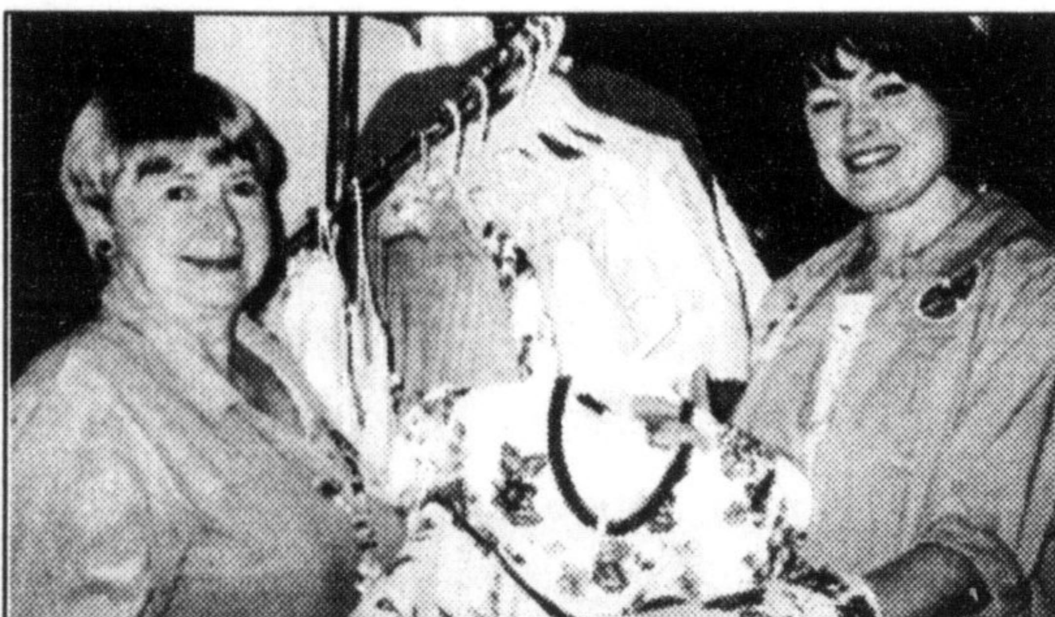
MDH Auxiliary Members displaying a few of the beautiful pieces of nightwear available in the MDH Gift Shop.

will be here on Sunday, May 10th. Drop into the MDH Gift Shop and buy a very special gift for a very special mother. Remember the Gift Shop is always GST free!