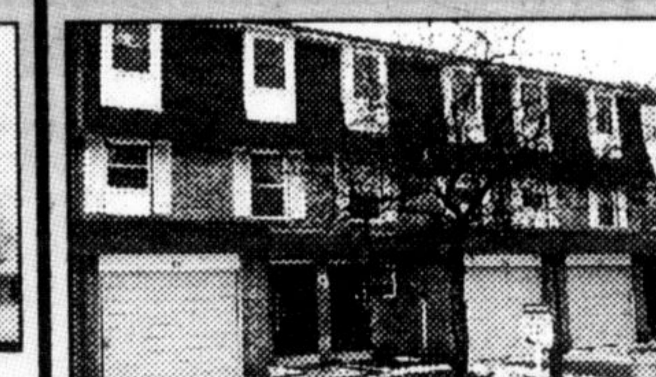
GREAT FAMILY AREA 3 bedroom Townhouse, 2 piece ensuite, fridge, stove, fenced back yard. Excellent tenants would like to stay. $123,900. Please call