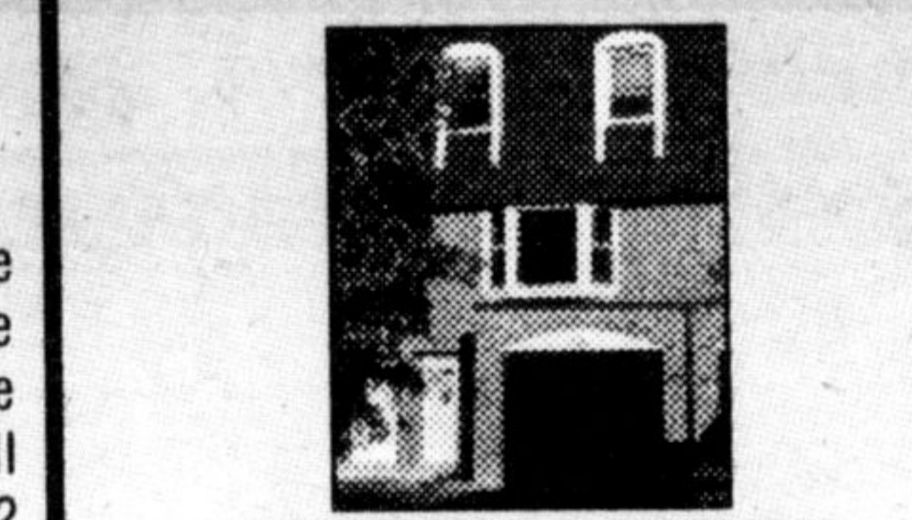
PERFECT LOCATION Treed garden backing onto private homes, faces park, finished pine rec. room, kitchen walk-out to patio, new kitchen, tastefully decorated, air cond. & many more upgrades - must be seen! Please call Wayne Casson to view.