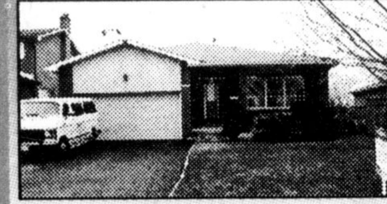
NEW LISTING 2250 sq. ft. backsplit with inground pool, large lot, 3/5 bedrooms, 3 baths. Shows very well. $269,900. Call Audrey or Chris to view.