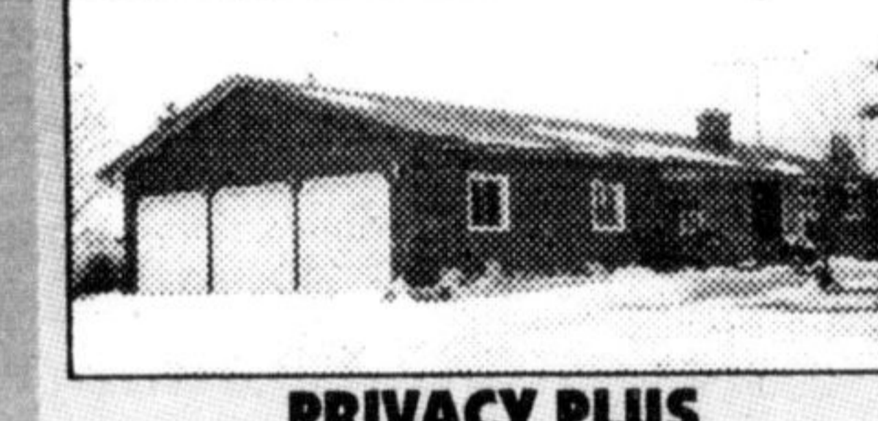
PRIVACY PLUS Immaculate 3 bedroom home complete with upgraded kitchen, L shaped living room & dining room with walkout to sunroom. Lower level has a separate outside entrance and offers a large rec room, family room with fireplace, den or office and extra washroom. Located just north of 401 on a gorgeous one acre lot. Offered at $275,500. Call Bill Currie at 878-4944.