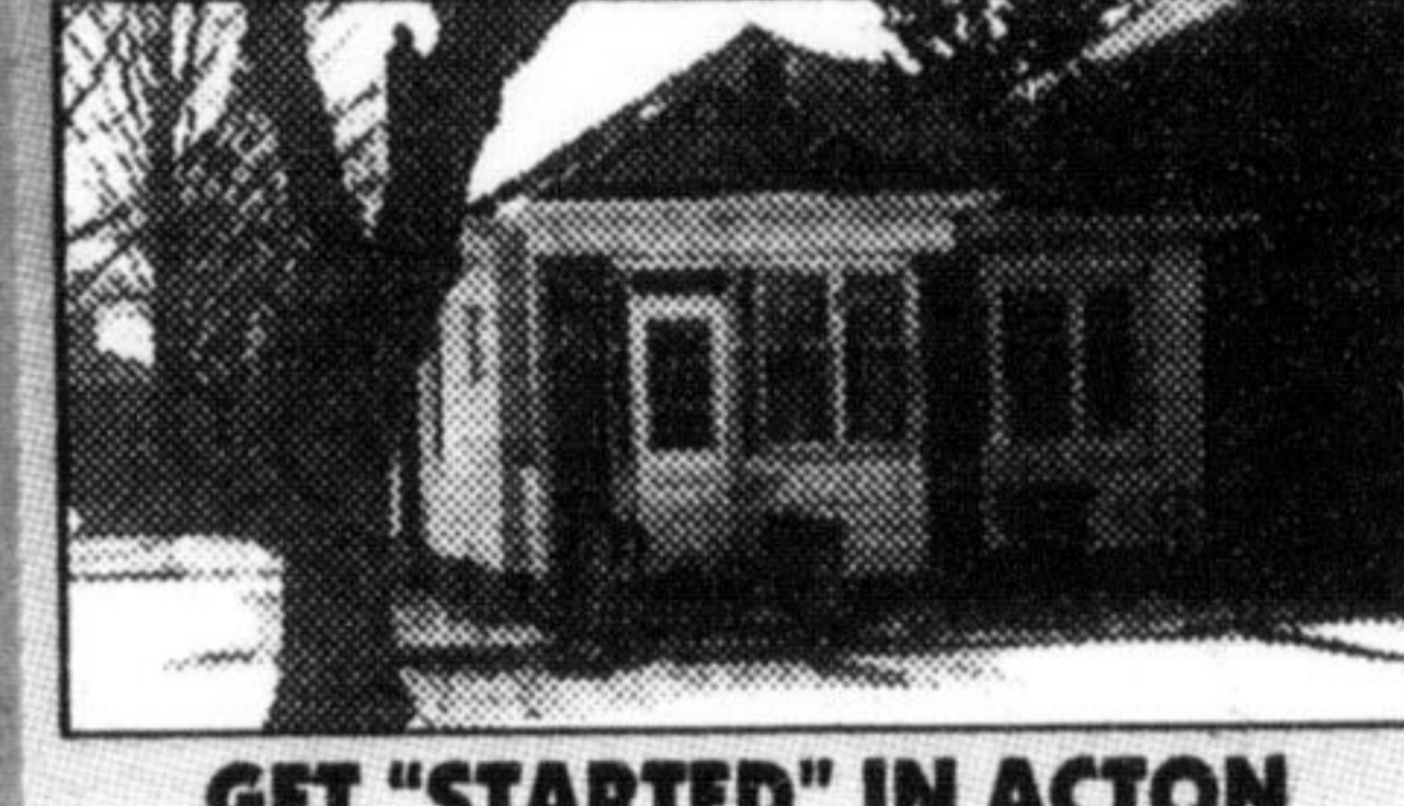
GET "STARTED" IN ACTON Cute starter home in mature area. Home features full in-law suite, and that's not all. Include 2 fridges, 2 stoves, freezer plus washer & dryer. Asking $149,900. Call Ron Twiss to see. 878-4444.