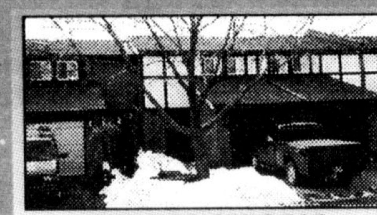
WALK TO SCHOOLS Attractive 3 bedroom home in Dorset Park. Features include eat-in kitchen, walk-out from living room, finished recreation room, 2 washrooms and great location. Offered at $125,900. Please call Bill Currie at 878-4944 to view.