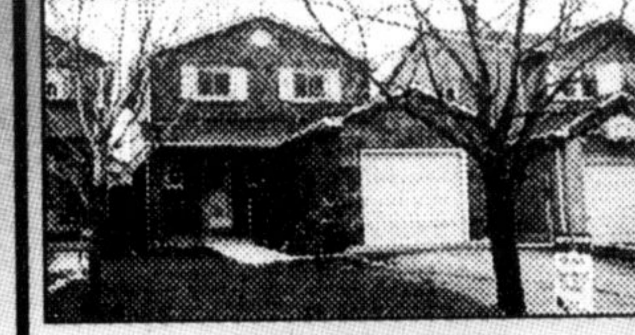
154' DEEP LOT! 3 bedroom home is very well maintained. Many upgrades including broadloom with insert. $189,900. Call Audrey or Chris to view.