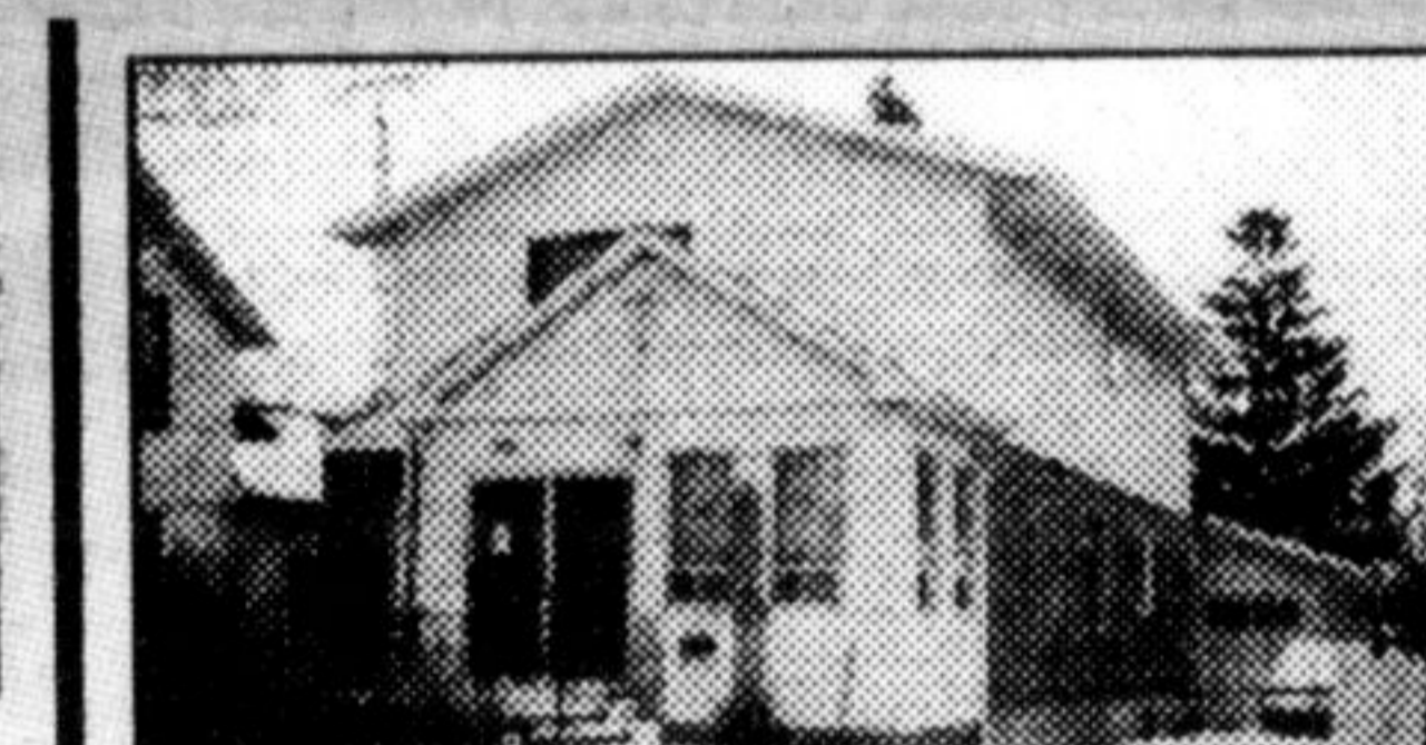
IMMACULATE!! Contact Bill Currie to view this Bronte Meadows Home. Features include 3 spacious bedrooms, 3 washrooms, eat-in kitchen, formal dining room & livingroom with walkout, recreation room, central air and large lot. Offered at $189,900.