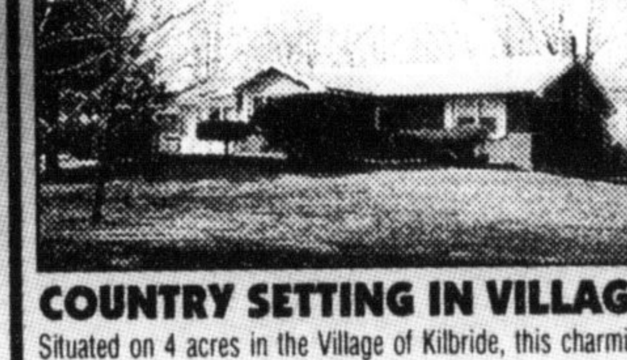
COUNTRY SETTING IN VILLAGE Situated on 4 acres in the Village of Kilbride, this charming bungalow offers 3 bedrooms, eat-in kitchen, living room, dining room & den on main level. The lower level has a separate entrance from outside. Also includes a 2 stall barn. Offered at $339,900. Call Bill Currie at 878-4944 to view.