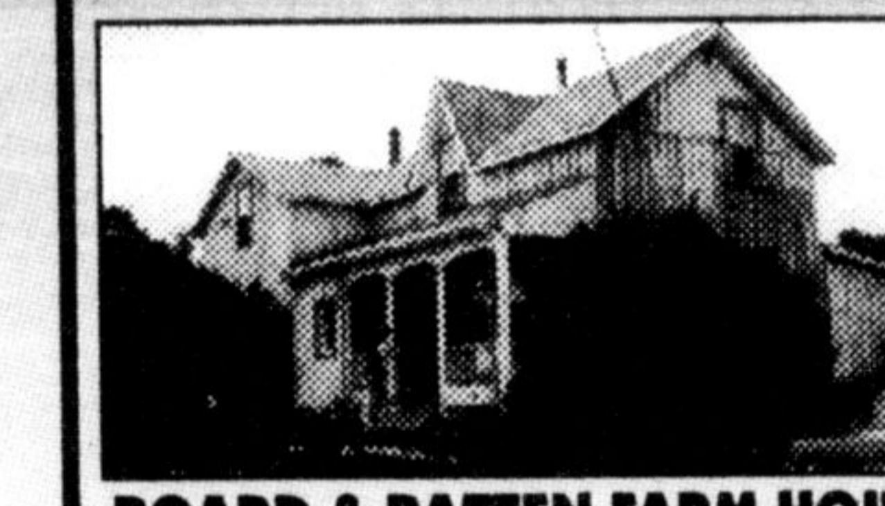
BOARD & BATTEN FARM HOUSE Offering 4 bedrooms and 2 baths, with a view in all directions. 83 acre corner farm with a bank barn with hydro and water. Asking $369,000. Make your dream come true. Please call Audrey.