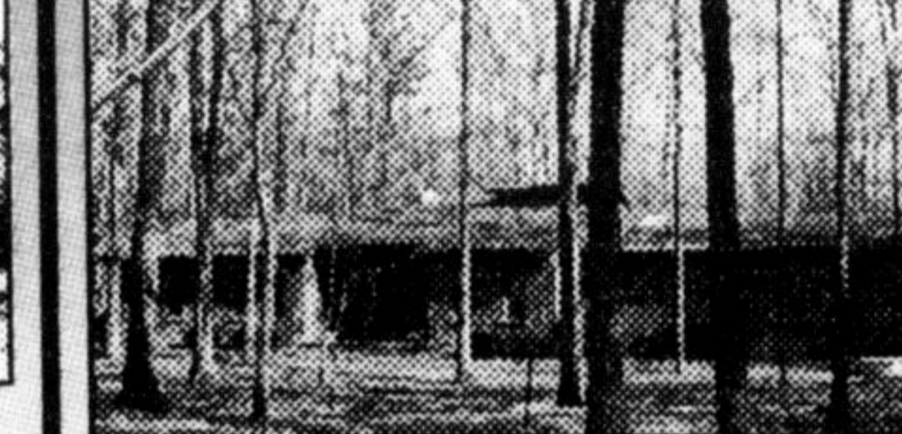
SUPER BUNGALOW Super bungalow on a treed lot in exclusive rural subdivision. Open plan liv/din/fam rooms with 2 fireplaces. 3 bedrooms. $399,000. Please call Audrey for your viewing.