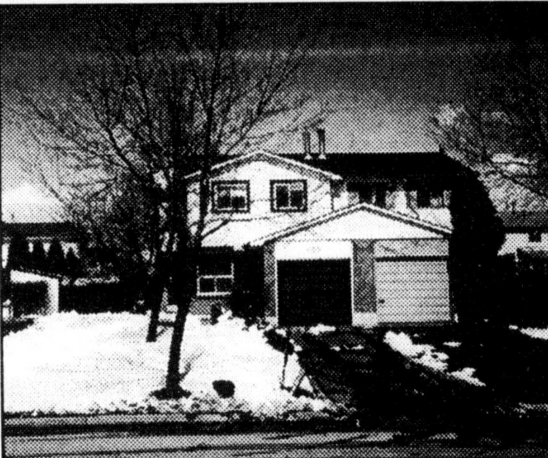
$174,900. Attractive well maintained 3 bedroom semi in good location. Call Ellen Boer.