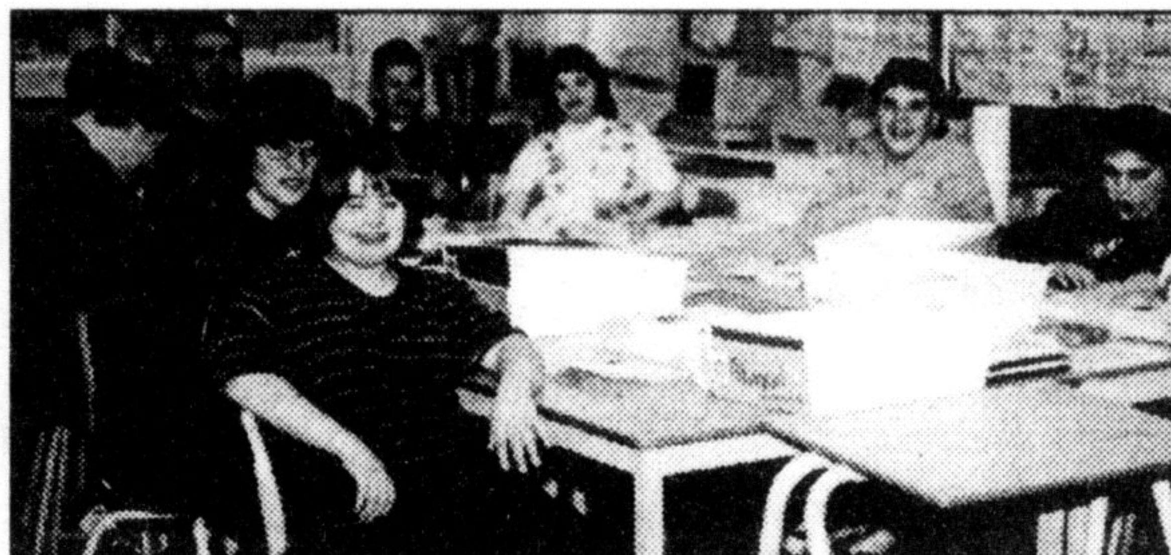
E. C. Drury Workshop students volunteered to help collate the Easter Seals donation envelopes.