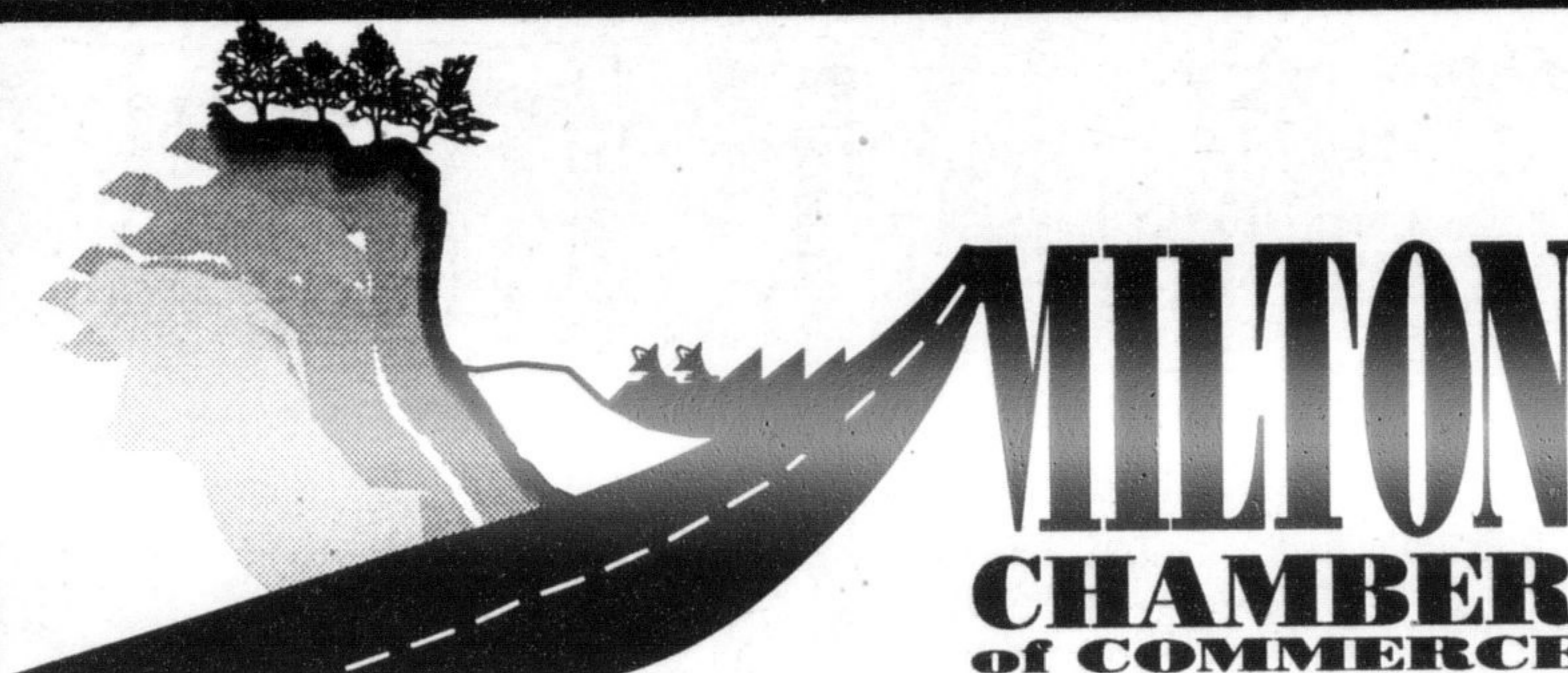
Logo designed by Shoot Photographic

Please visit our web site at: http://www.sunnyoasis.com