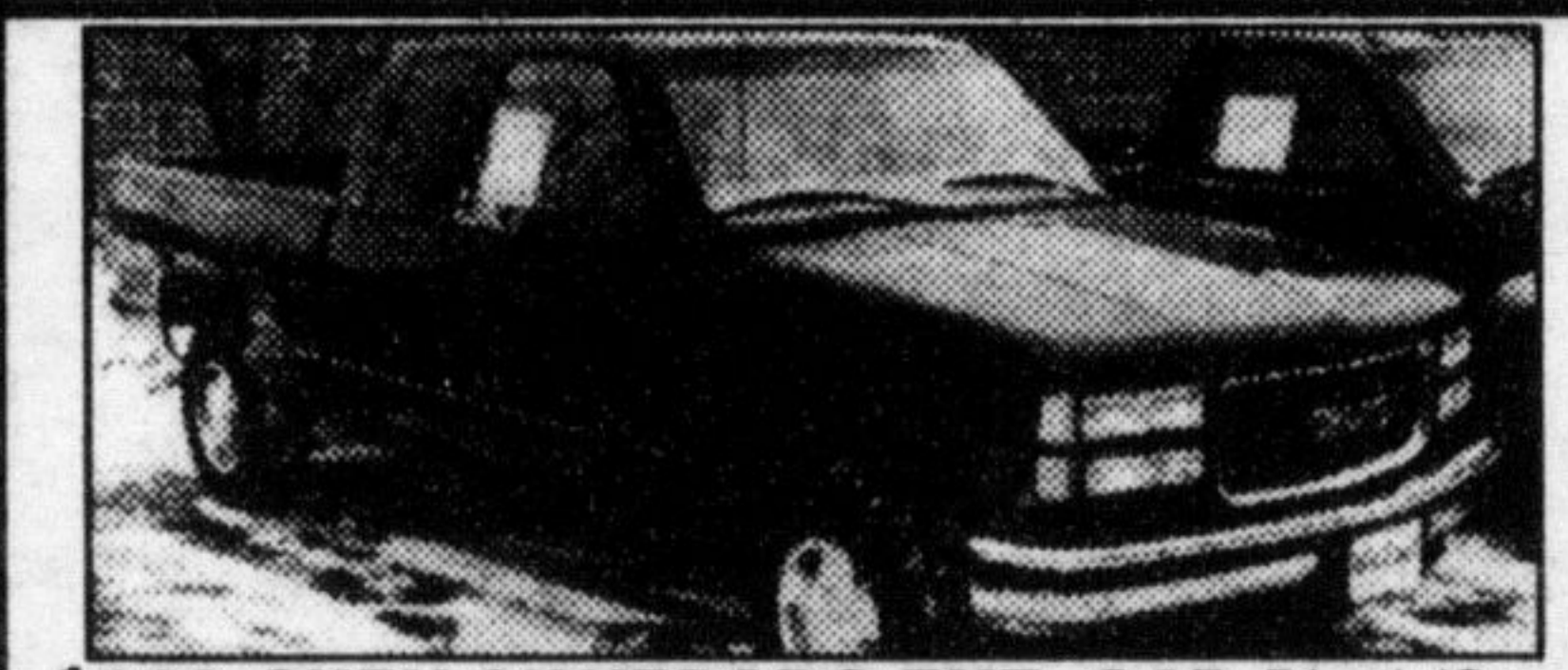
1996 CHEV SILVERADO EXT. CAB Black/Grey cloth. V8, auto., 4X4, air, P.W., P.L., tilt, cruise, alloy wheels, bed liner, trailing package. Balance of factory warranty. Only 58,000 kms.