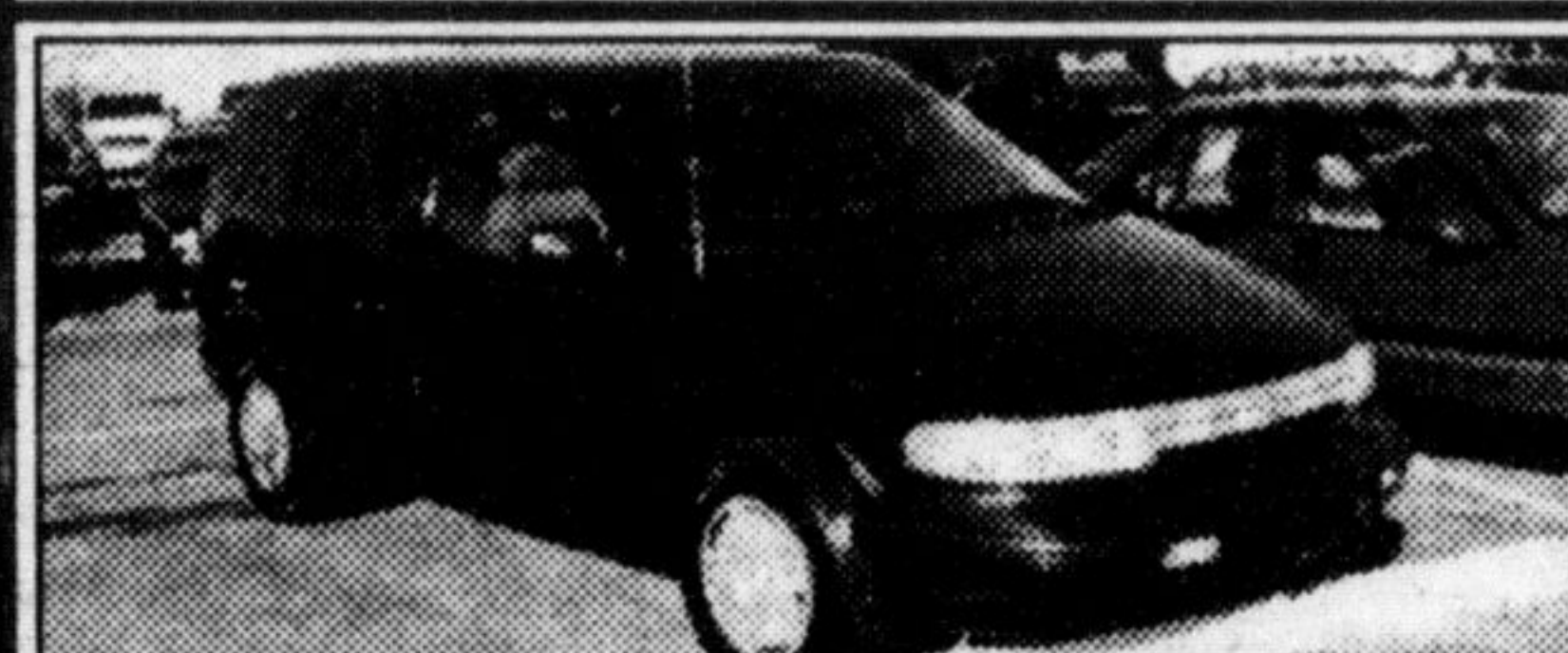
1994 VILLAGER One owner. Blue/grey cloth. V6, auto, air, pwr. wind., pwr locks, tilt, cruise, cassette, deep tinted glass.