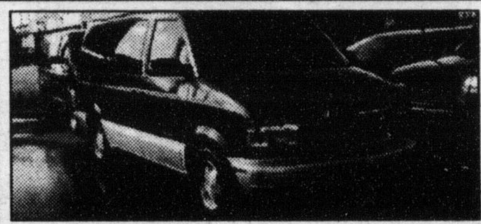
1997 SAFARI SLT AWD GM Exec. Driven. Teal/Grey cloth. Fully loaded including rear air, rear heat and trailing package. Only 43,000 kms. Balance of factory warranty.