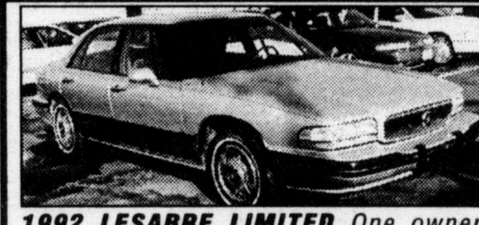
1992 LESABRE LIMITED One owner. Silver/grey cloth. Fully loaded with wire wheel covers. Excellent condition. Only 99,000 kms.