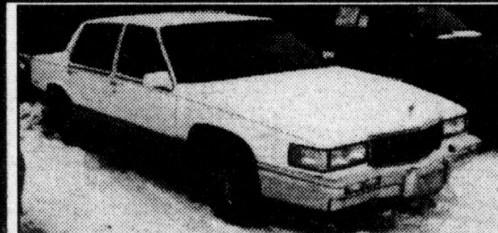
1993 CADILLAC DEVILLE One owner. White/blue. Fully loaded with all the Cadillac features. Only 62,000 kms.