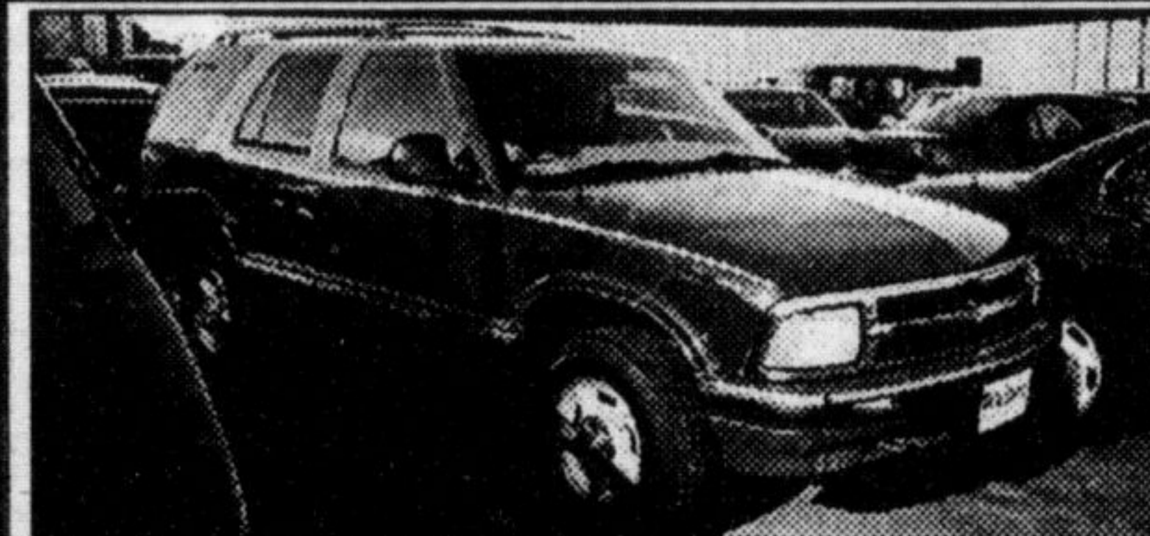
1995 CHEV BLAZER LS Red/grey cloth. 4x4, auto, air, P.wind., p.locks, tilt, cruise, cassette, alloy wheels, power seat.