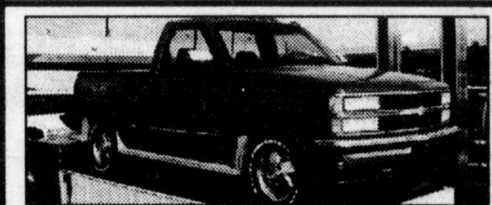
1993 CHEV 1500 SLE Red/blue cloth. 4x4, 350V8, auto, air, tilt, cruise, cassette, tonneau cover, alloy wheels, running lights, running boards, mint condition. Only 63,000 kms.