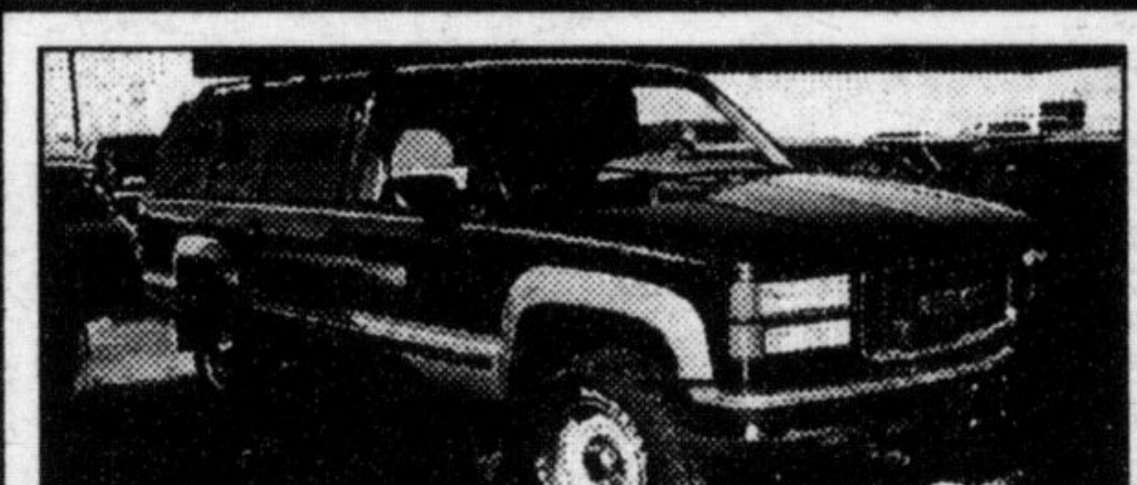
1995 SUBURBAN One owner. Two tone green/neutral cloth, V8, fully loaded 4x4, mint condition, 52,000 kms.