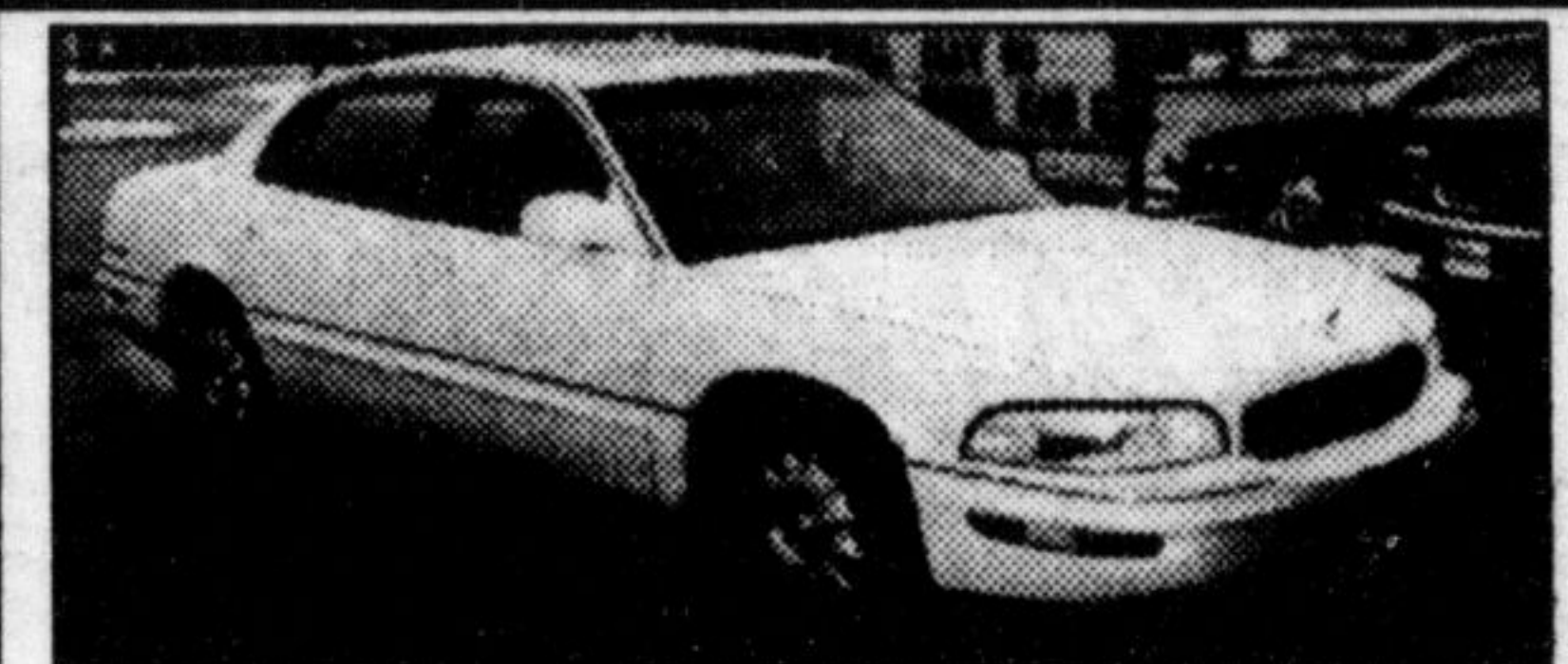
1997 BUICK PARK AVENUE White/Blue leather. Fully loaded with power moonroof and office seating package. Balance of factory warranty. Only 17,000 kms.