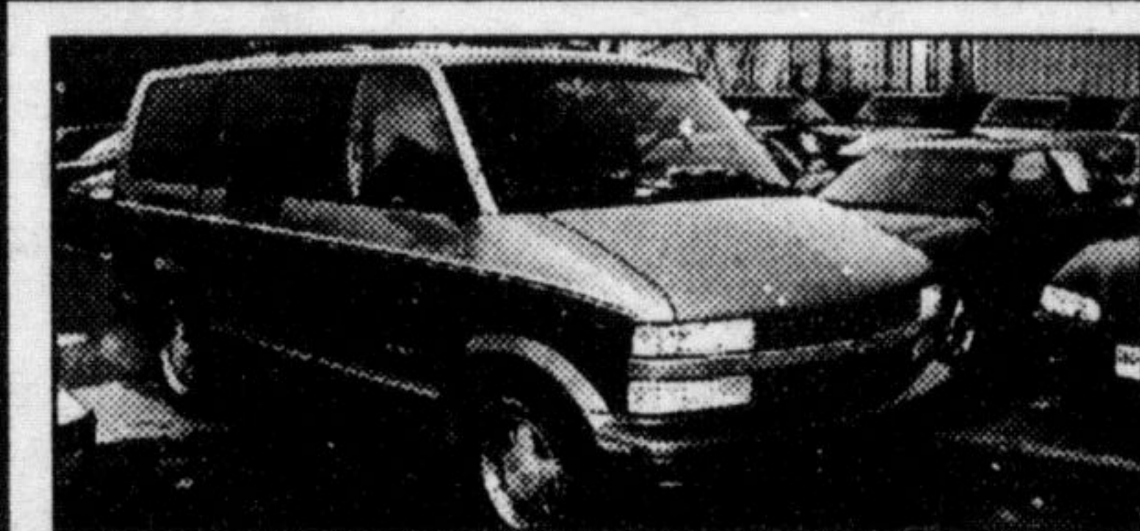
1995 ASTRO CL AWD One owner. Two-tone autumn wood, fully loaded, including dutch doors, rear air & rear heater. Only 50,000 kms.