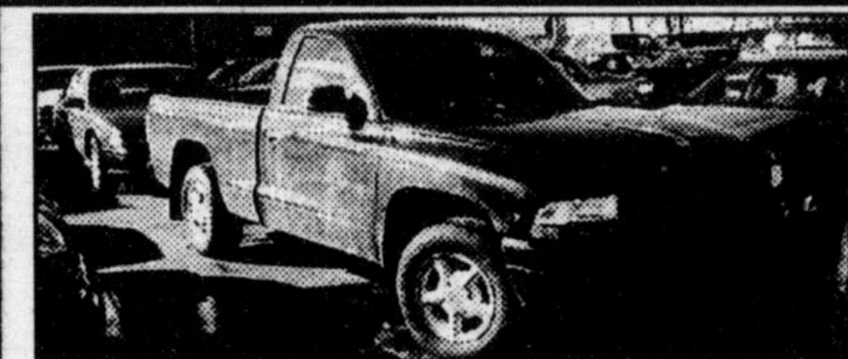
1997 DAKOTA SPORT One owner. Green/grey cloth, 5 speed, Magnum V6, air cond., tilt, cassette, alloy wheels. Balance of factory warranty. Only 18,000 kms.