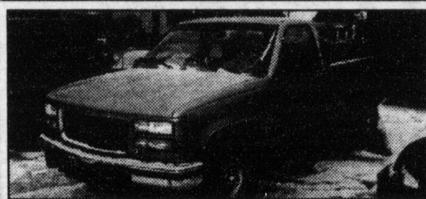
1998 GMC K2500 4X4 PICK-UP SLE Pewter/Pewter cloth, turbo diesel. Fully loaded, automatic. Balance of factory warranty. Only 6,500 kms.