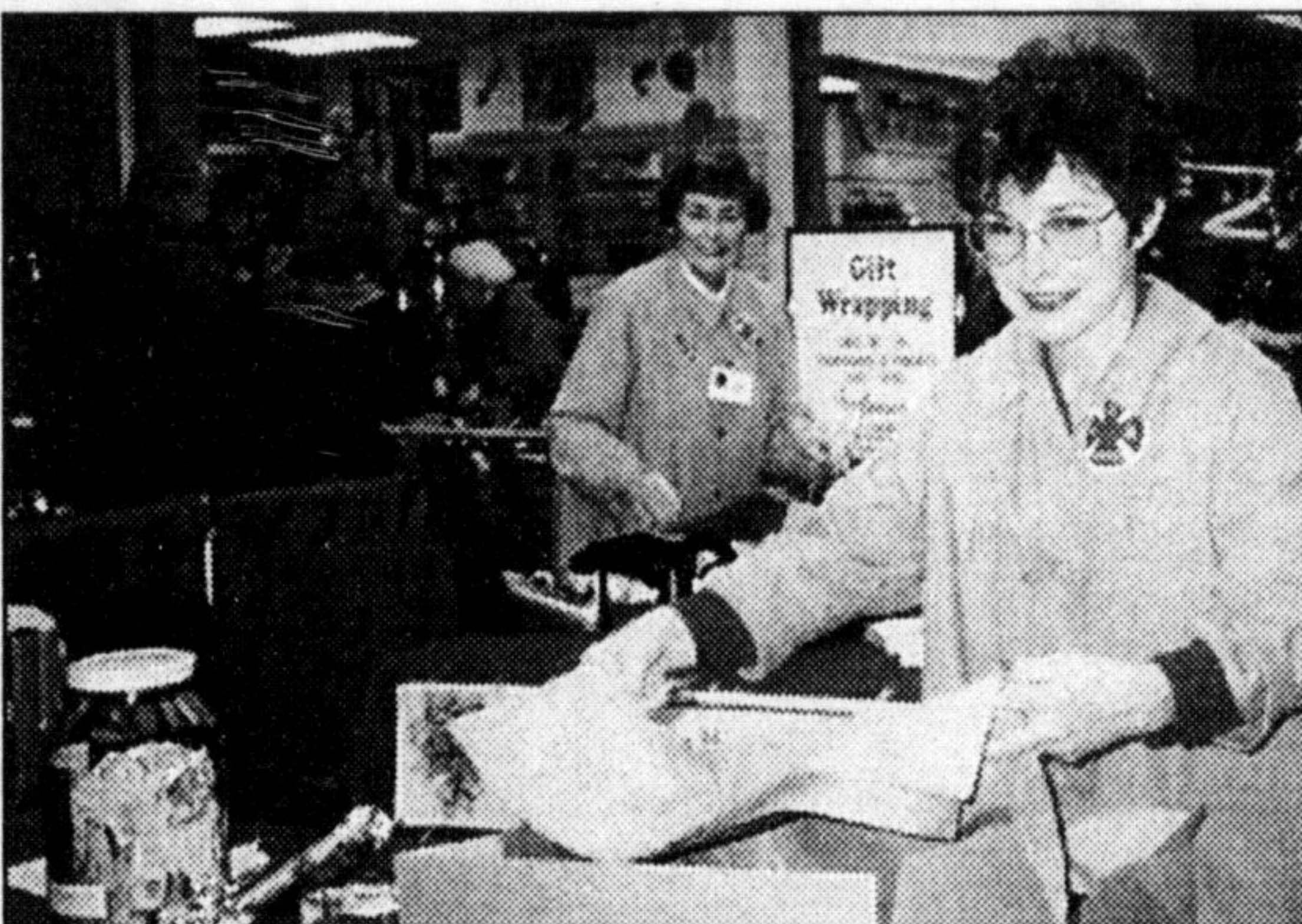
The Auxiliary volunteers gladly wrap last year's packages at the Milton Mall.

bring your packages to the Milton Mall and the Auxiliary will wrap it FREE! Hours: December 16th to 20th and 22nd and 23rd-11:00 a.m. to close, Sunday, December 21st-10 a.m. to close, Wednesday, December 24th-9 a.m. to close.