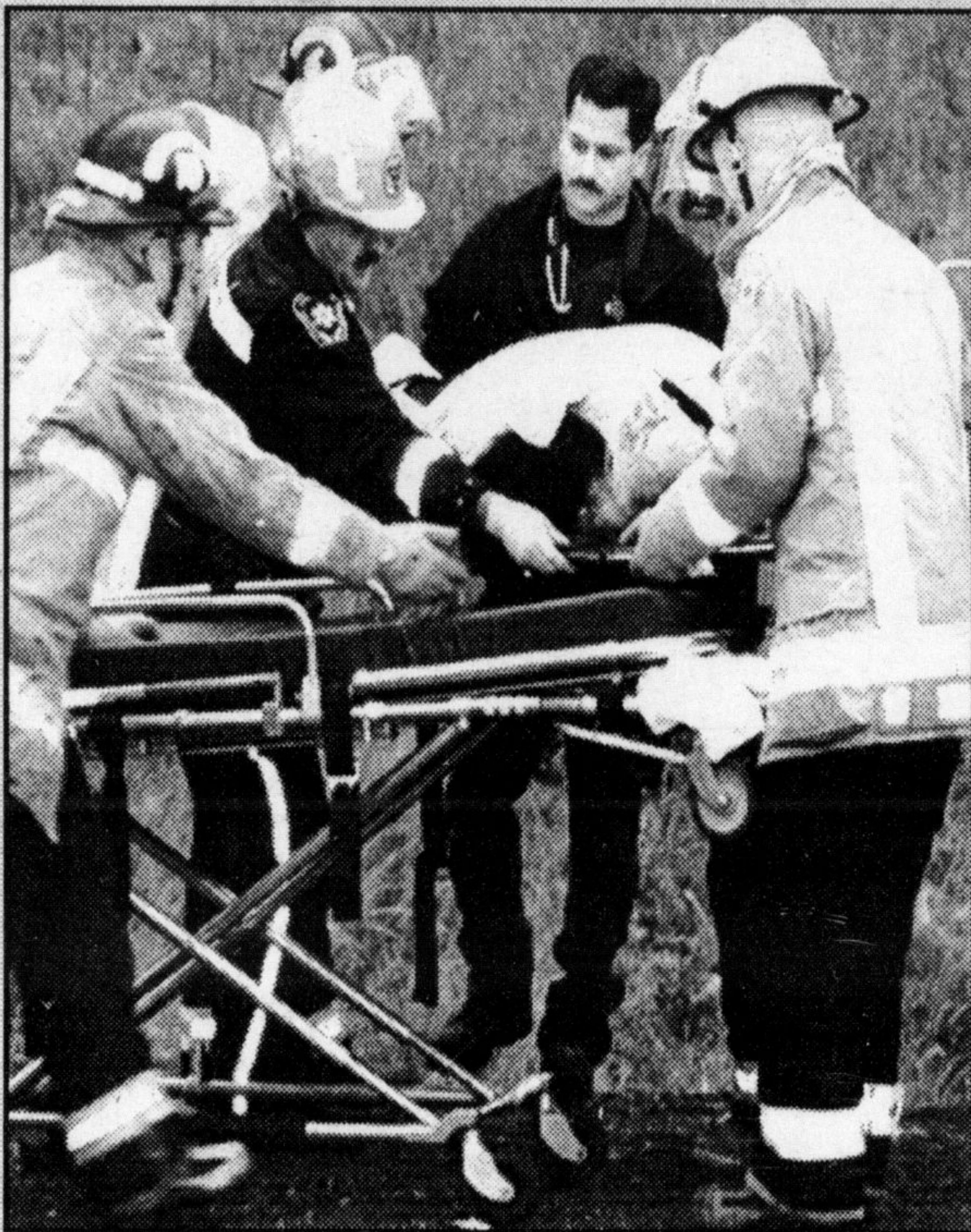
A Rockwood woman was seriously injured and her BMW destroyed Monday afternoon in a collision at Derry Road and Walker's Line. The victim was flown by air ambulance to hospital.